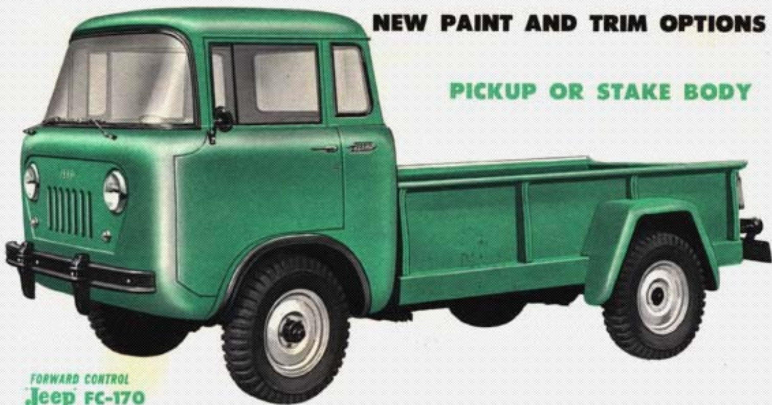
FORWARD CONTROL Jeep FC-170