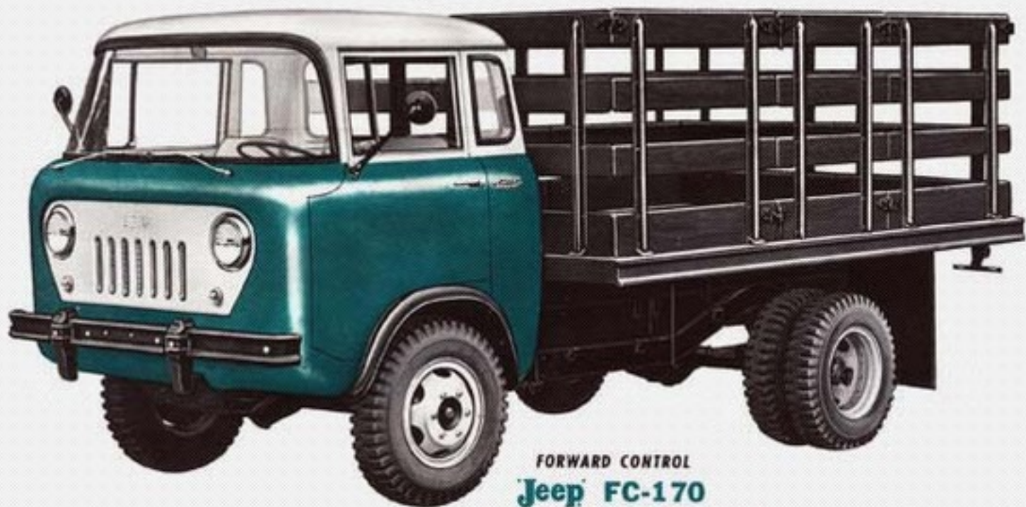
FORWARD CONTROL Jeep FC-170 DUAL WHEEL PLATFORM STAKE