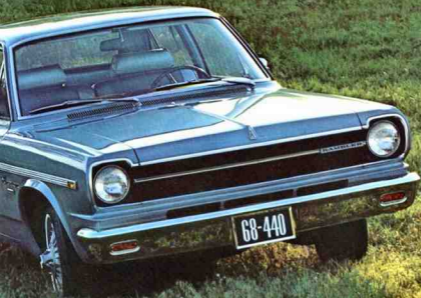
Early Green with Ford White roof. Rambler American 440 for 1968. Sedan in Safari Blue. Station Wagon in Matador Red. 1968 Rambler American Regue Hardtop in Turb Silver and black vinyl covered roof.