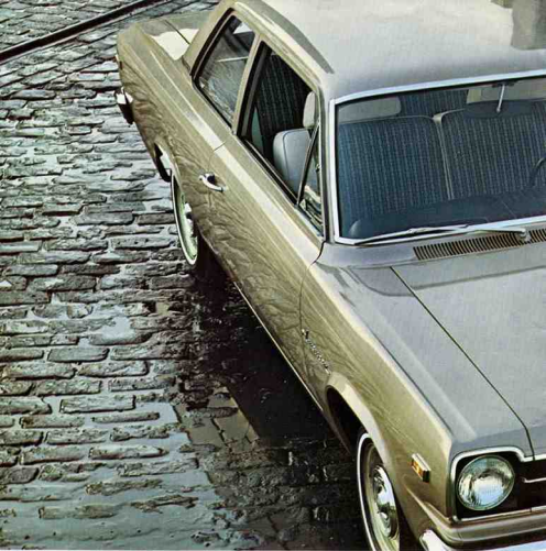
1968 Rambler American Tap-Door Sedan in Lardo Tan.