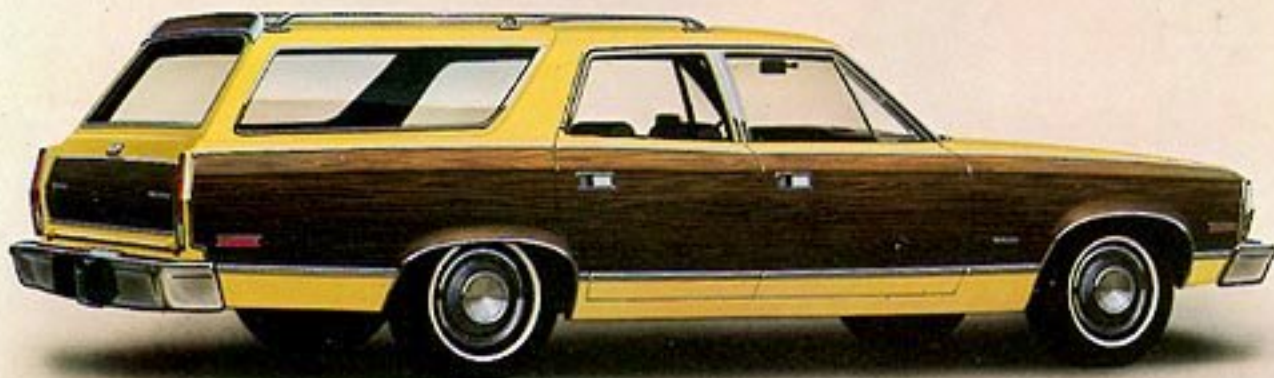
Matador 4-Door Station Wagon.