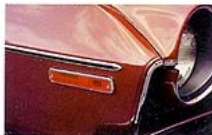
Color-keyed body side scuff molding with vinyl insert and front and rear nerling strips.