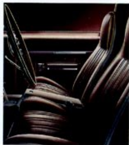
Bucket-seats in "Tru-Knit" vinyl and a floor-mounted automatic transmission with console. Available on all Matador Coupes.