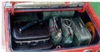
Styling did not eliminate trunk space in the Matador Coupe. You get 17.3 cubic feet of room. Even more, with the optional Space Saver spare tire.