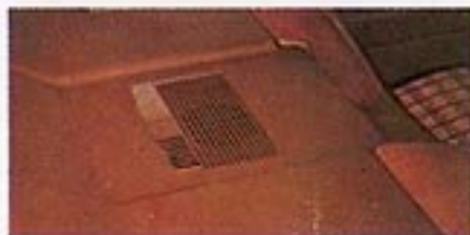
Optional Blower type rear window defogger.