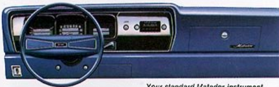
Your standard Matador instrument panel is fully padded and safety shaped. It includes soft-plastic control knobs with international symbols, Weather-Eye heating system controls and a steering wheel with a soft-feel horn bar.