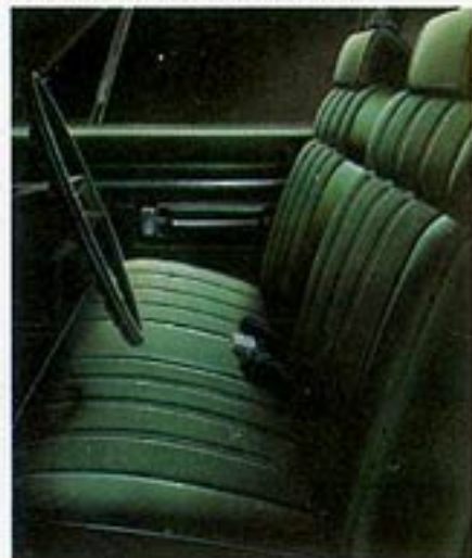
The comfortable, tough and easy-to-clean "Tru-Knit" vinyl with grained vinyl bolster is standard on the Matador Station Wagon and on the Matador "X".