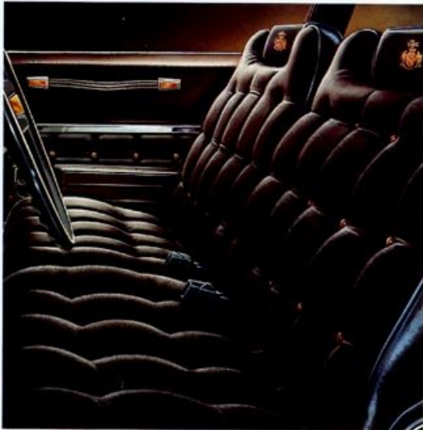
The elegant "Oleg Cassini" interior.