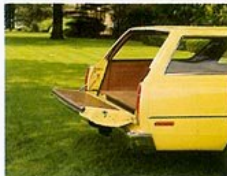
A two-way tailgate is standard on the Matador 4-Door Station Wagon so you can load your passengers or cargo easily.