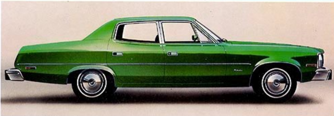
Matador 4-Door Sedan.

Matador—planned and built for outstanding value and the good things you want in a car.