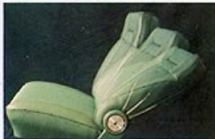
Optional Individual reclining seats.