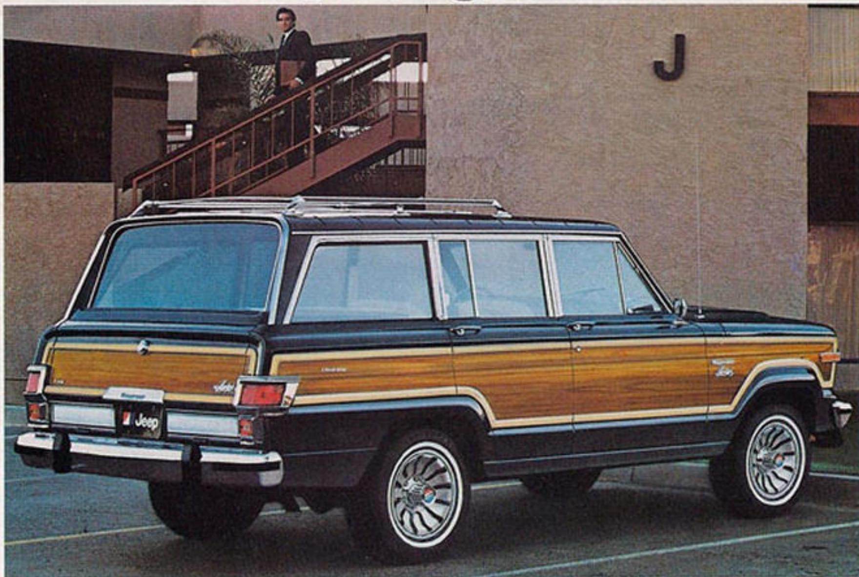
Wagoneer Limited (w/options)