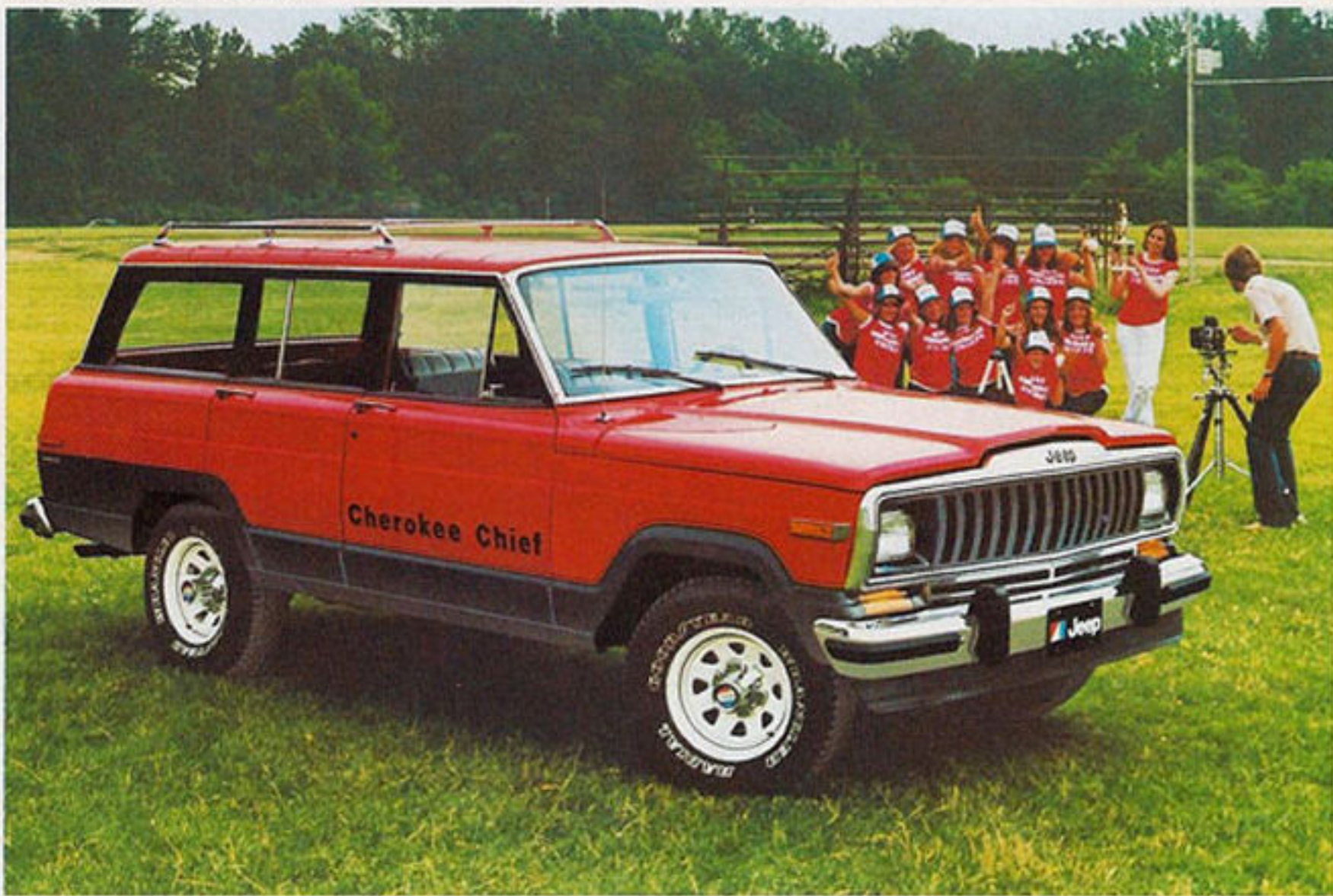
Cherokee Chief 4-door w/options