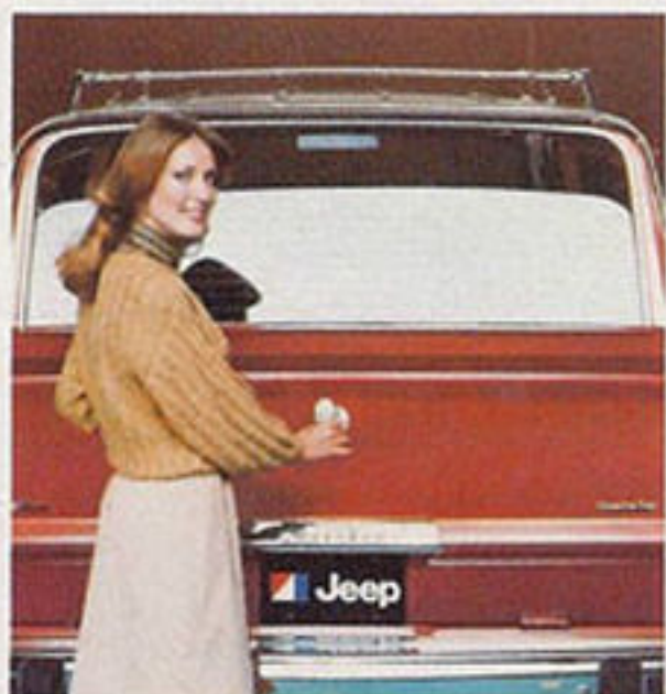
Rear window defroster and power tailgate