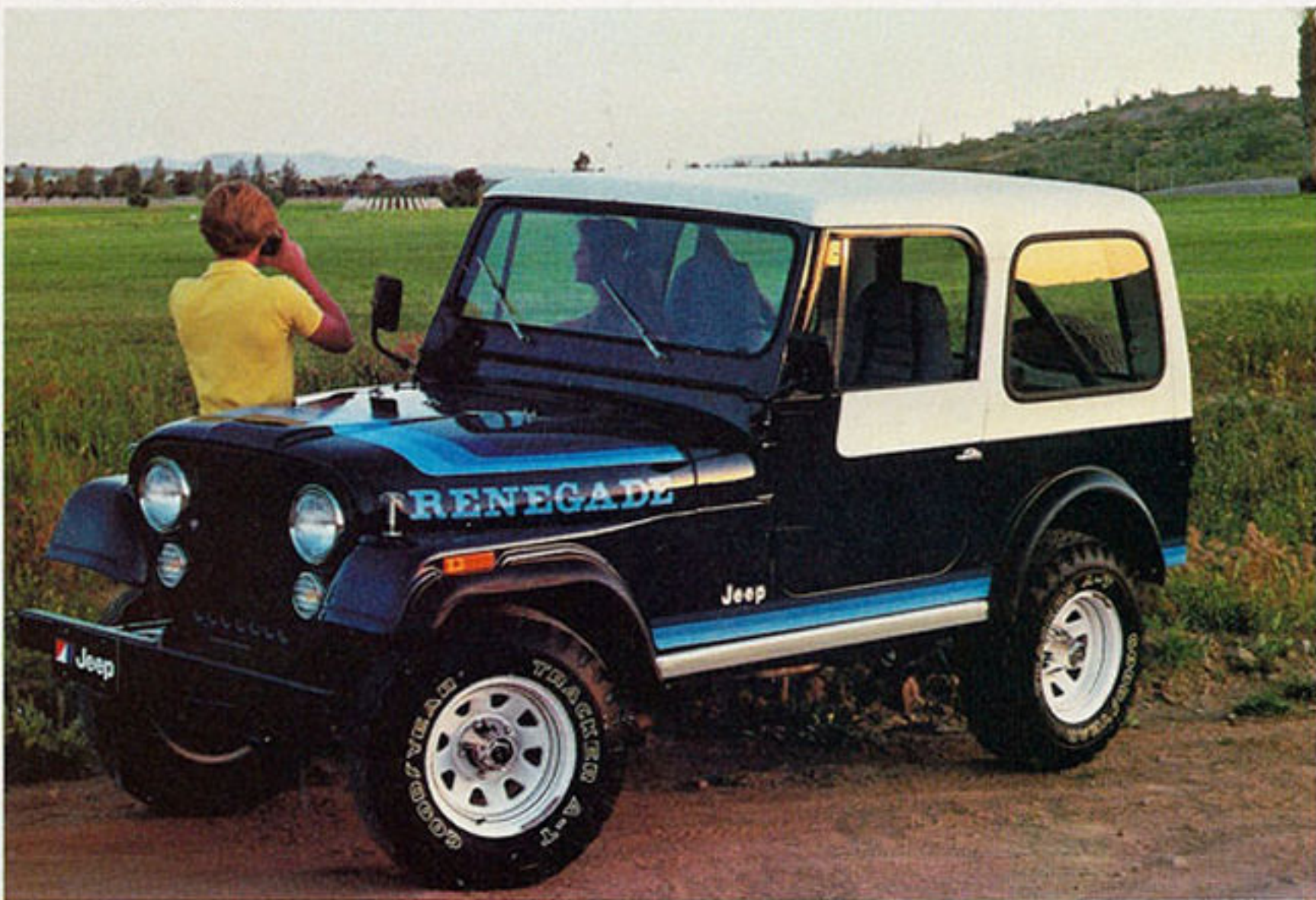
CJ-7 Renegade w/options