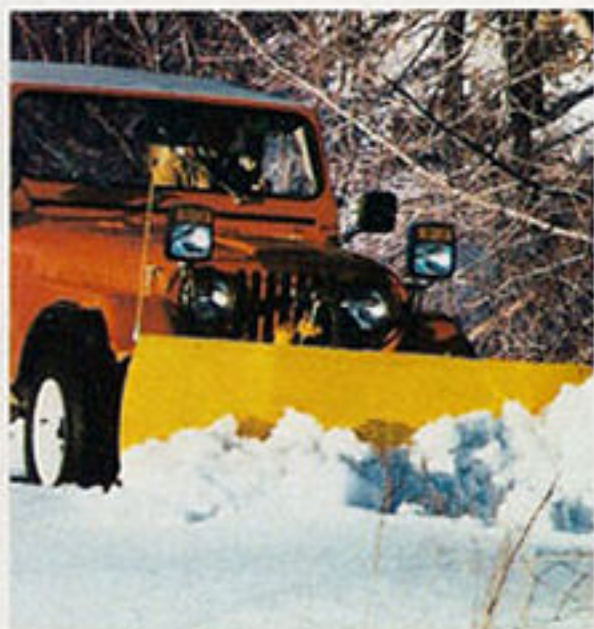
CJ snowplow (dealer installed)