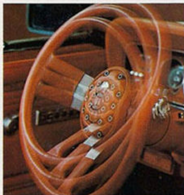
Tilt steering wheel (Std. on Limited)