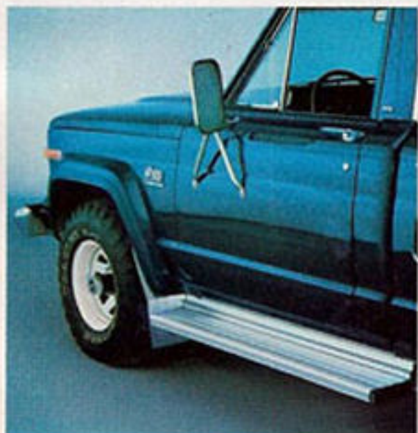
Running boards (dealer installed)