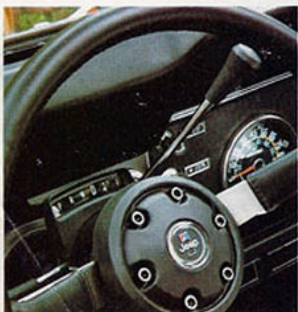
Automatic transmission (CJ-7 only).