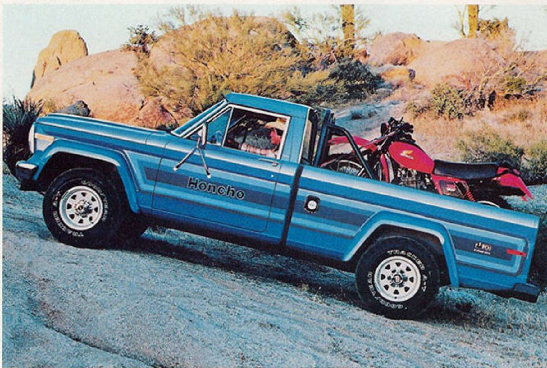
J-10 Honcho Townside (w/options)