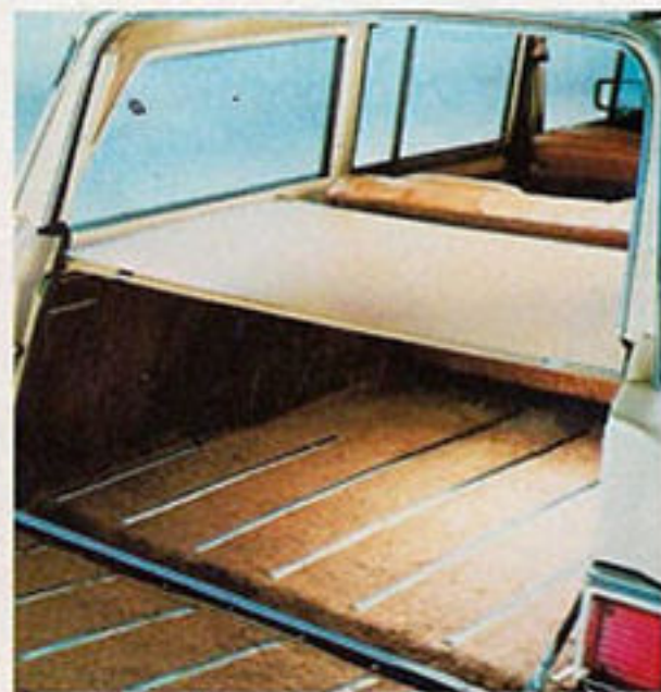
Cargo area cover (Std. on Limited)