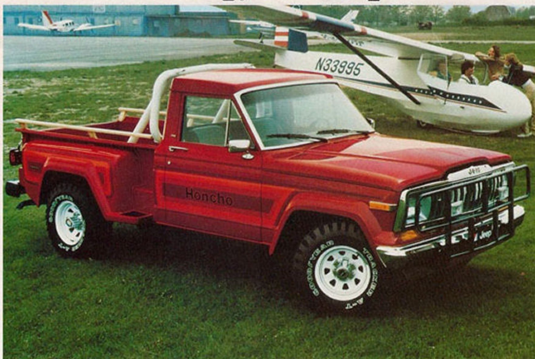
J-10 Honcho Sportside