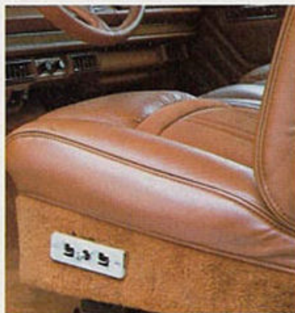
6-way power seat (Std. on Limited)