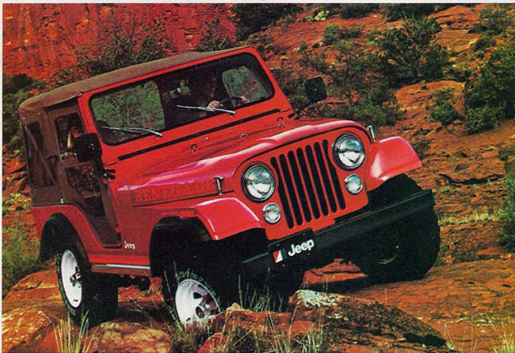
CJ-5 Renegade w/options