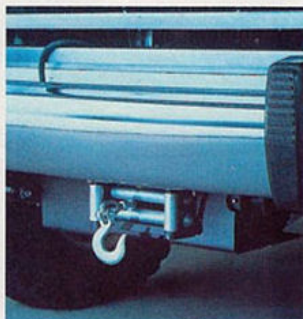
Hidden winch (dealer installed)