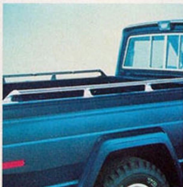
Truck rails (dealer installed)