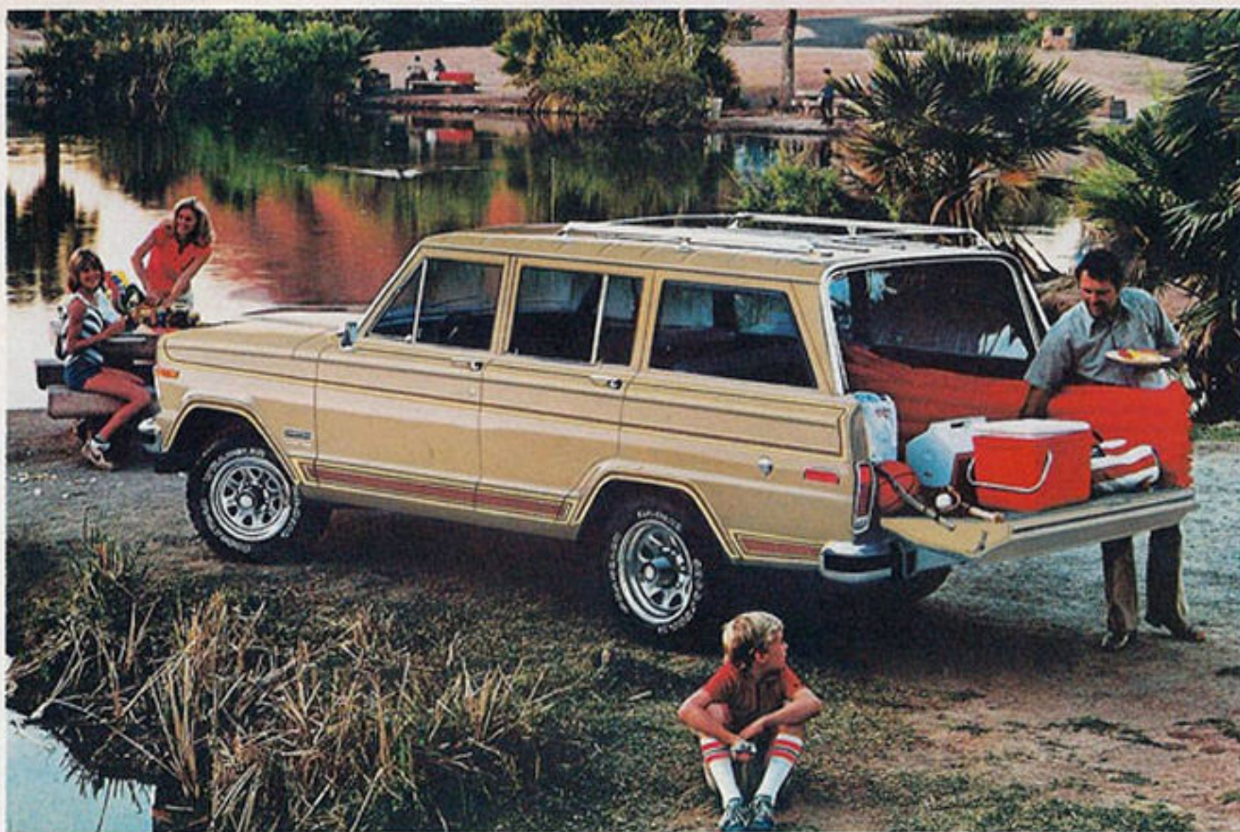
Cherokee Laredo 4-door