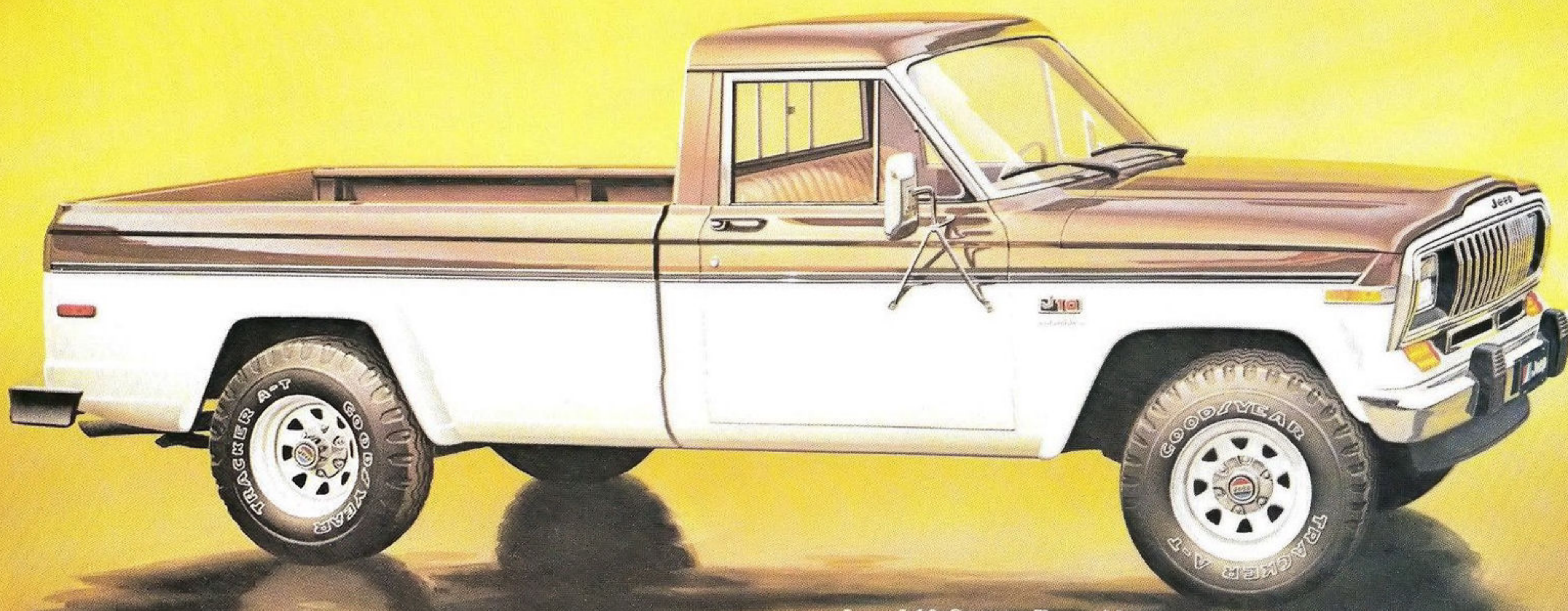
Jeep J-10 Custom Townside