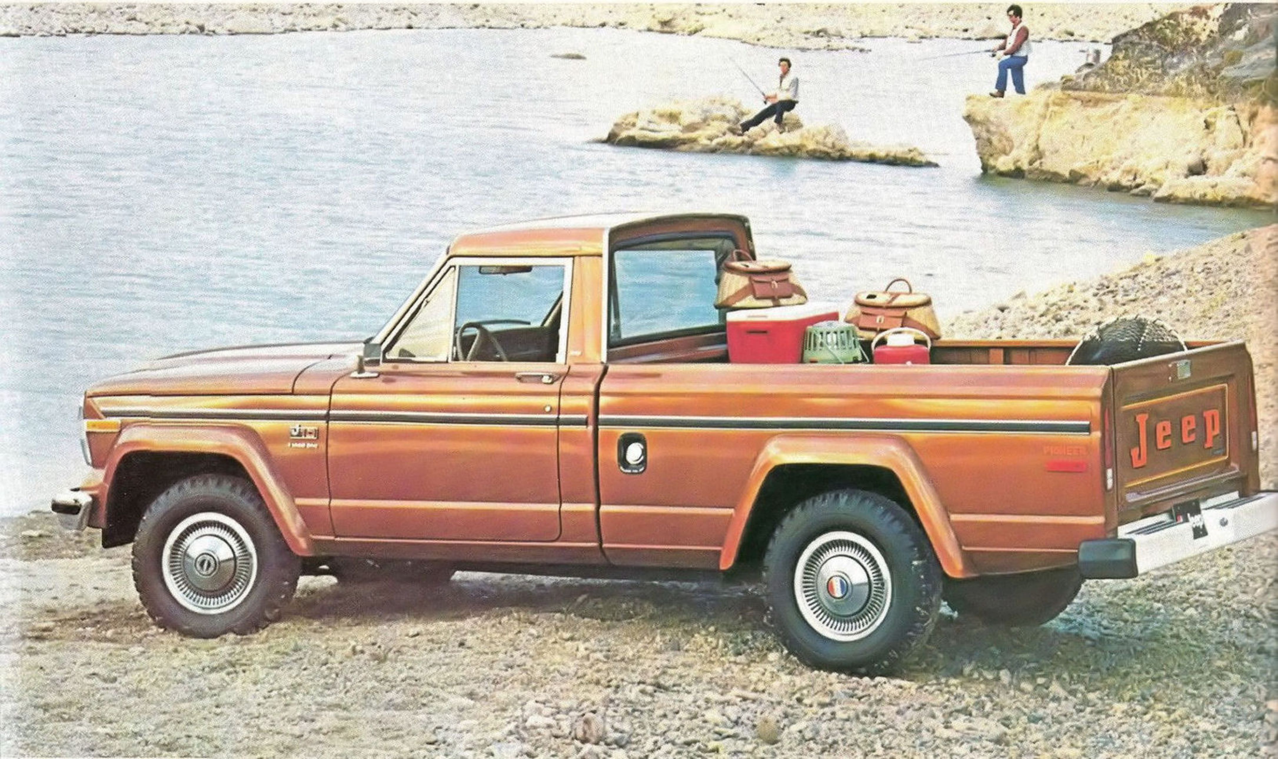
J-10 Pioneer (below)