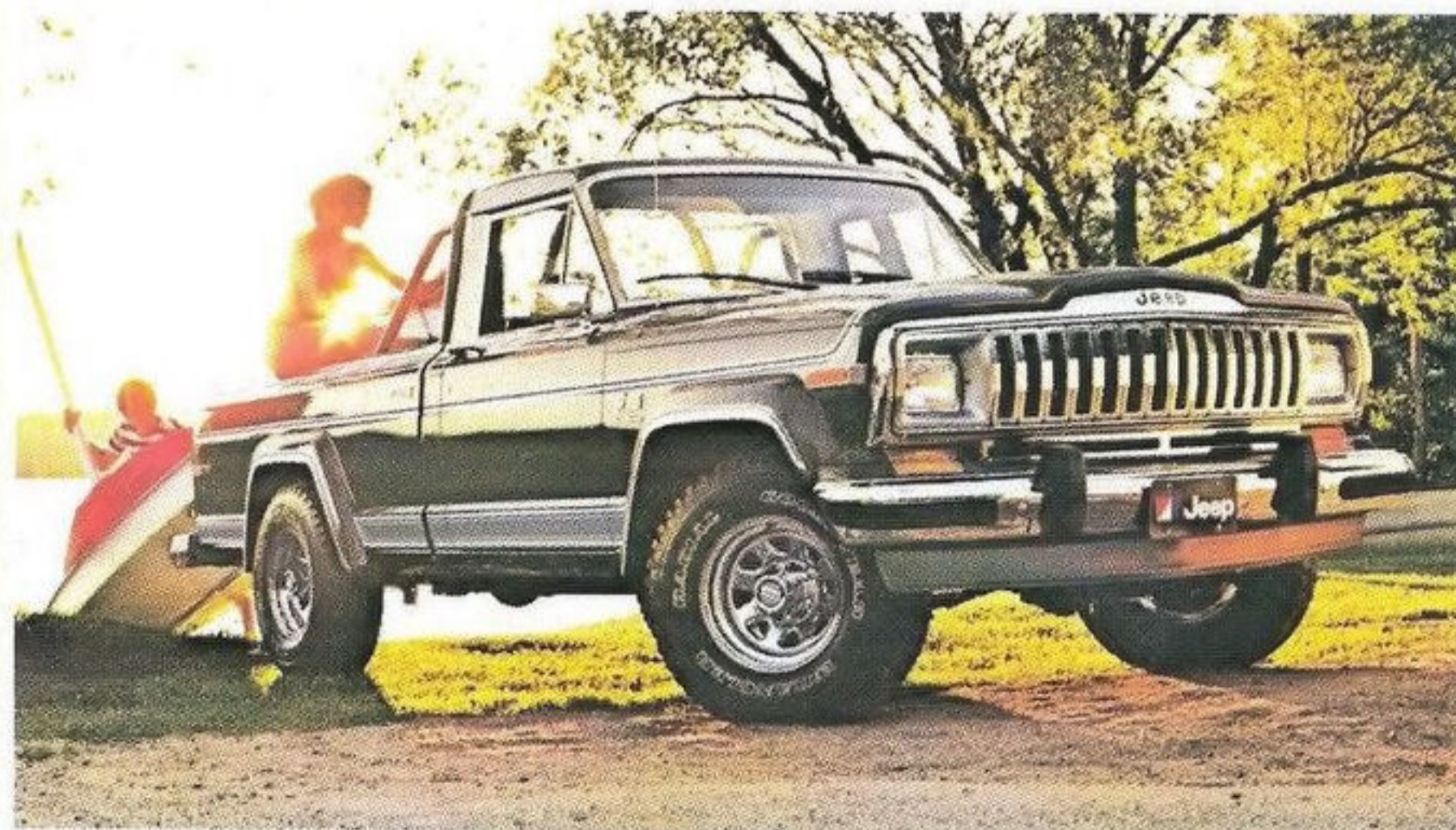
Jeep J-10 Laredo Townside