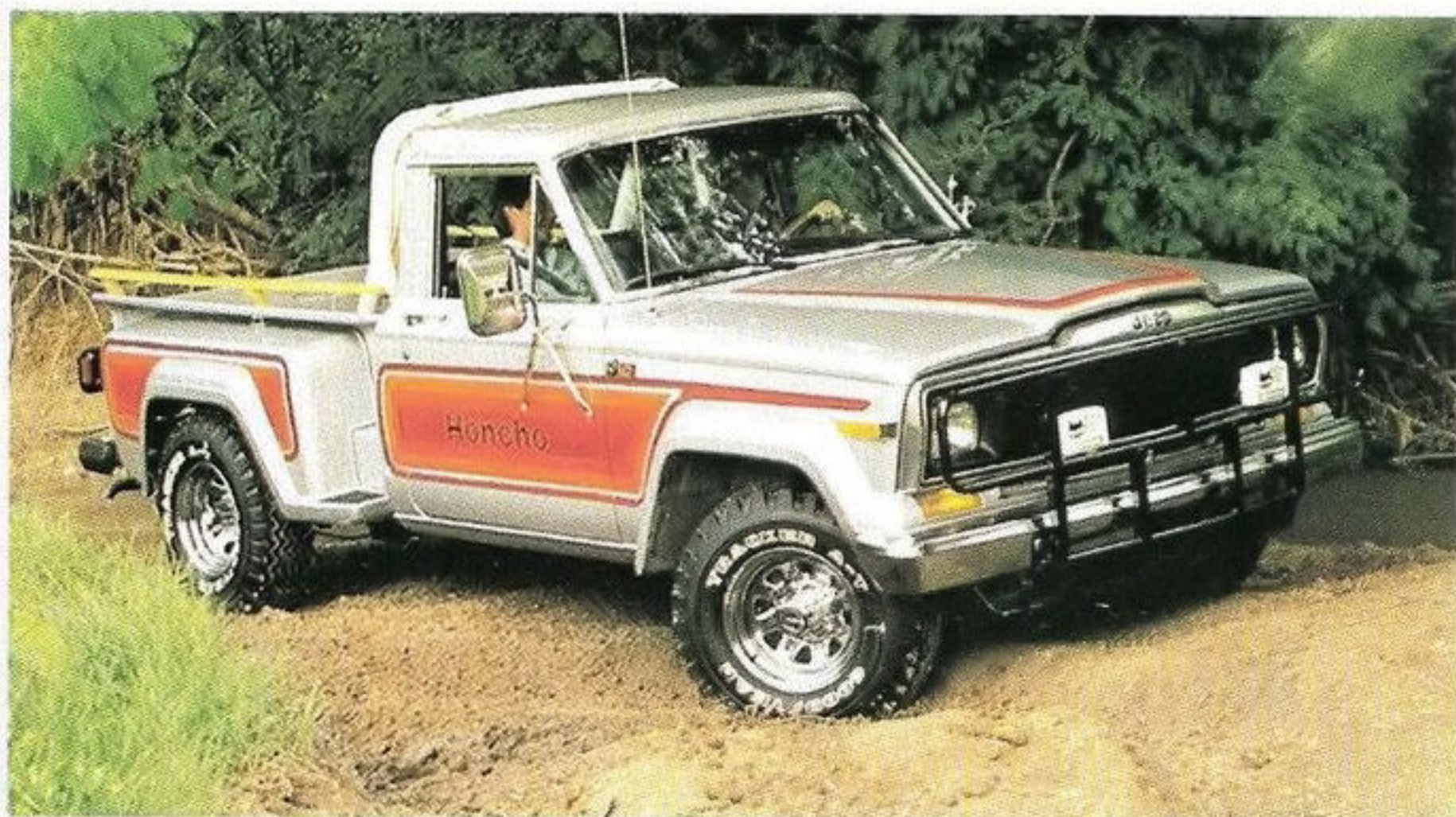
Jeep J-10 Honcho Sportside