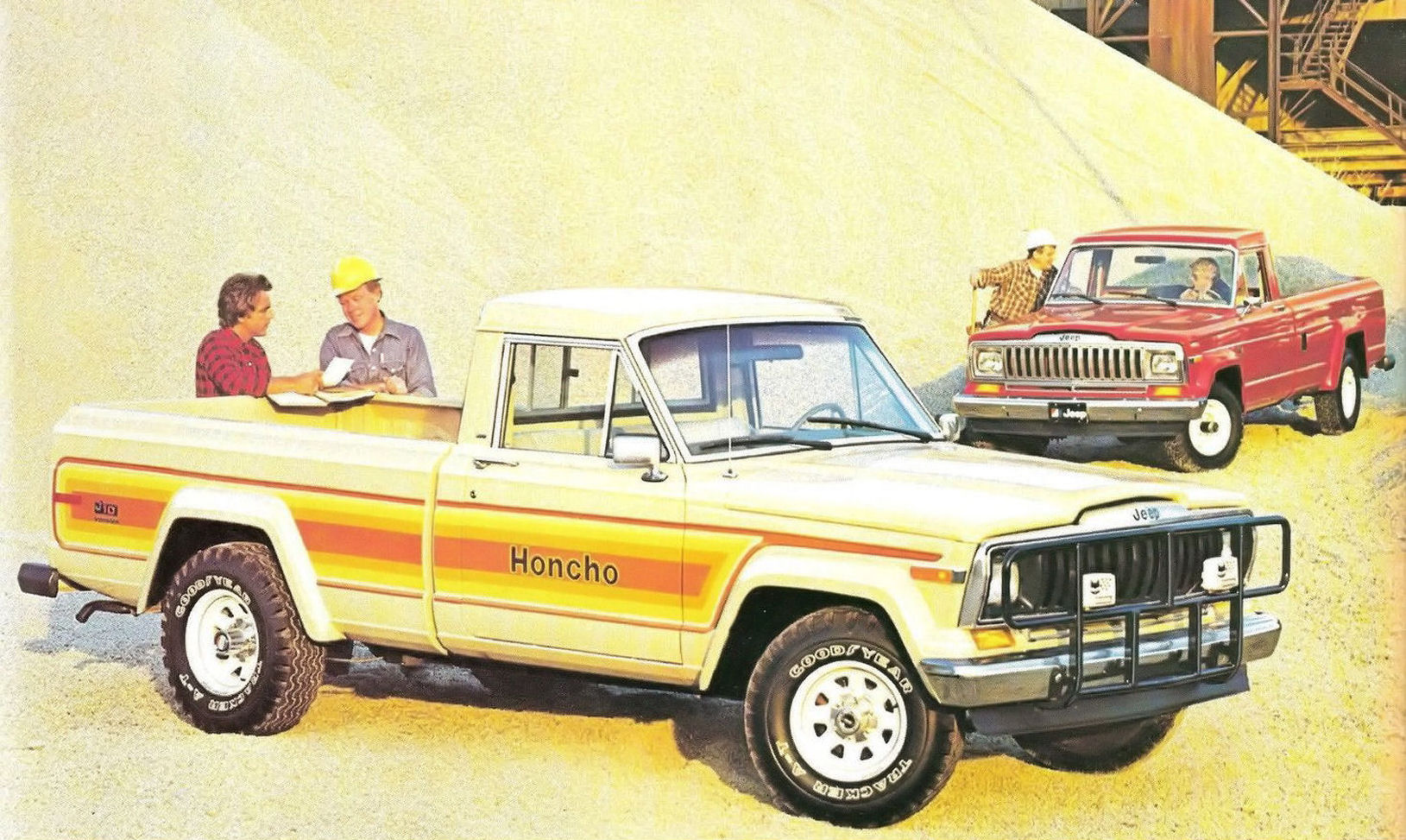
J-10 Honcho and J-10 Base (above)