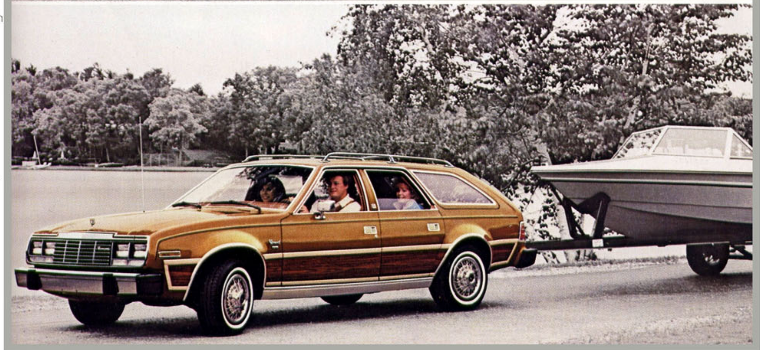
Concord Limited Wagon