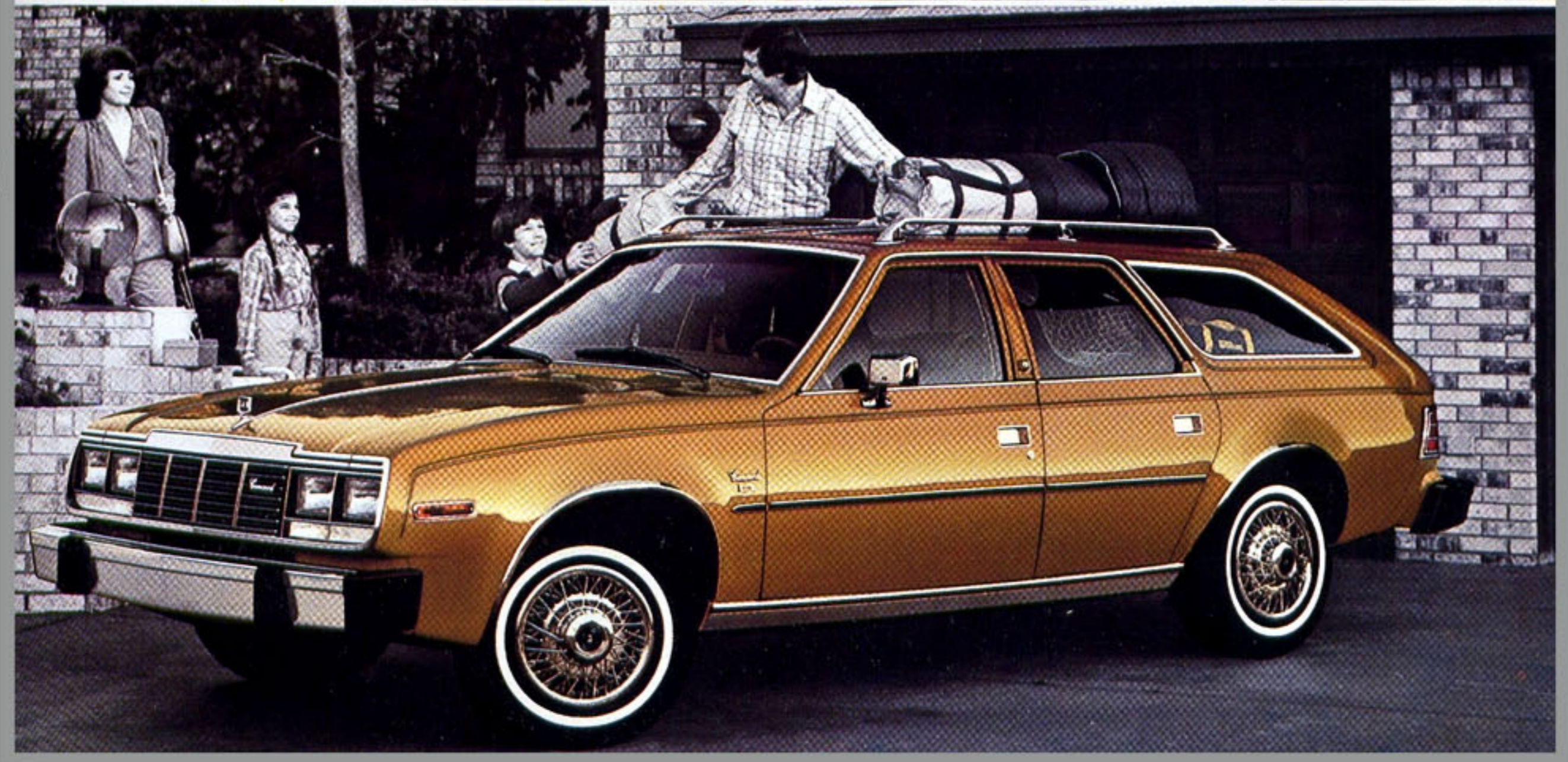
Concord DL Wagon