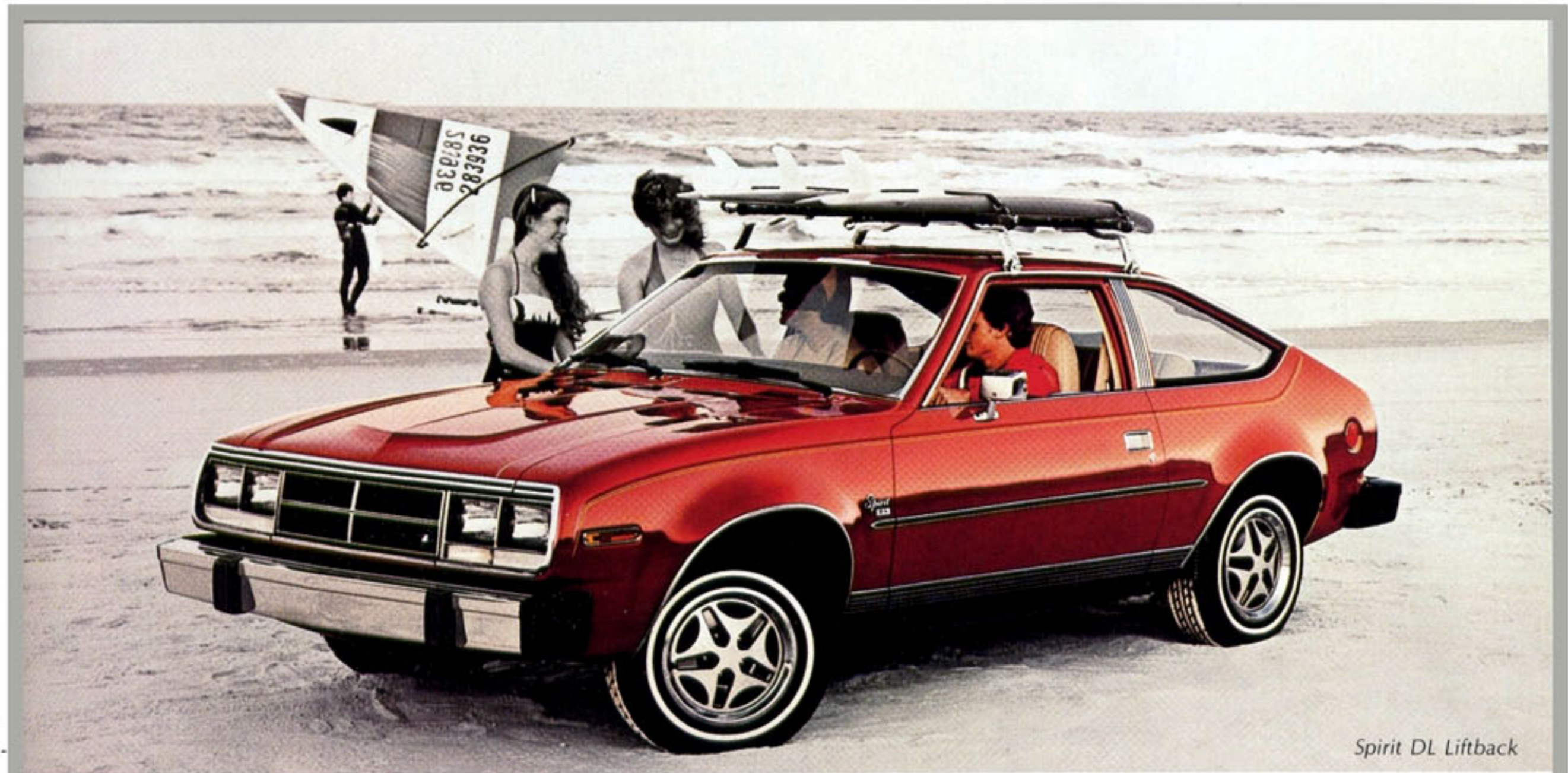
Spirit DL Liftback