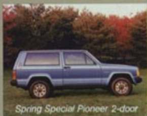
Spring Special Pioneer 2-door

Turbo-Diesel ... Jeep Cherokee offers the only inter-cooled turbo-diesel engine in its class. Only in a Jeep!