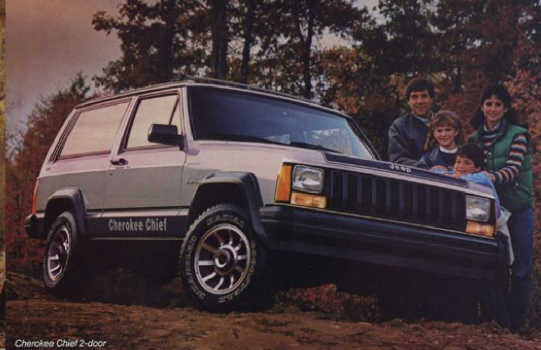
Cherokee Chief 2-door