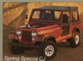
Spring Special CJ

*Use these figures for comparison. Results may differ. CA figures lower. *Manufacturer's suggested retail price. All prices subject to change without notice.