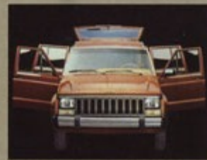
Only Cherokee has the ease of four doors.