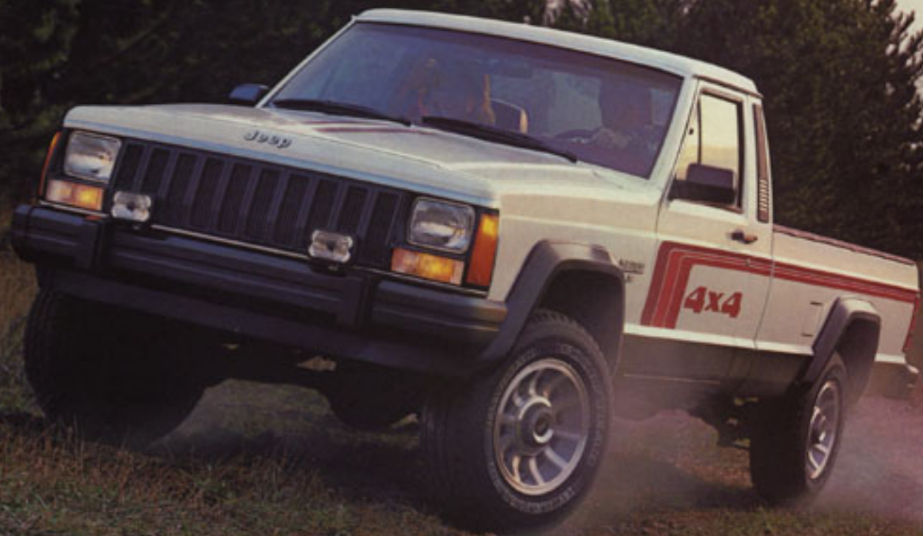
New Jeep Comanche