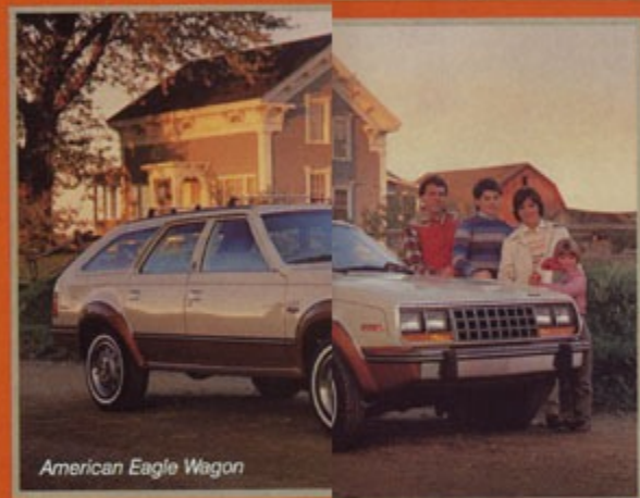
American Eagle Wagoneer

American Eagle defies comparison! It is a well-appointed and equipped vehicle that's ready to take you and your family almost anywhere—in style and comfort—