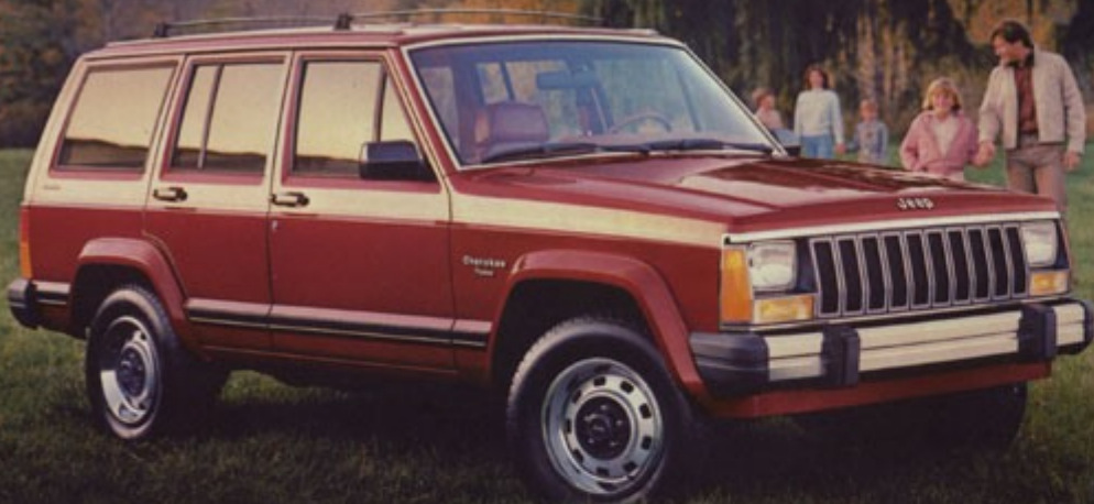
Cherokee Pioneer 4-door