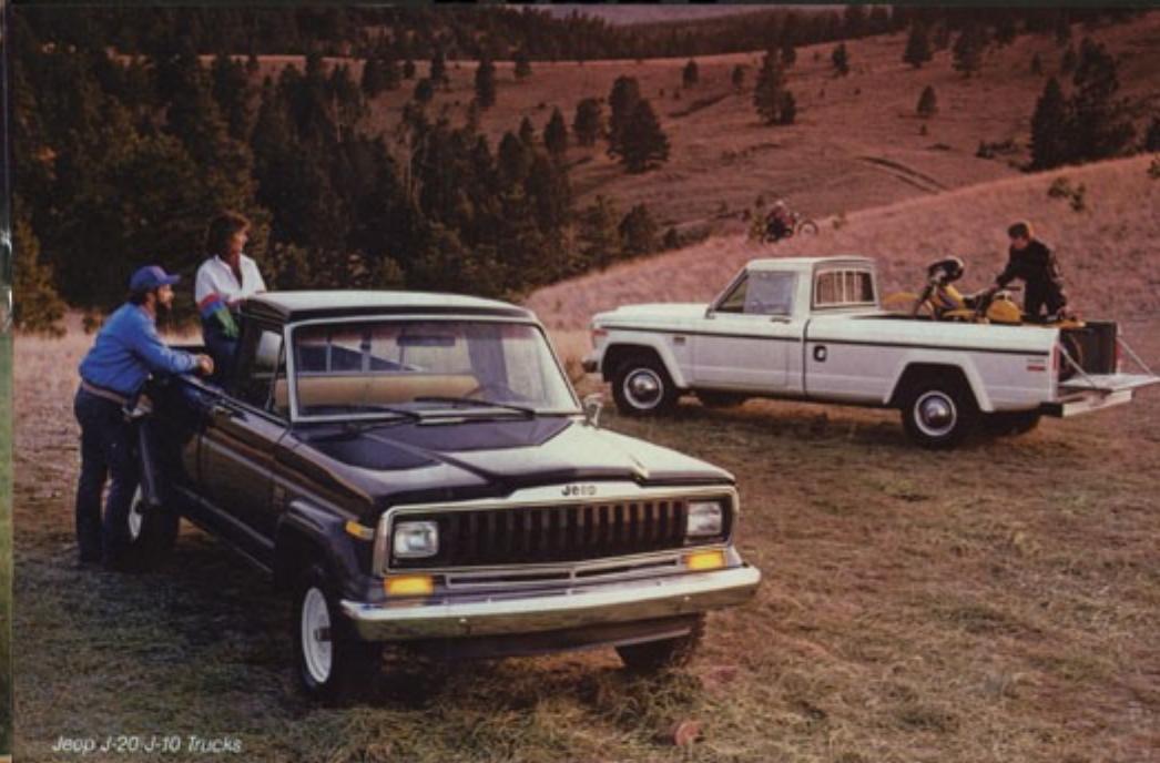
Jeep J-20 J-10 Trucks