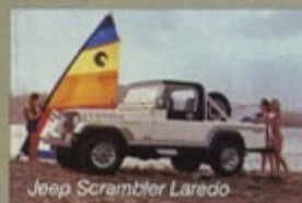
Jeep Scrambler Laredo

Compare Jeep Trucks to the "competition." You'll see that only Jeep Trucks offer optional Selec-Trac, the all-surface "shift-on-the-fly" system that lets you shift from 2-wheel drive to 4-wheel drive at the flick of a switch, from the driver's seat...without stopping.