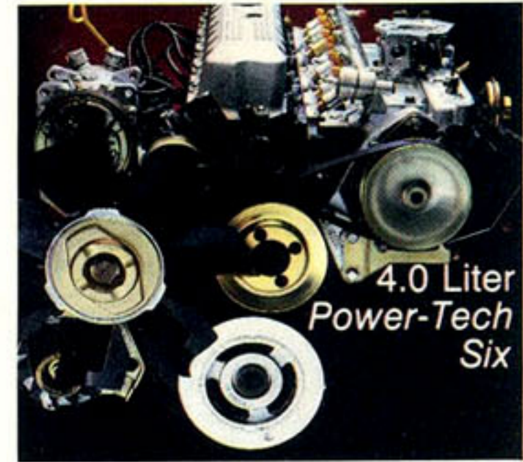
4.0 Liter Power-Tech Six