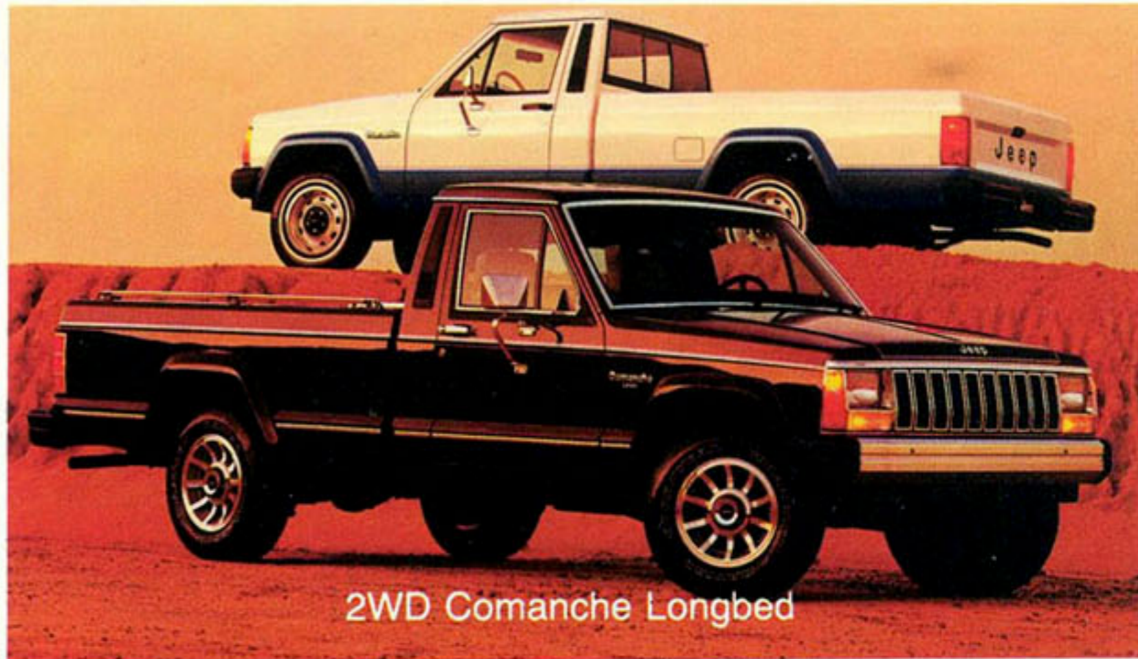
2WD Comanche Longbed

Last year's "Four Wheeler of the Year" (named by Four Wheeler magazine) adds a new chapter to its legend with an available 6-foot short bed. Comanche pickup available in 2-wheel drive or 4-wheel drive, longbed or shortbed, and four Comanche models: Base, Pioneer, Chief, and Laredo. Plus, the specially equipped 2WD or 4WD SporTruck. It's worth a look.