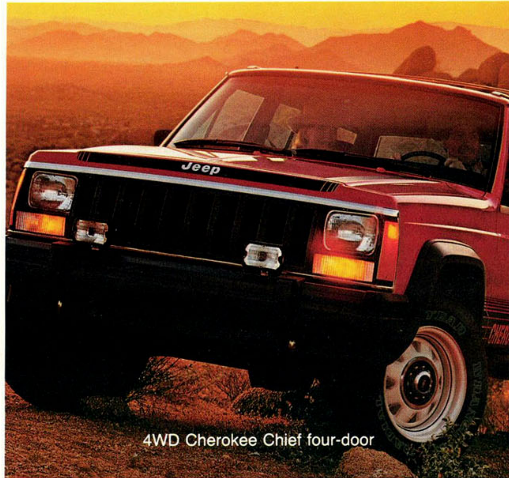
4WD Cherokee Chief four-door