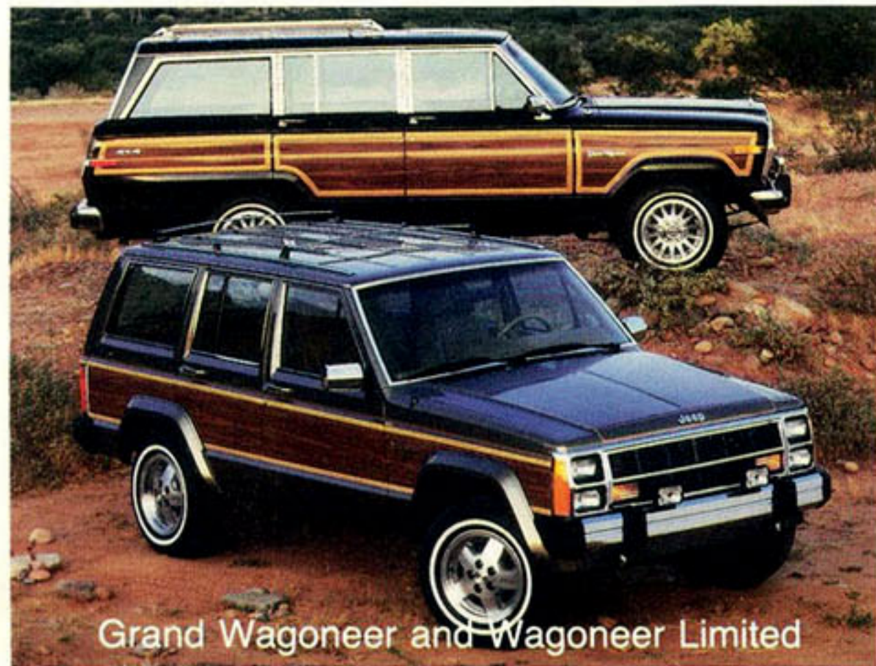
Grand Wagoneer and Wagoneer Limited