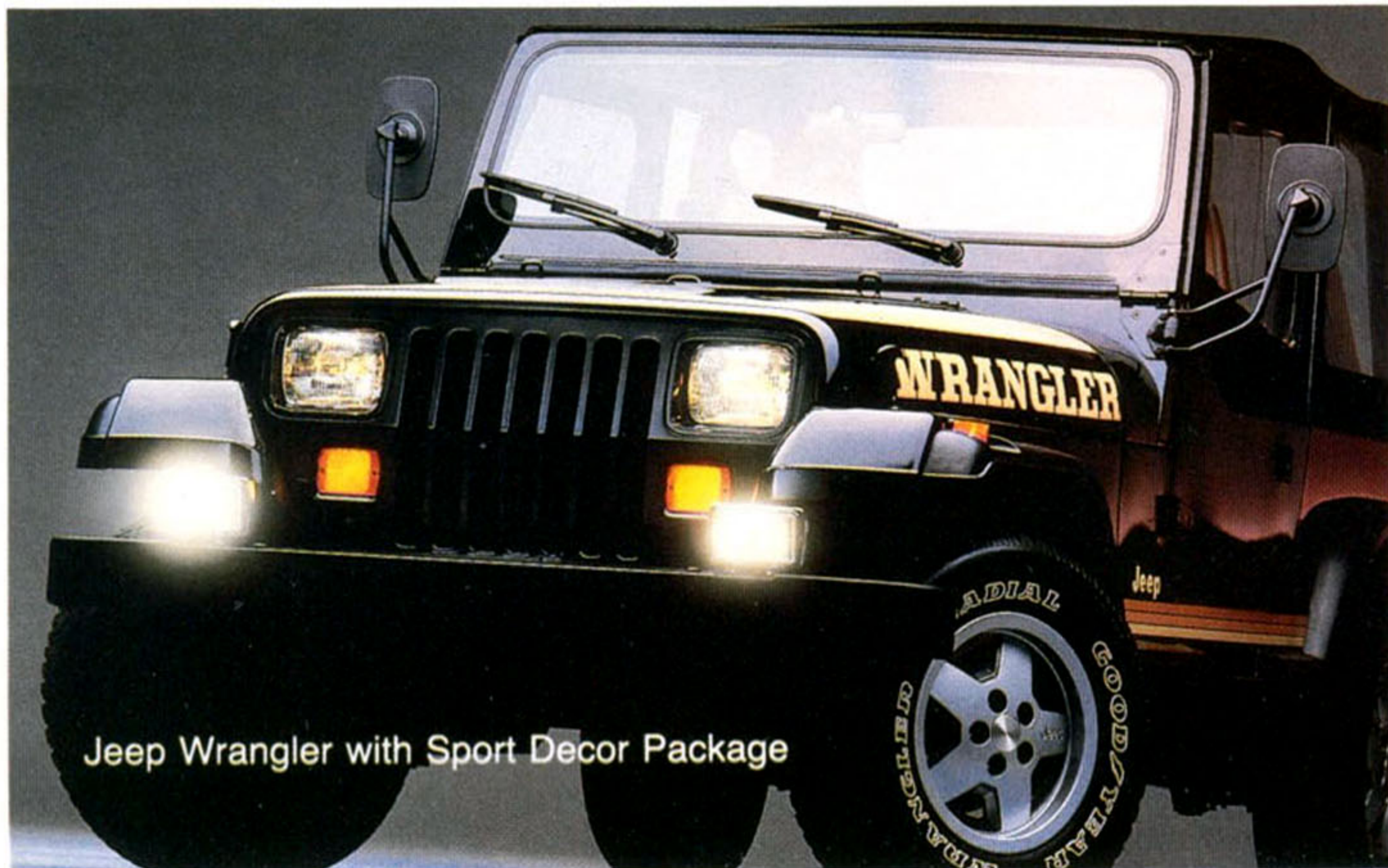
Jeep Wrangler with Sport Decor Package

suspension, 15"x7" wheels, full instrumentation, standard soft top with hard half-doors (or available hard top), and seating for four adults. Wrangler is also available in Laredo, or with Sport Decor Package.