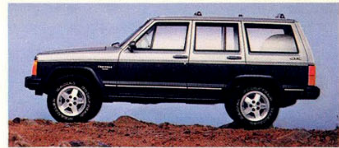
4WD Cherokee Pioneer four-door with two- tone paint treatment