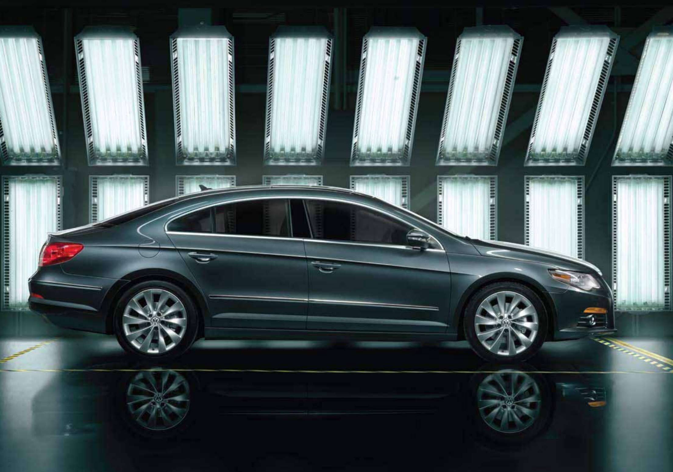
VR6 Sport, Island Gray, 18" Interlagos Wheels