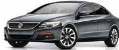
Island Gray Metallic