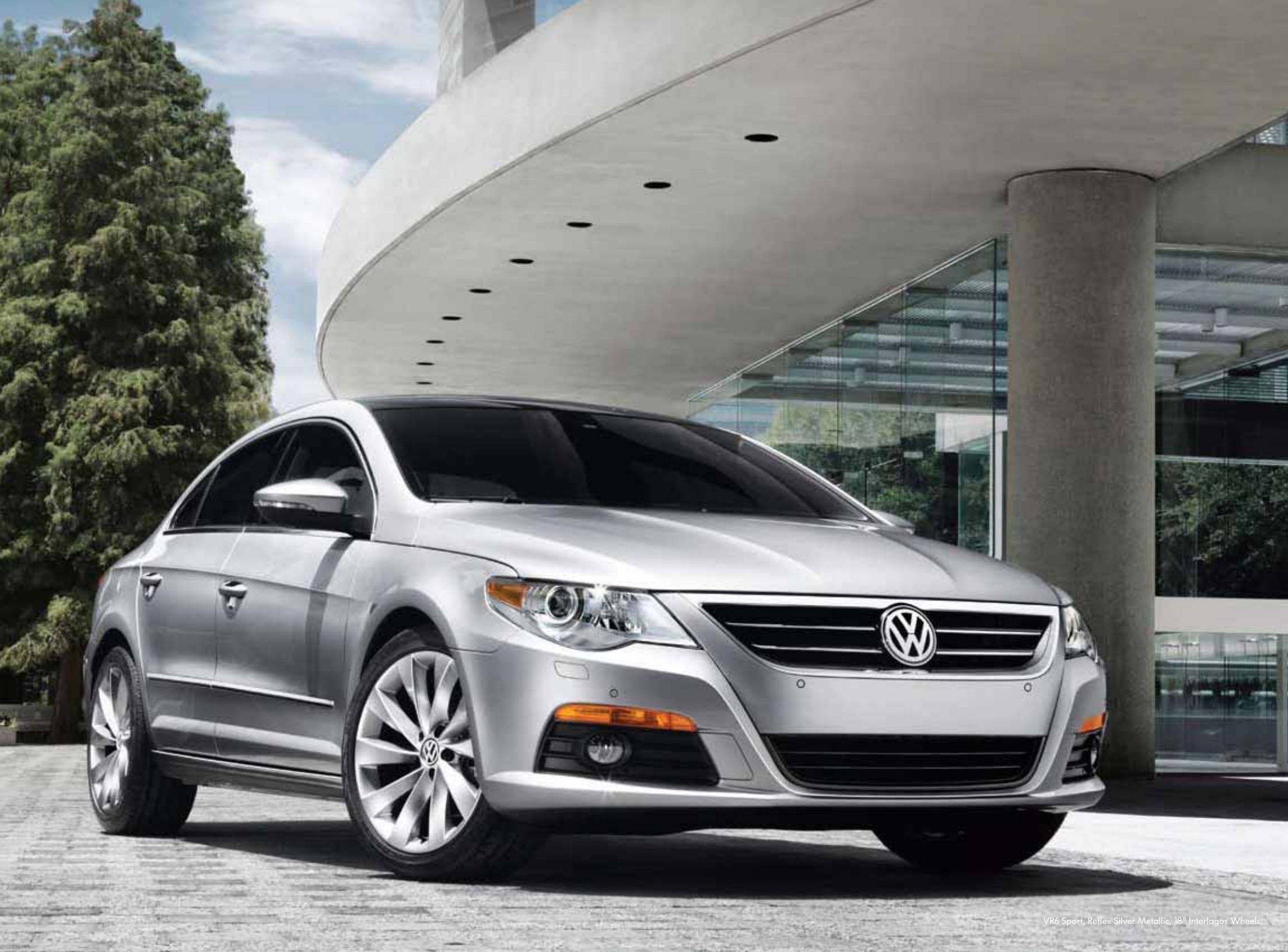
VR6 Sport, Reflex Silver Metallic, 18" Interlagos Wheels.