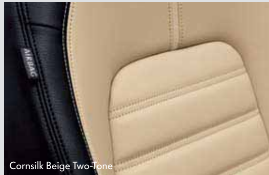
Cornsilk Beige Two-Tone