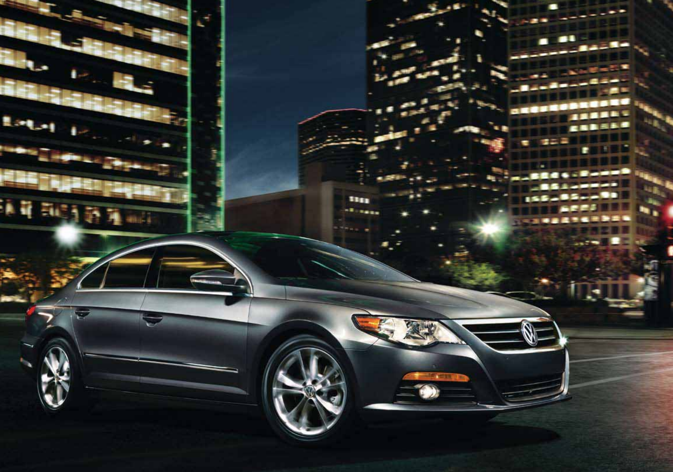
Luxury, Island Gray, 17" Spa Wheels