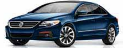
Shadow Blue Metallic