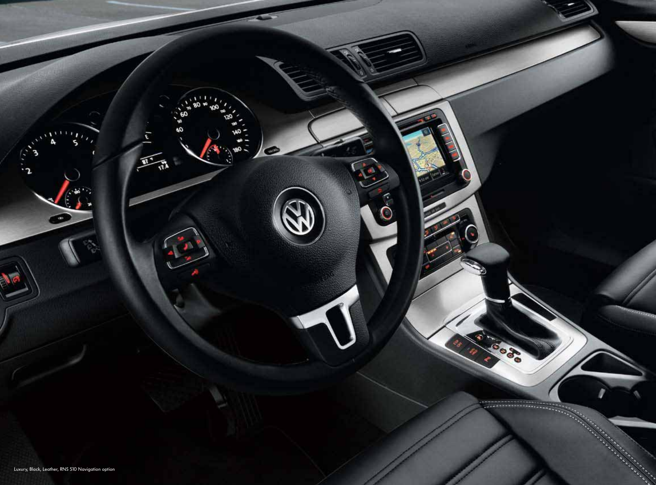
Luxury, Black, Leather, RNS 510 Navigation option