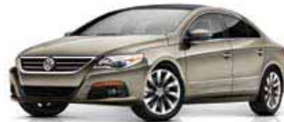
Light Brown Metallic