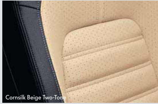
Cornsilk Beige Two-Tone