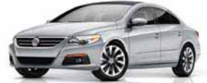
Reflex Silver Metallic