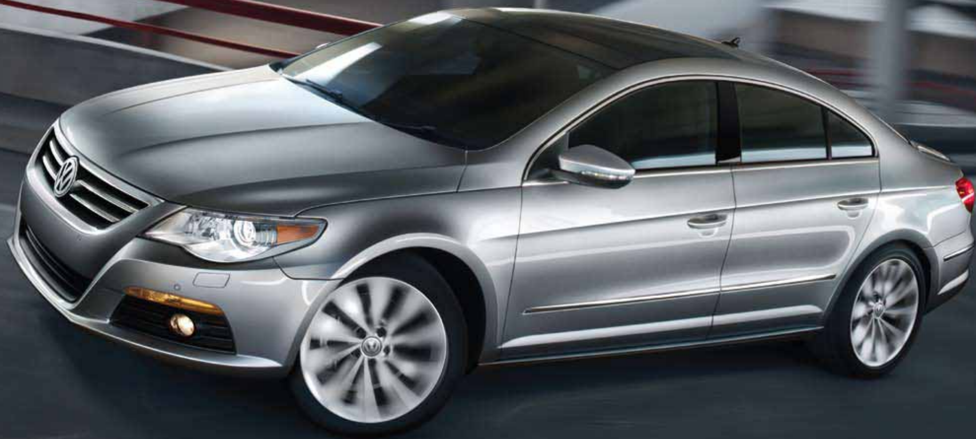
VR6 Sport, Reflex Silver Metallic, 18" Interlagos Wheels