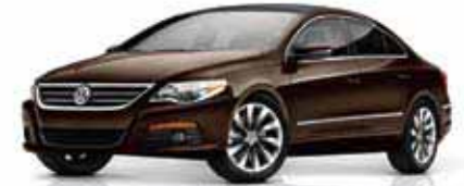
Mocha Brown Metallic