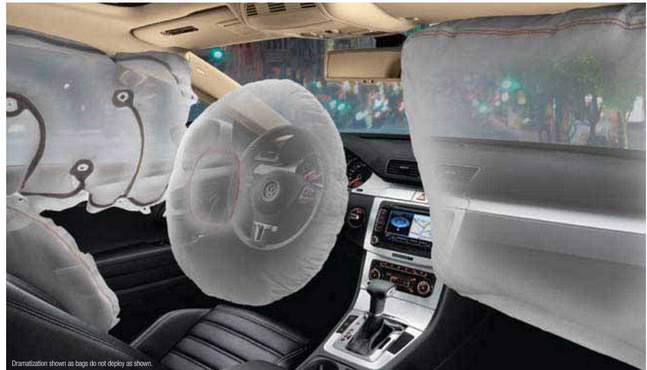
Dramatization shown as bags do not deploy as shown.

The all-new CC came to life when designers and engineers worked synergistically and found the best of both worlds. In between these elegant lines and undeniable German engineering lies a backbone of pure safety. Volkswagen's Prevent and Preserve Safety System uses a network of 45 safety features to help avoid accidents in the first place and keep you safer, should one occur. Visit vw.com/safehappens to learn more.