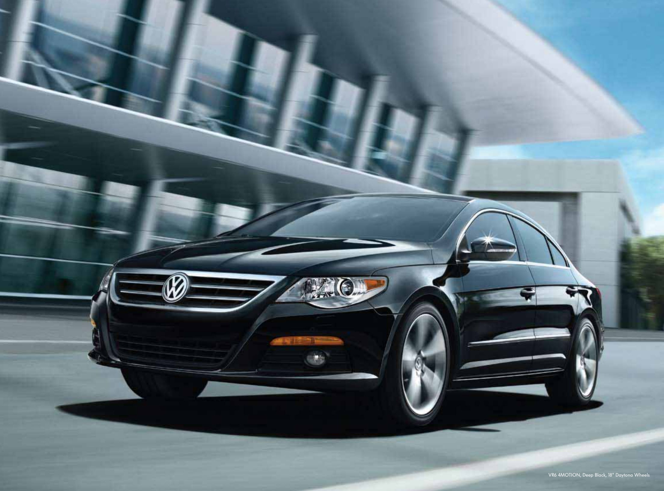
VR6 4MOTION, Deep Black, 18" Daytona Wheels