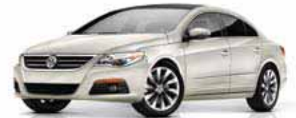
White Gold Metallic