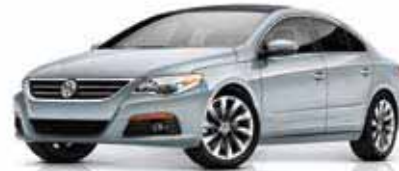
Iron Gray Metallic