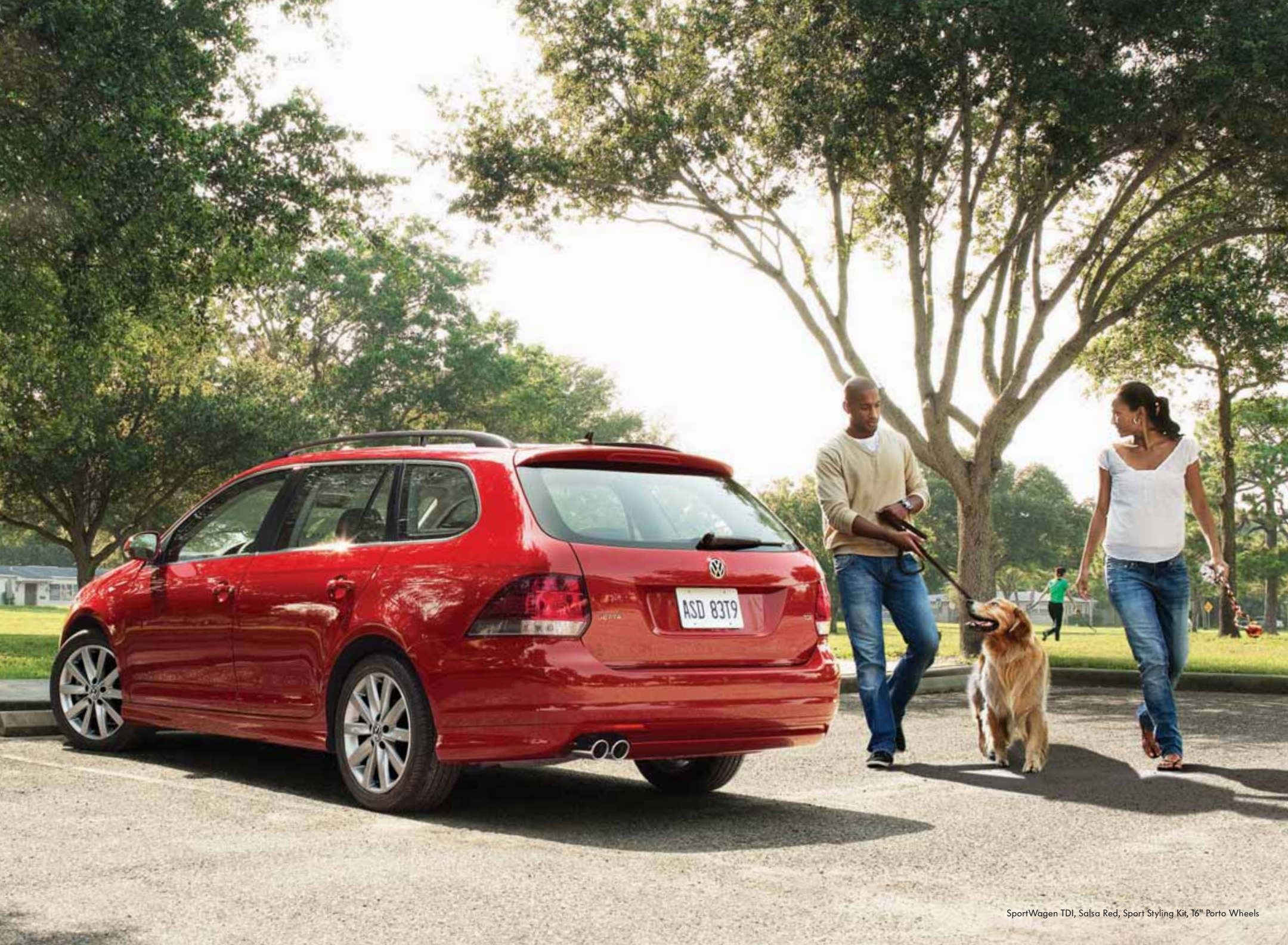
SportWagen TDI, Salsa Red, Sport Styling Kit, 16" Porto Wheels