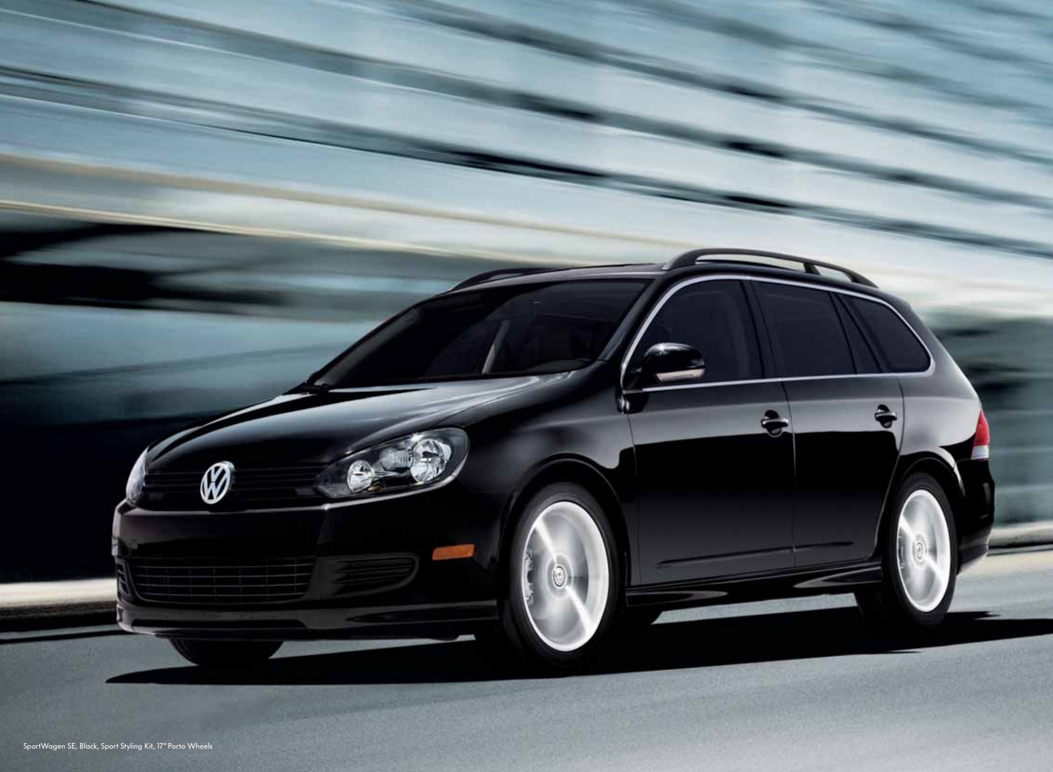
SportWagen SE, Black, Sport Styling Kit, 17" Porto Wheels