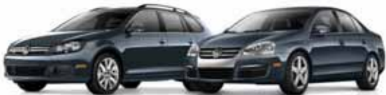
Blue Graphite Metallic