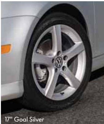
17" Goal Silver

VW gear for VW gearheads: drivergear.vw.com