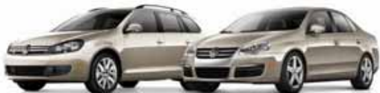
White Gold Metallic