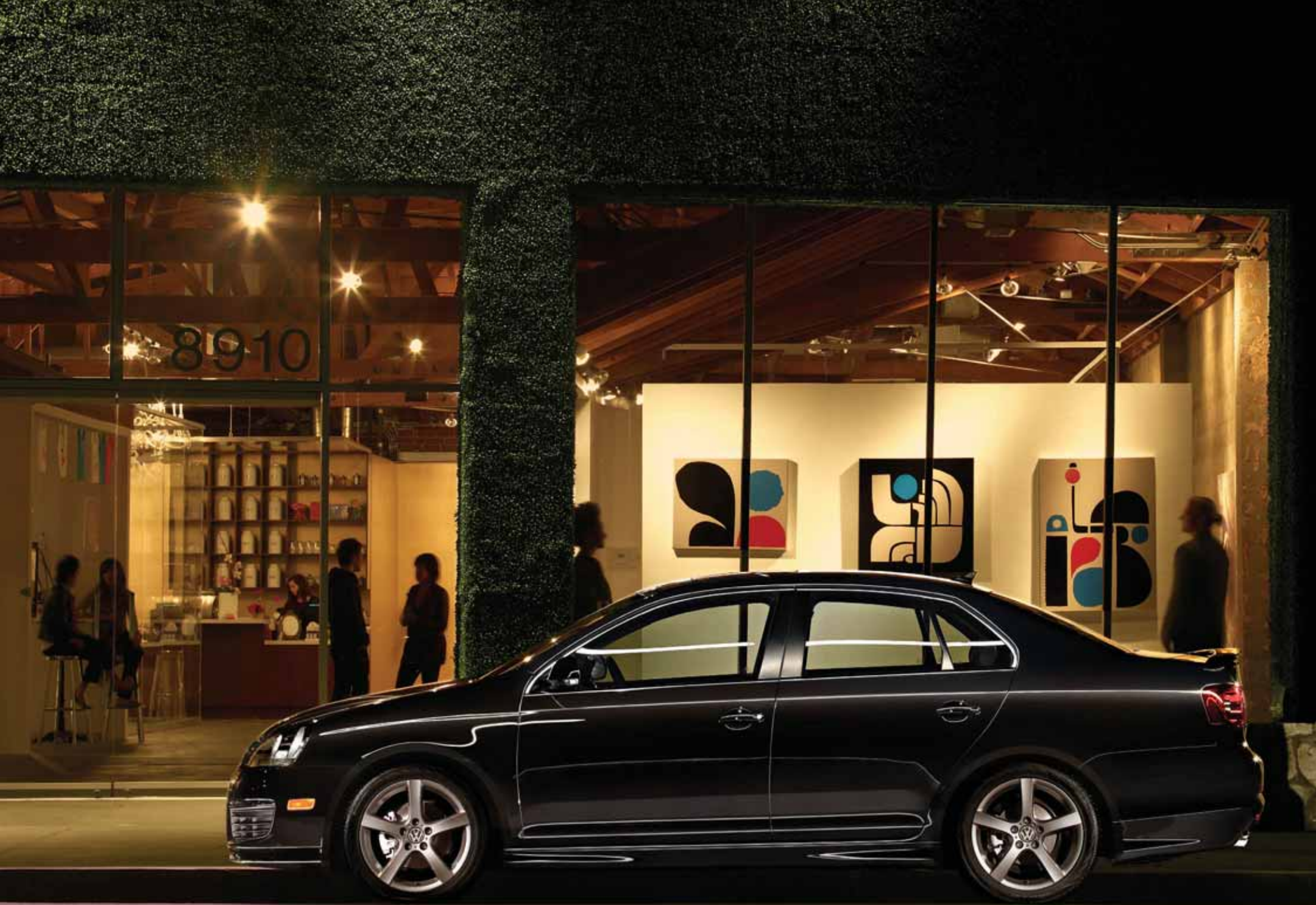
SEL, Black, Sport Styling Kit, Wing Spoiler, 17" Goal Anthracite Wheels