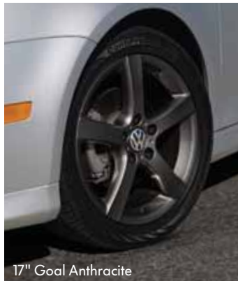
17" Goal Anthracite