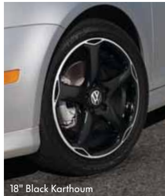
18" Black Karthoum