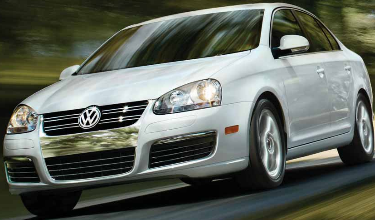
TDI, Candy White, 16" Bionline Wheels