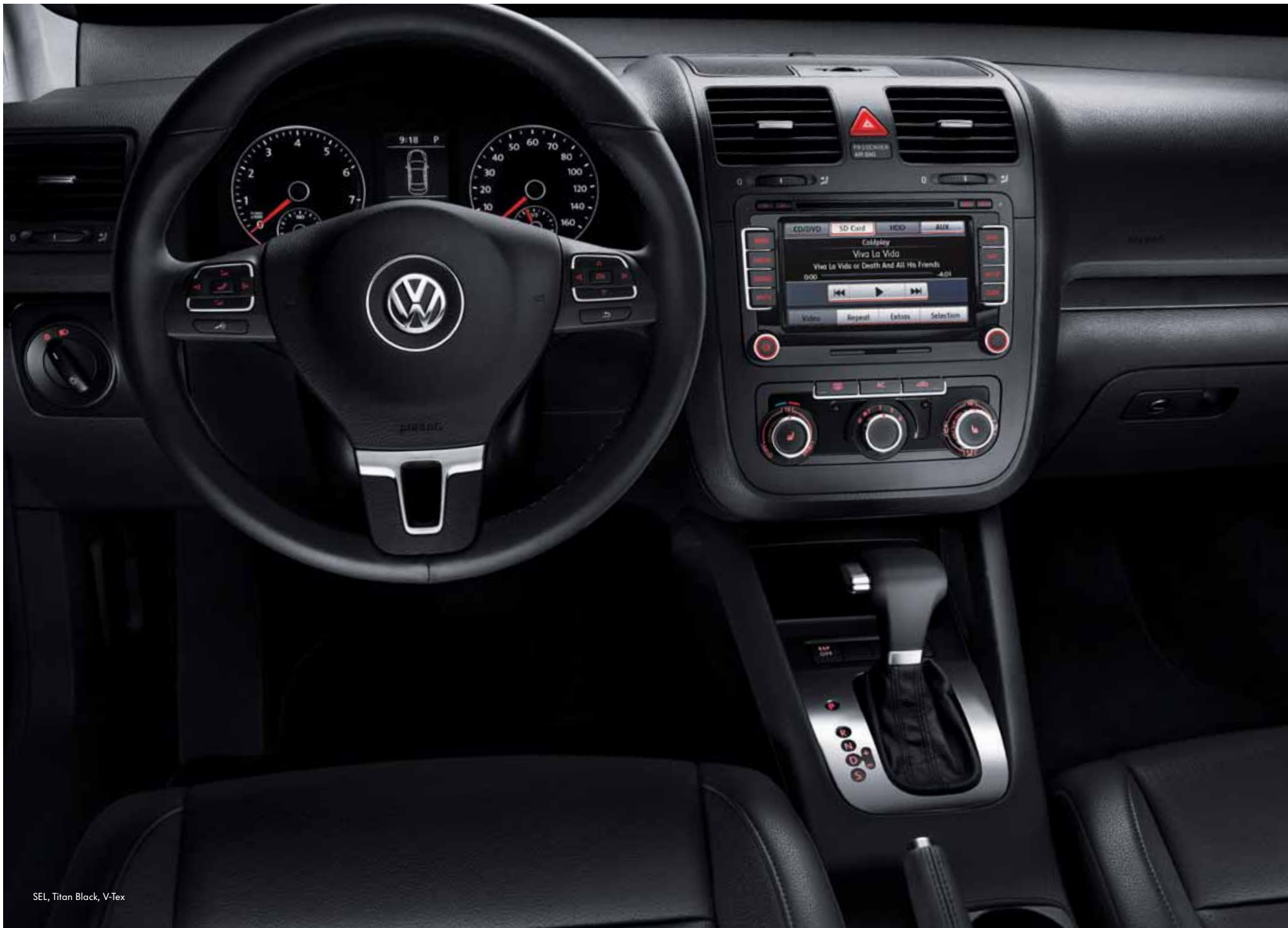
SEL, Titan Black, V-Tex