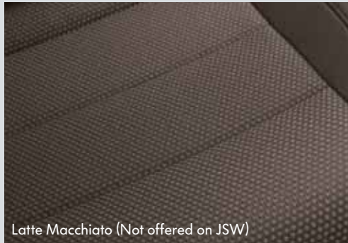
Latte Macchiato (Not offered on JSW)