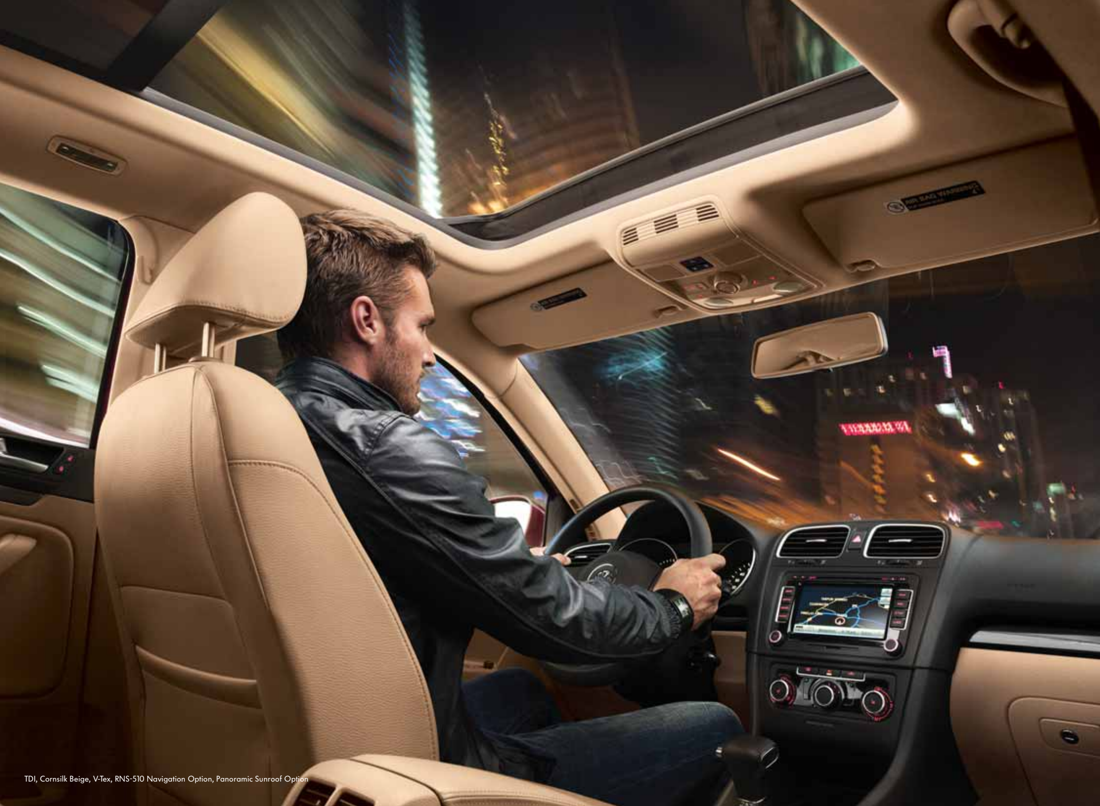
TDI, Cornsilk Beige, V-TEX, RNS-510 Navigation Option, Panoramic Sunroof Option