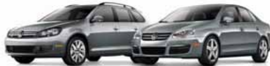
Platinum Gray Metallic