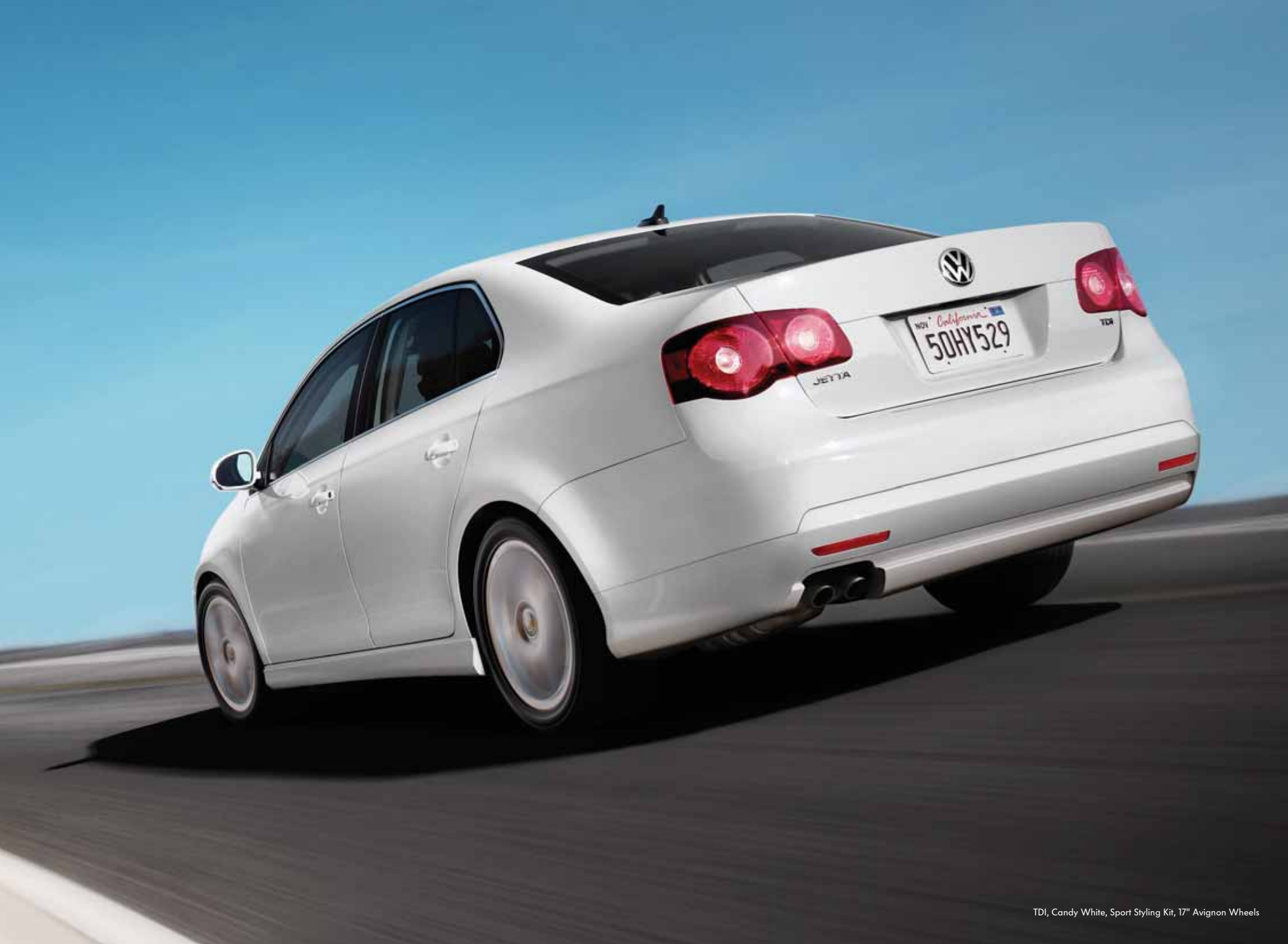
TDI, Candy White, Sport Styling Kit, 17" Avignon Wheels