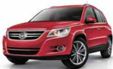
Wild Cherry Metallic