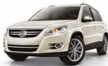
White Gold Metallic