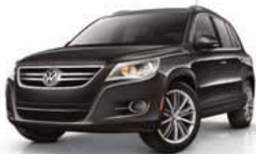
Deep Black Metallic