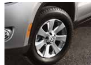
S Wheel-16" San Diego