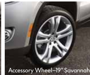
Accessory Wheel-19" Savannah