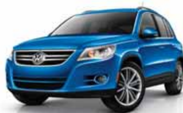
Sapphire Blue Metallic