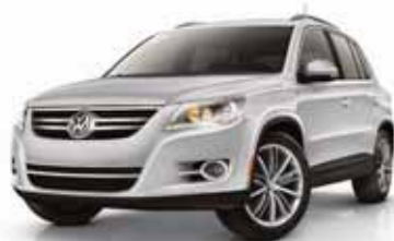
Reflex Silver Metallic