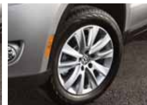
SE Wheel-17" Los Angeles