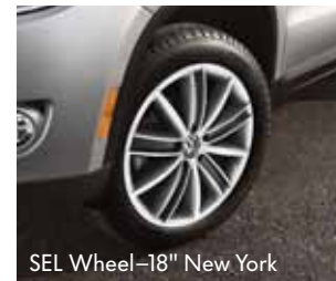
SEL Wheel-18" New York