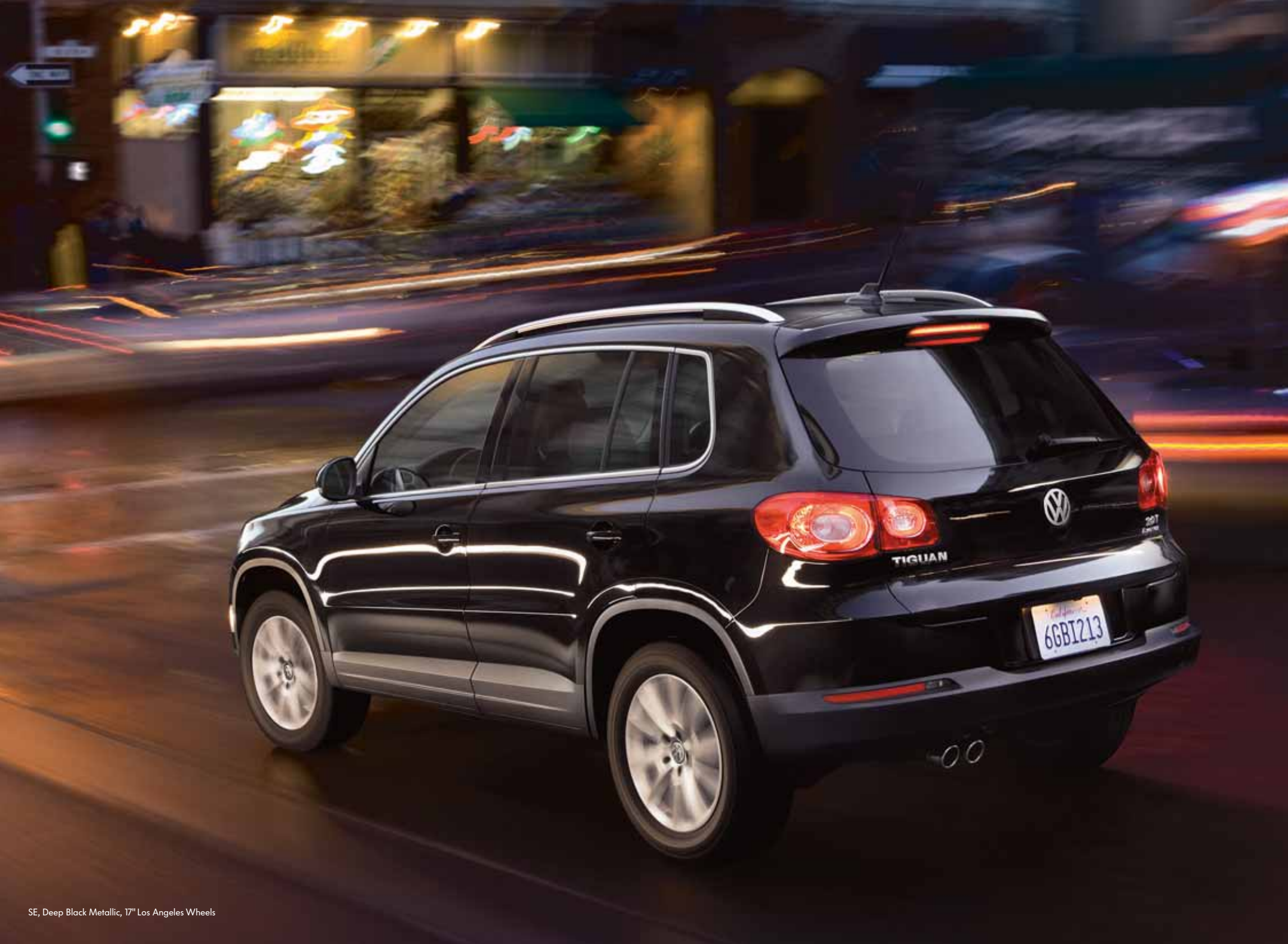
SE, Deep Black Metallic, 17" Los Angeles Wheels