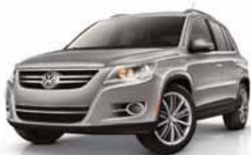
Alpine Gray Metallic