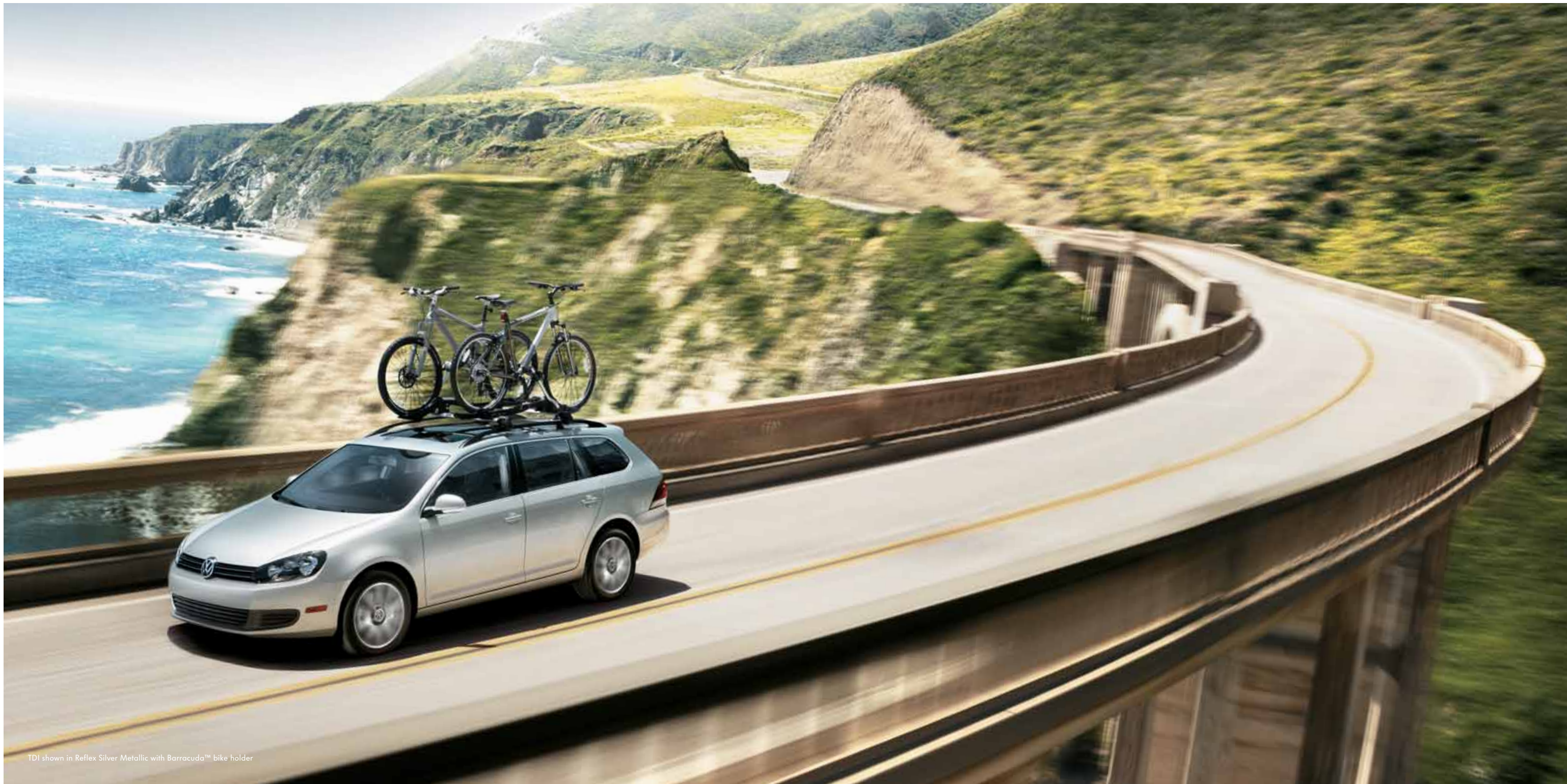
TDI shown in Reflex Silver Metallic with Barracuda™ bike holder