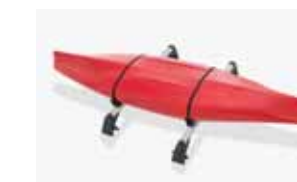
Base Carrier Bars with Kayak Holder