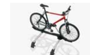
Base Carrier Bars with Barracuda™ Bike Holder