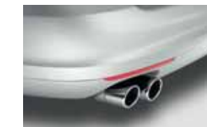
Chrome Exhaust Tips