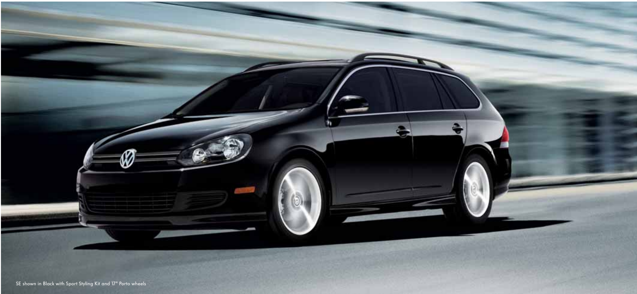
SE shown in Black with Sport Styling Kit and 17" Porto wheels