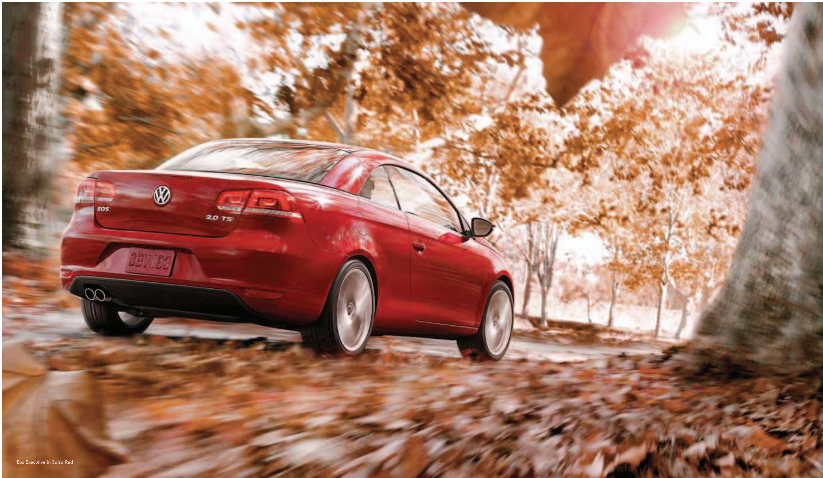
Eos Executive in Salsa Red