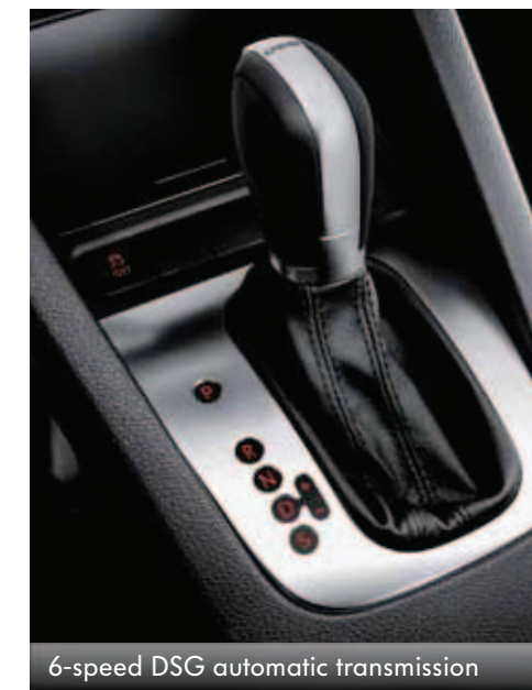
6-speed DSG automatic transmission