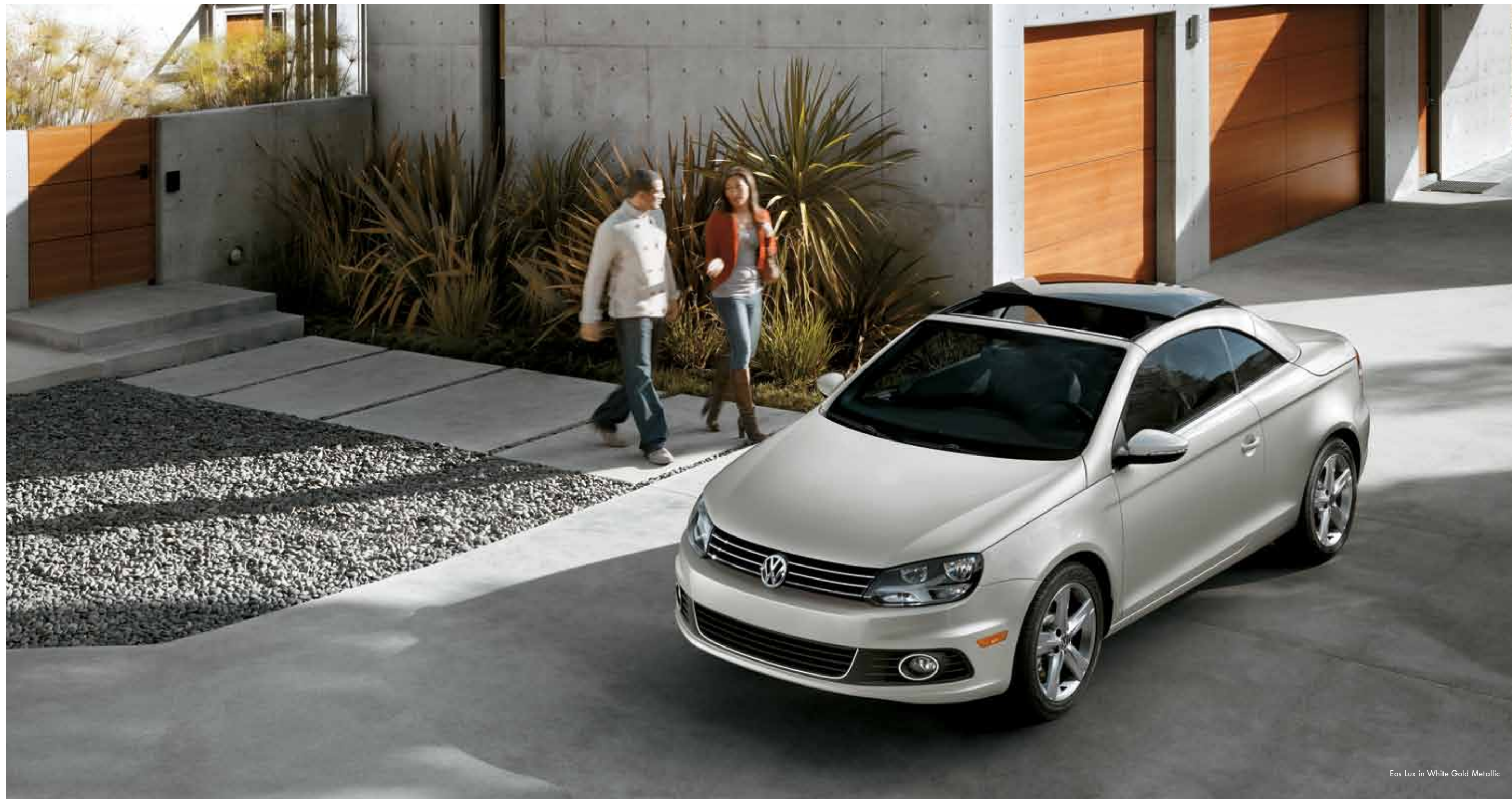
Eos Lux in White Gold Metallic

Now that you've experienced the new Eos from a full 360 degrees, you can see how we've made its gorgeous design even more beautiful. From its sleek, redesigned front lines to its sporty new back end, the new Eos is built to be fast and fun to drive. Plus, it has all kinds of little perks that make it feel oh so premium. Like heated washer nozzles to help prevent any kind of cold weather from clouding up your line of sight. And available Bi-Xenon™ headlights with an elegant set of LED daytime running lights that add a bold new detail to the completely redesigned front end. And rear lights that use fiber optic and LED technology to illuminate instantly, draw less energy, and last significantly longer than traditional bulbs. We even added brand-new foglights with a cornering feature to help illuminate your way when you put on your blinker or turn the wheel. We gave the new Eos all that because we know you'd like to be out on the open road enjoying the scenery for as long as you possibly can. And if you encounter any weather along the way, you'll want all these features to help guide you through.