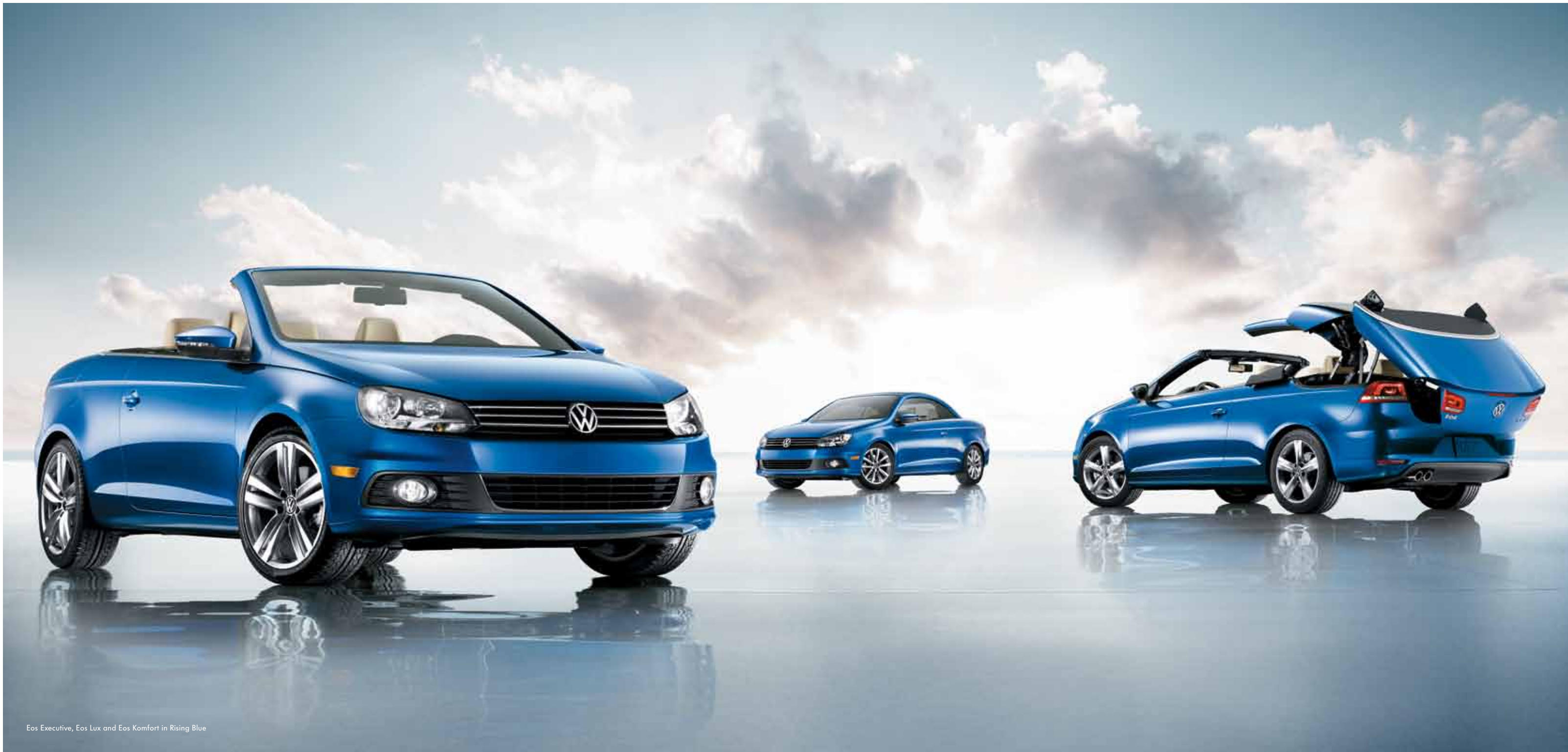
Eos Executive, Eos Lux and Eos Komfort in Rising Blue