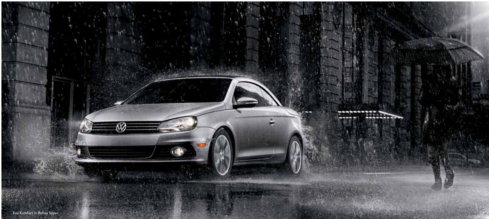
Eos Komfort in Reflex Silver