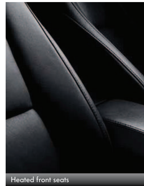
Heated front seats