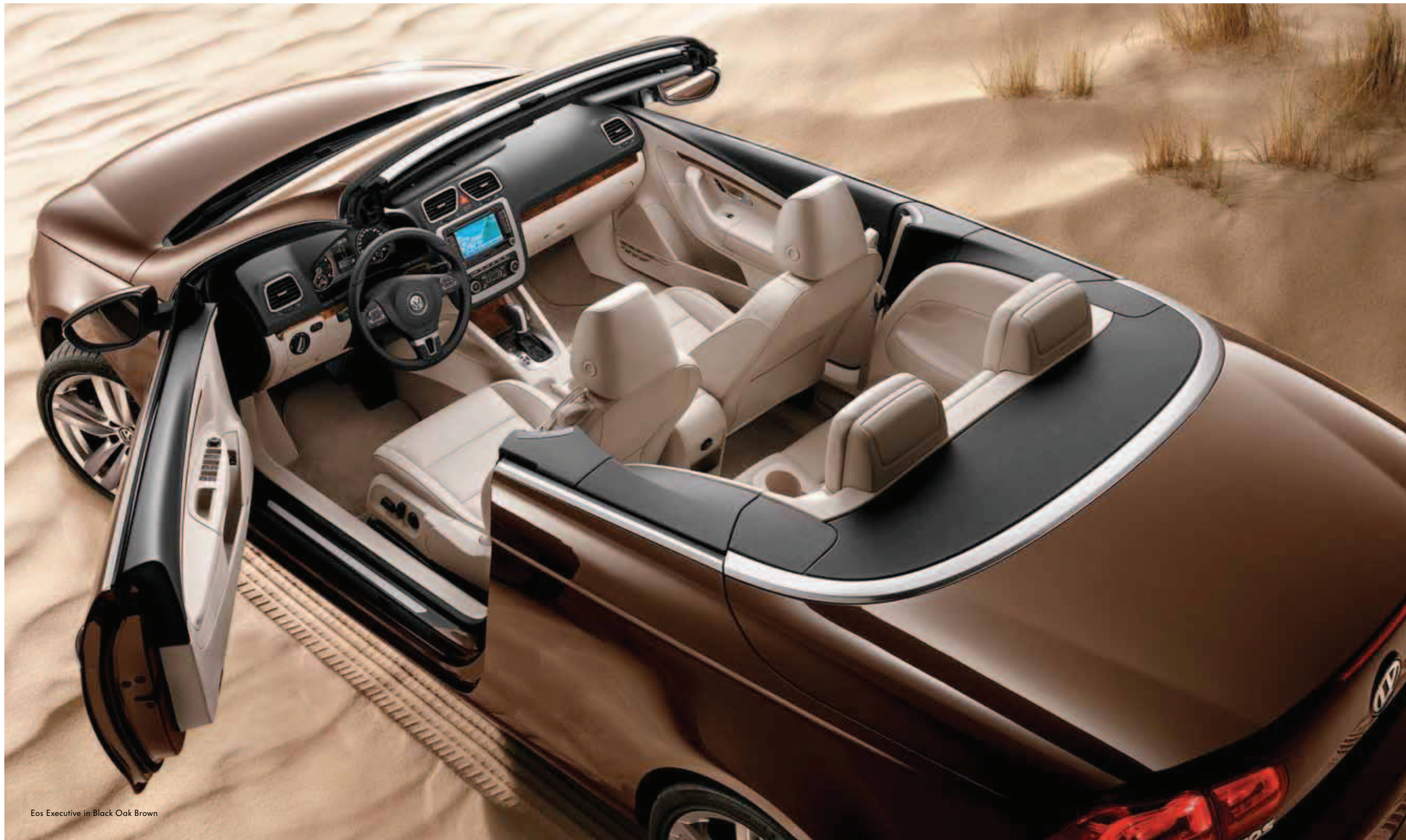
Eos Executive in Black Oak Brown