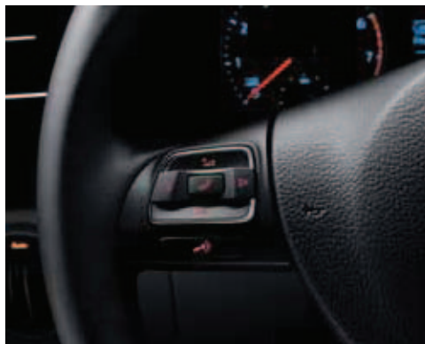
Bluetooth with voice command