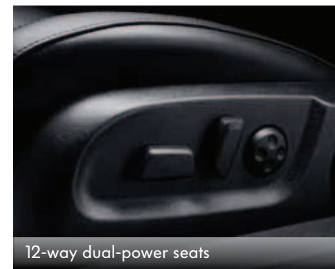
12-way dual-power seats