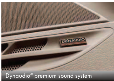
Dynaudio® premium sound system