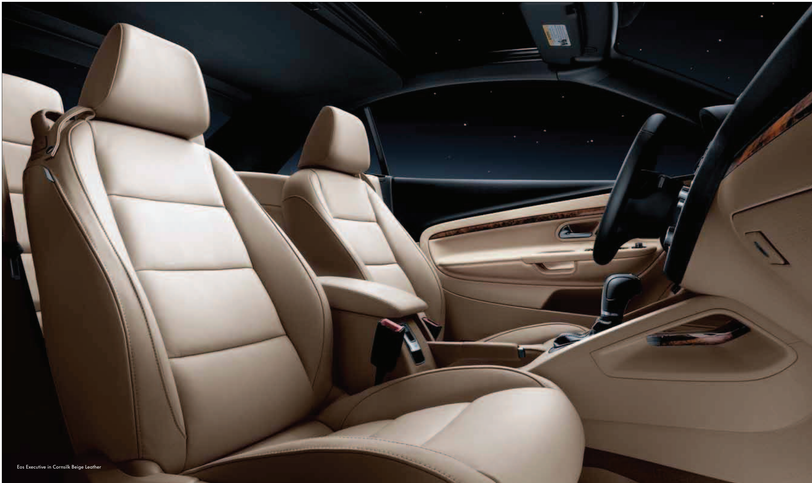
Eos Executive in Cornsilk Beige Leather