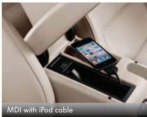
MDI with iPod cable