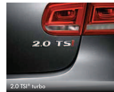
2.0 TSI ® turbo