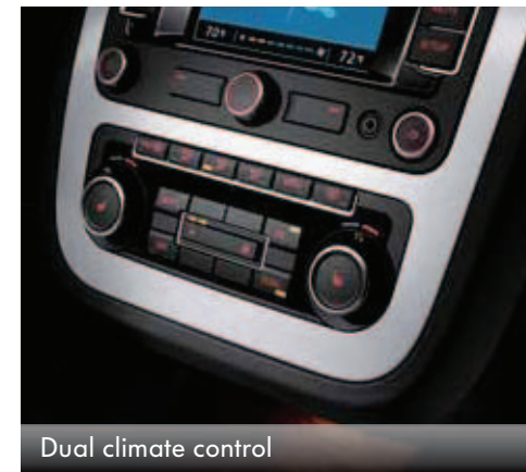
Dual climate control