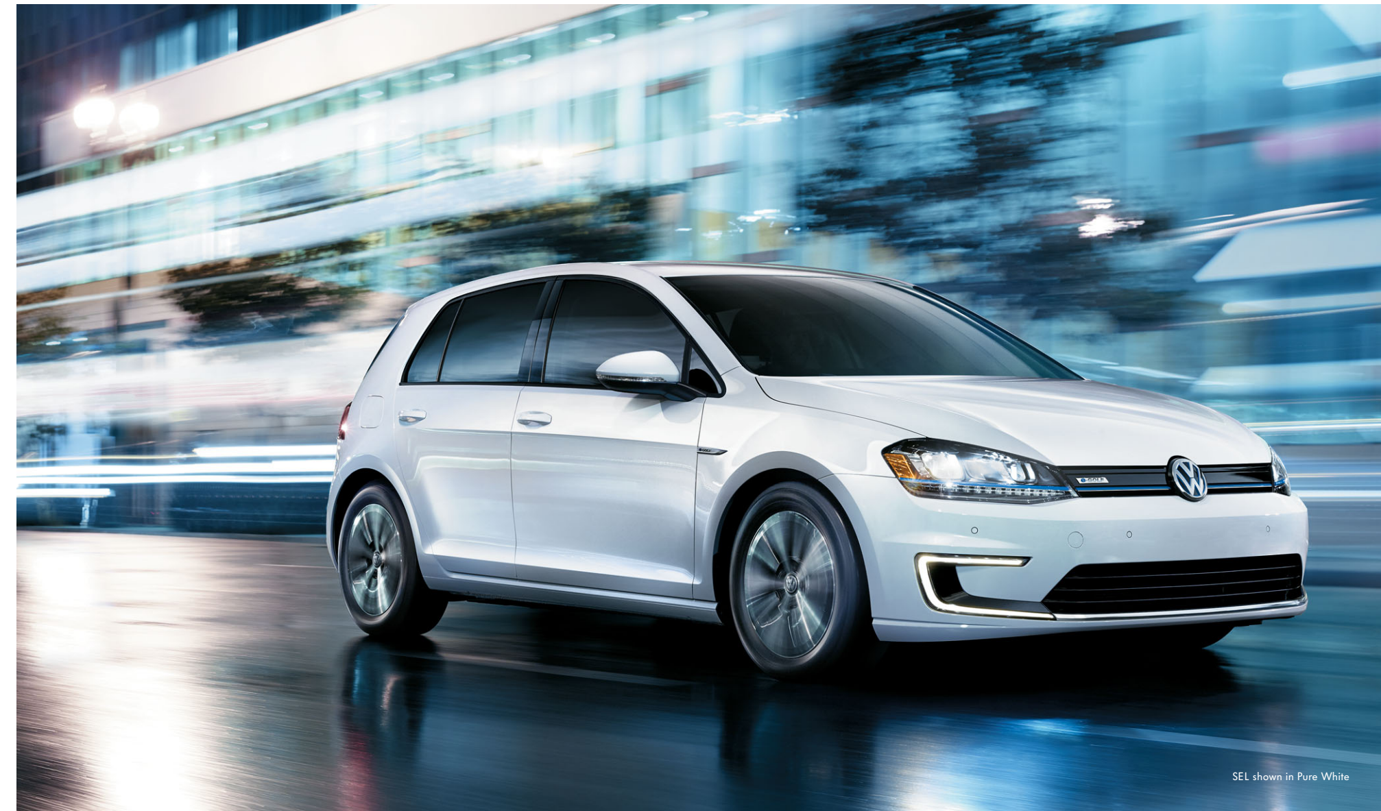
SEL shown in Pure White

*Based on manufacturers' published data. Nissan Leaf is a registered trademark owned by or licensed to Nissan Motor Co. Ltd. and/or its North American subsidiaries. **2015 e-Golf EPA estimates: 126 city/105 highway MPGe. Based on EPA formula of 33.7 kW/hour equal to one gallon of gasoline energy, EPA rated the e-Golf equivalent to 126 MPG measured as gasoline fuel efficiency in city driving and 105 MPG in highway driving. Actual mileage will vary and depends on several factors, including driving and charging habits, weather and temperature, battery age, and vehicle condition. Battery capacity decreases with time and use. See owner's manual for details. 2015 e-Golf EPA-estimated range is 83 miles. Actual mileage and range will vary and depends on several factors, including driving and charging habits, weather and temperature, battery age, and vehicle condition. Battery capacity decreases with time and use. See owner's manual for details. †Requires charging at select DC fast charging stations. Frequent and consecutive high-voltage charging (including DC charging) can permanently decrease the capacity of the high-voltage battery. See owner's manual for details.