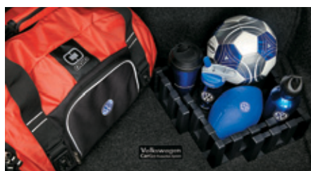
Heavy Duty Trunk Liner and CarGo Blocks