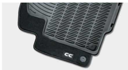
MojoMats® and Monster Mats®