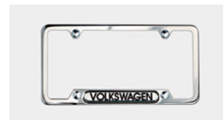
License Plate Frames