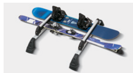
Base Carrier Bars and Snowboard/Wakeboard/Ski Holder Attachment