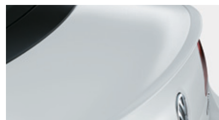
Rear Lip Spoiler