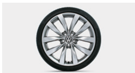
19" Sagitta Wheel