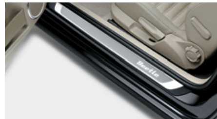
Door Sill Protection Plate