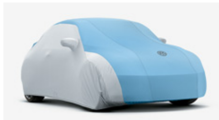
Stormproof™ Custom Car Covers**