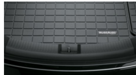
MuddyBuddy™ Trunk Liner**