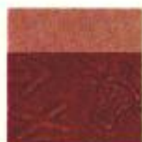
Beige Western Pattern Vinyl