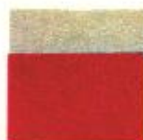
Red and White All Vinyl*