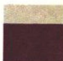
Black and White All Vinyl*