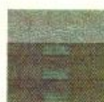
Green Multi-block Pattern Fabric*