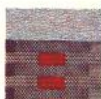
Gray Multi-block Pattern Fabric*