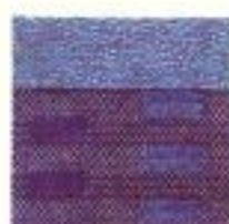
Blue Multi-block Pattern Fabric*