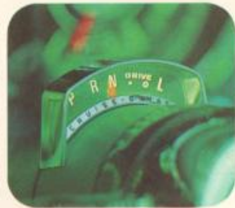
Lighted Cruise-O-Matic quadrant