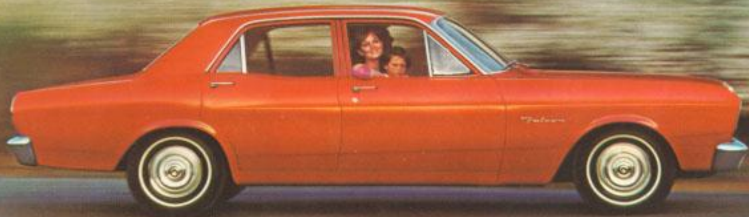
Falcon 4-Door Sedan has plenty of leg, shoulder and head room