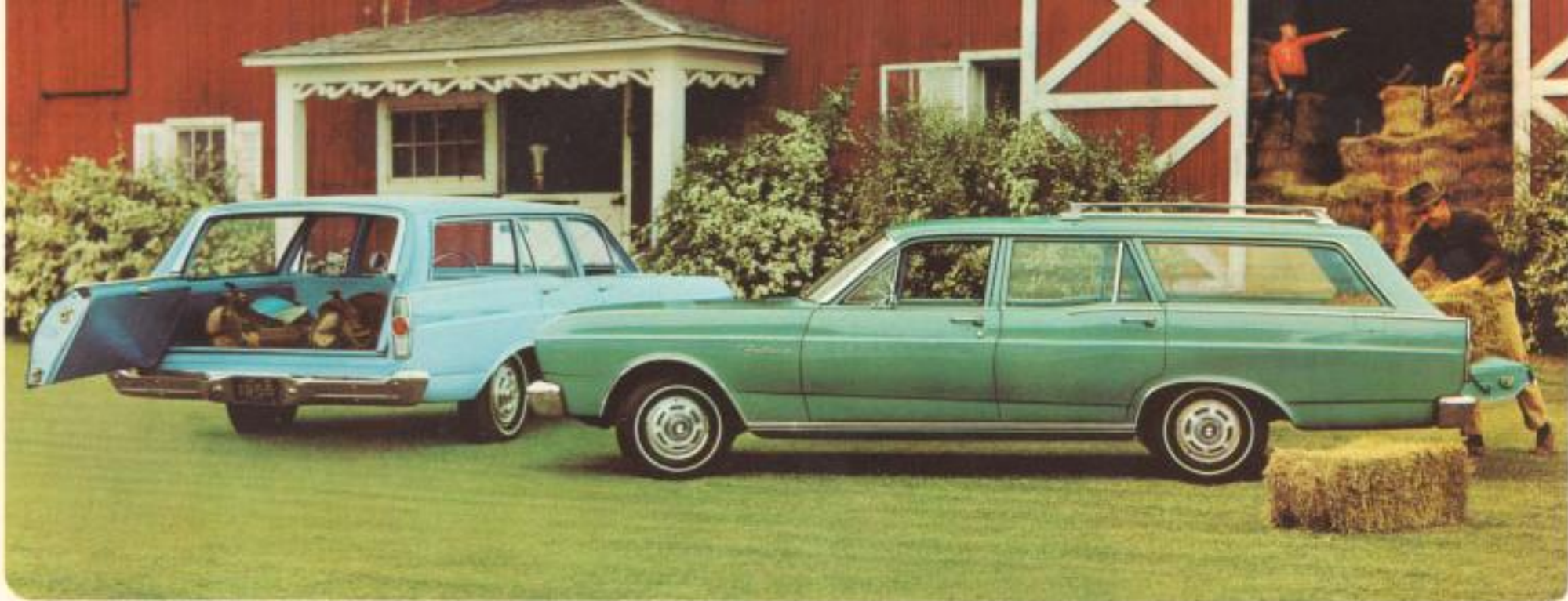
FALCON WAGON (LEFT) AND NEW FUTURA WAGON SHOW FORD'S NEWEST AND MOST EXCITING WAGON FEATURE—THE MAGIC DOORGATE.* IT'S BOTH A DOOR AND TAILGATE.