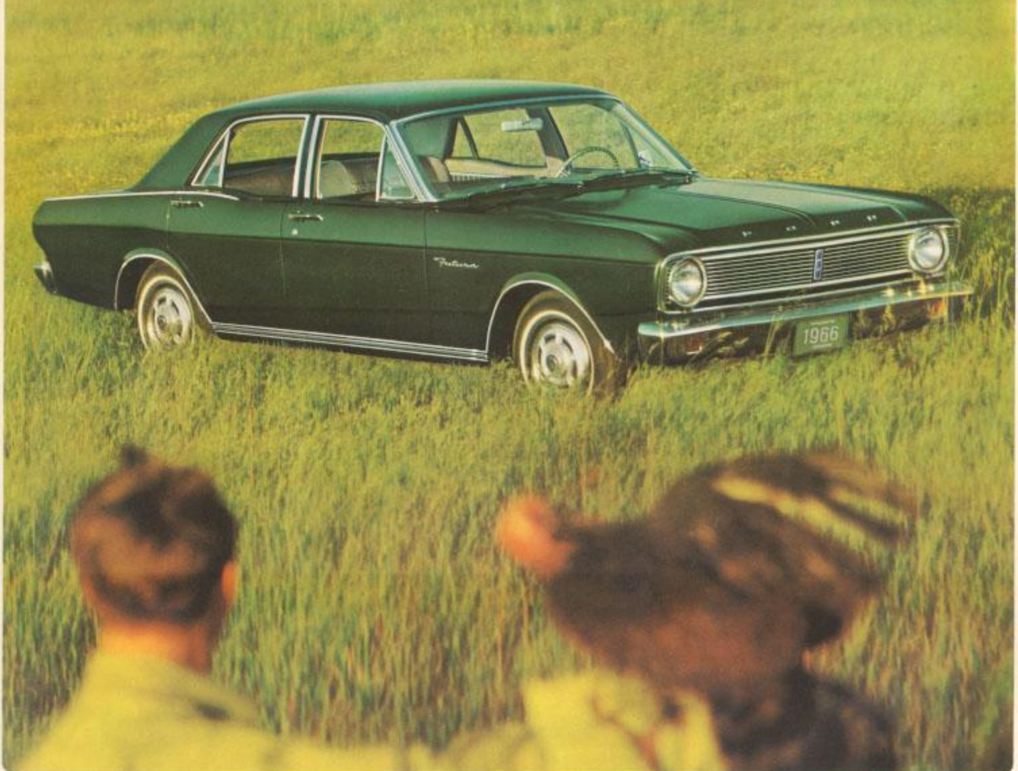
Cover: NEW FUTURA SPORTS COUPE