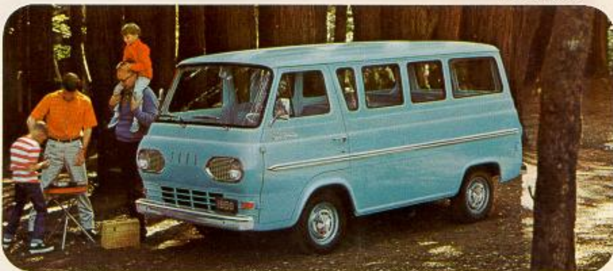
DELUXE CLUB WAGON