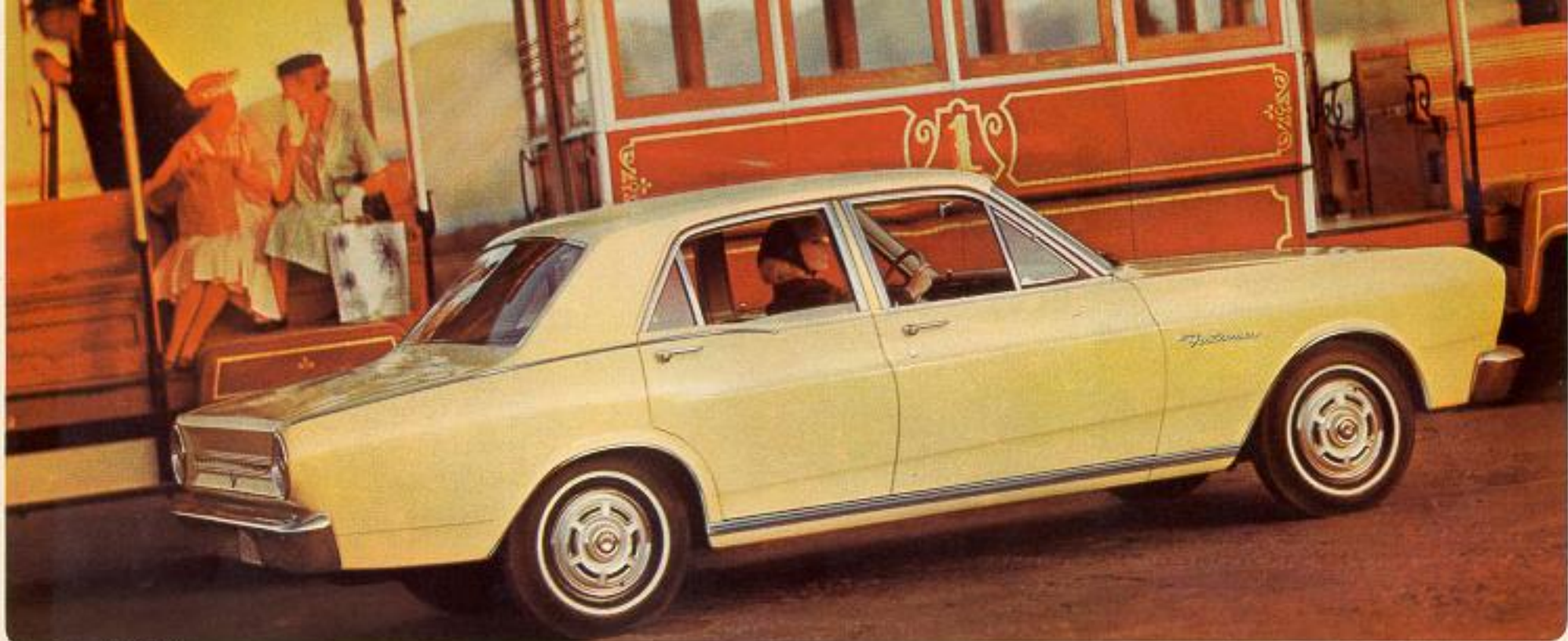
Futura 4-Door Sedan