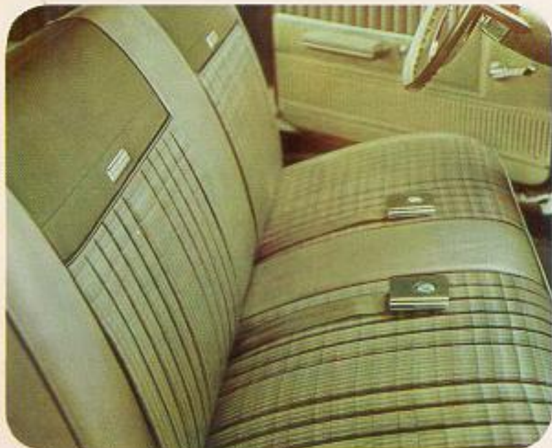
Futura interiors are luxurious, roomier than ever