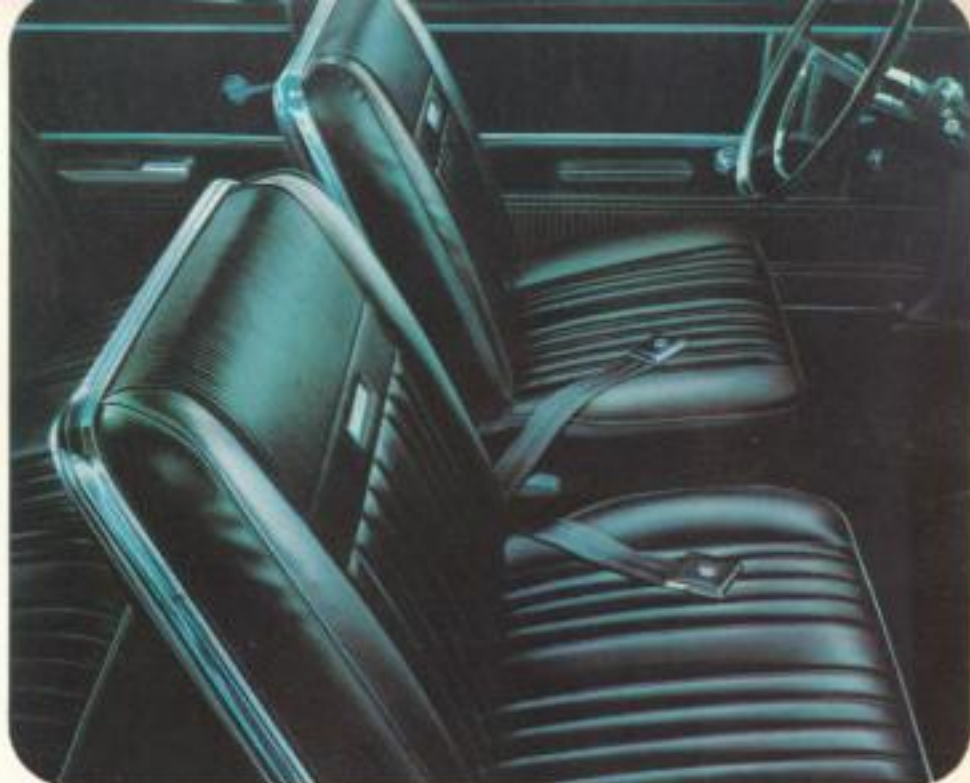
Bucket Seats and All-Vinyl Trim are standard features on the Sports Coupe

But the Sports Coupe's No. 1 feature is economy . . . traditional Falcon all the way. And Falcon's great gas mileage and service-saving features keep right on saving. Here's total performance at its money-saving best!