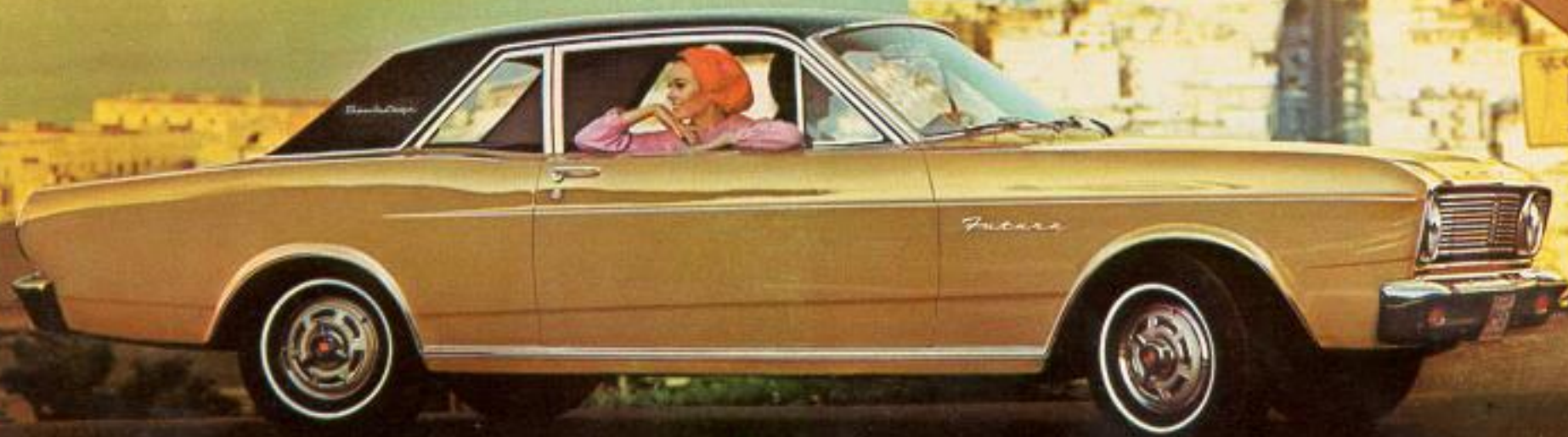
Futura Sports Coupe with bucket seats, knock-off wheel covers and accent stripe—all standard. Vinyl-Covered Roof optional!