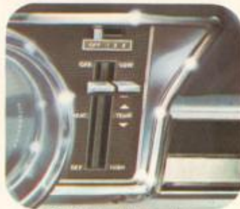
Fingertip heater-defroster controls