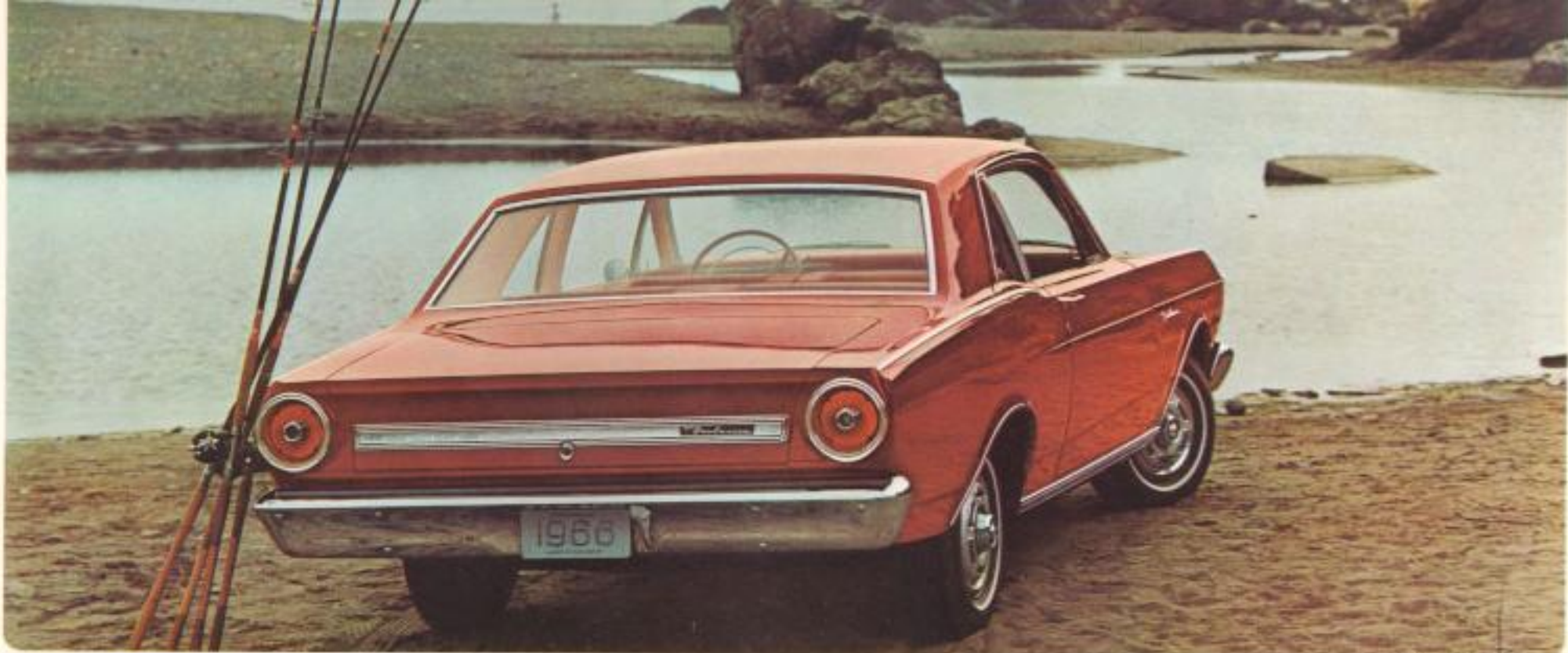
Future Club Coupe

wider treads and refined front suspension make this the finest riding Falcon ever. New underbody torque boxes "soak up" noise and vibration before they reach the passenger compartment.