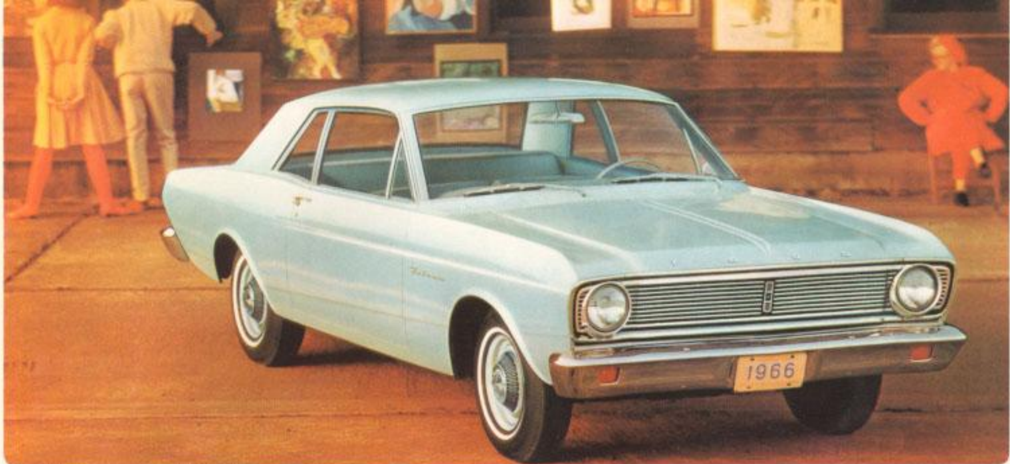
Falcon Club Coupe sports rugged good looks, low price tag