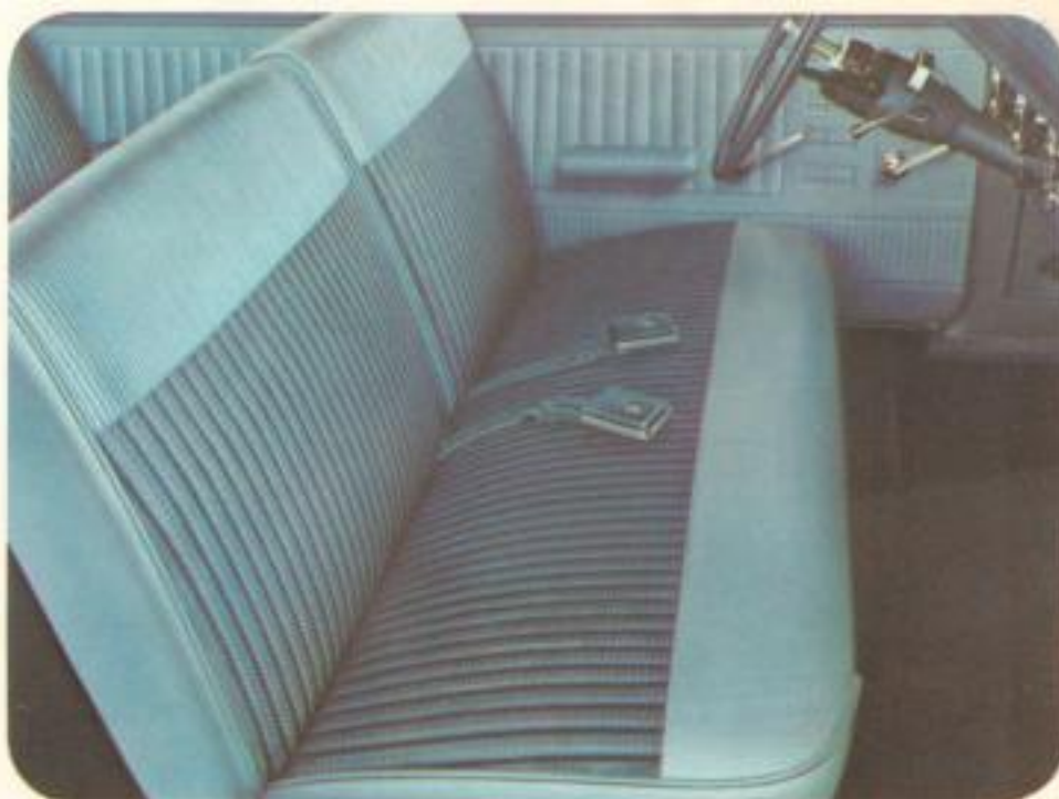
Colorful, comfortable Falcon interior with cloth and vinyl trim

No matter what you want in a compact . . . room, ride, economy, fun . . . don't compromise. Pick a '66 Falcon, the no-compromise compact . . . America's economy champ!