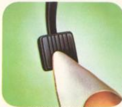
New foot-operated parking brake