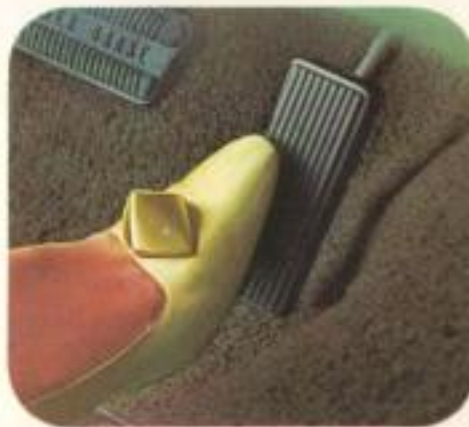
Suspended accelerator pedal