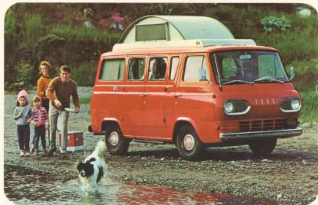
New Falcon Custom Club Wagon becomes a Camper with wide variety of Conversion Kits