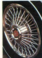
WIRE WHEEL COVERS