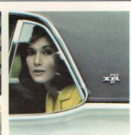
VINYL-COVERED OXFORD ROOF