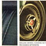
DELUXE WHEEL COVERS WITH RECESSED SPINNERS