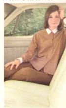
FULL-WIDTH FRONT SEAT—ROOM FOR THREE PASSENGERS