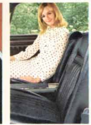
COMFORT-WEAVE VINYL BUCKET SEATS