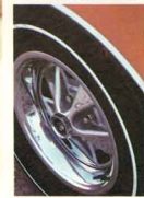
STYLED STEEL WHEELS