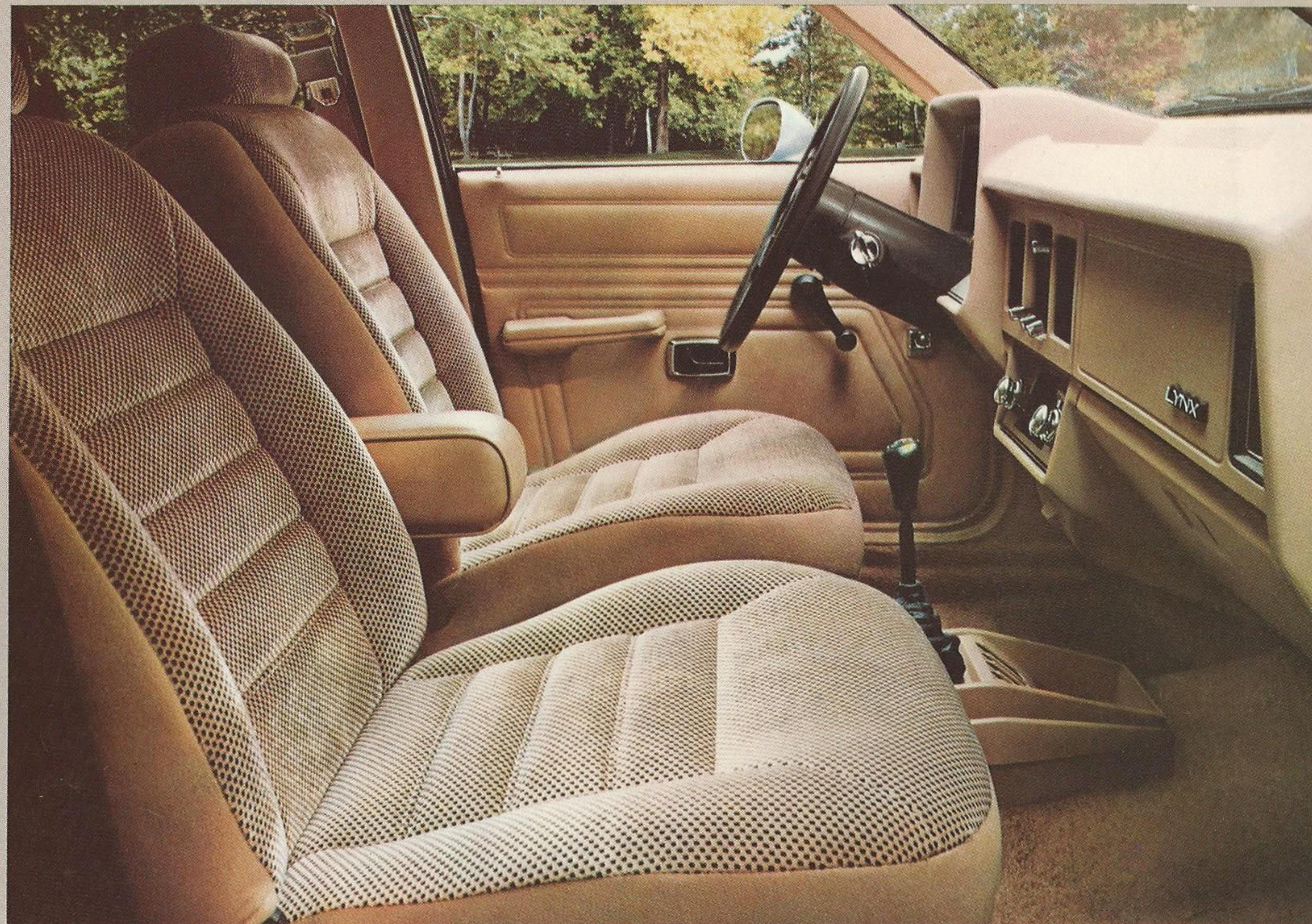
Above: Lynx Luxury Touring Sedan interior with cloth-covered reclining individual seats and vinyl-covered folding center armrest. Shown in Desert Tan.