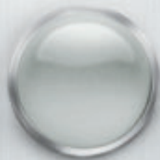
SPARKLING SILVER (LX, EX, SX)

YOU HAVE A PURE HEART AND GENTLE NATURE. YOU LOVE LONG NAPS.