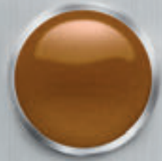
BURNISHED COPPER (LX, EX, SX)

Find out which COLOR is your perfect match