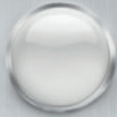
CLEAR WHITE (LX)

THOUGH YOU HAVE A SPARKLING PERSONALITY, YOUR SOUL REMAINS SALT-OF-THE-EARTH.