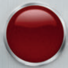
HYPER RED (LX, EX, SX)

YOU HAVE A WARM Demeanor AND ALWAYS APPEAR POLISHED WHEN THE SITUATION CALLS FOR IT.