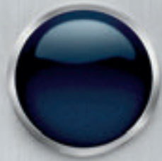
PACIFIC BLUE (LX, EX, SX)

YOUR SWEET NATURE IS SOMETIMES BELIED BY YOUR LOVE OF DARK COMEDIES.