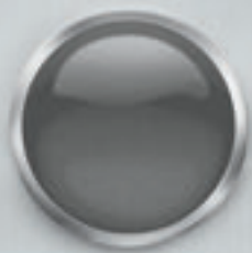
MINERAL SILVER (LX, EX, SX)

YOU CRAVE EXCITEMENT, AND YOUR POSITIVE ENERGY IS DOWNRIGHT CONTAGIOUS.