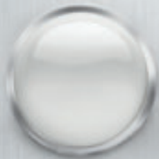
SNOW WHITE PEARL (EX, SX)

YOU HAVE A PURE HEART AND GENTLE NATURE. YOU LOVE LONG NAPS.