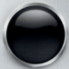
BLACK CHERRY (LX, EX, SX)

YOU NOTICE THE SUBTLE IRONIES IN LIFE. NOTHING IS EVER BLACK AND WHITE TO YOU.