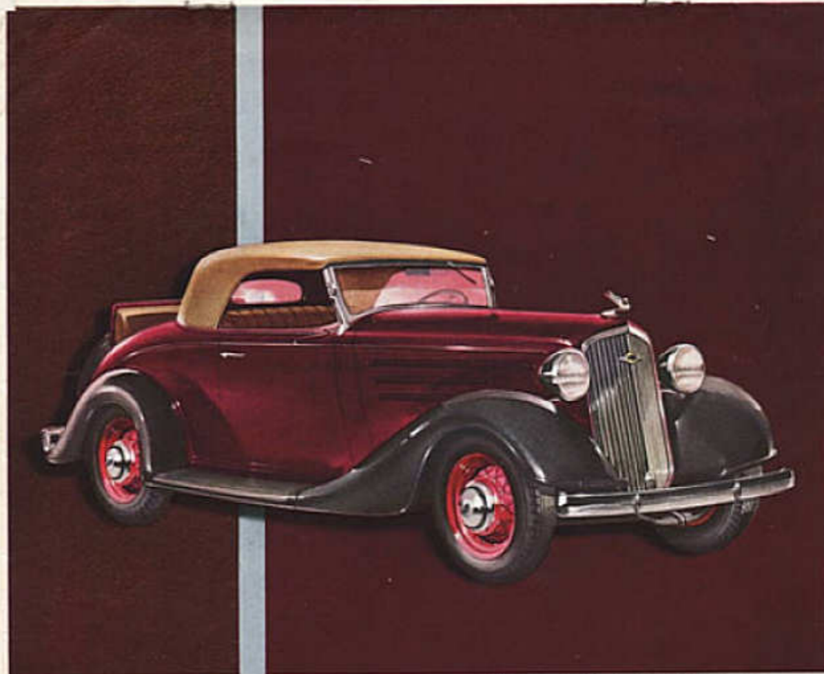
Standard equipment on the sport roadster includes five wire wheels.

The Chevrolet Improved Standard Six Sport Roadster is particularly designed for drivers who have never lost their admiration for a roadster's low, sweeping lines and the exhilarating speed of an open car. Its handsome front end, wide skirted fenders, long hood, snug-fitting top, streamline style, and its smartness when viewed from any angle have never been offered before in a roadster so low in first cost—or costing so little to operate for gas, oil and maintenance.