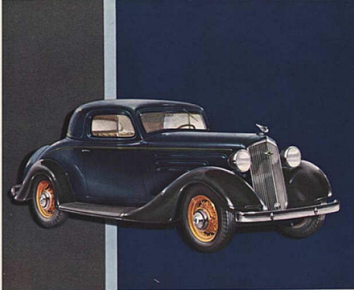
Standard equipment on the coupe includes five wire wheels.

Unexcelled for economy in business or pleasure use, yet the Improved Standard Six Coupe has many comforts and conveniences featured on cars of much higher price. Its unusually deep cushions, long-wearing mohair upholstery, Fisher Ventilation, reversed cowl ventilator for greatly improved summer comfort, overlapping doors to prevent drafts, are only a few of many such refinements that become more and more satisfying with every economical mile.