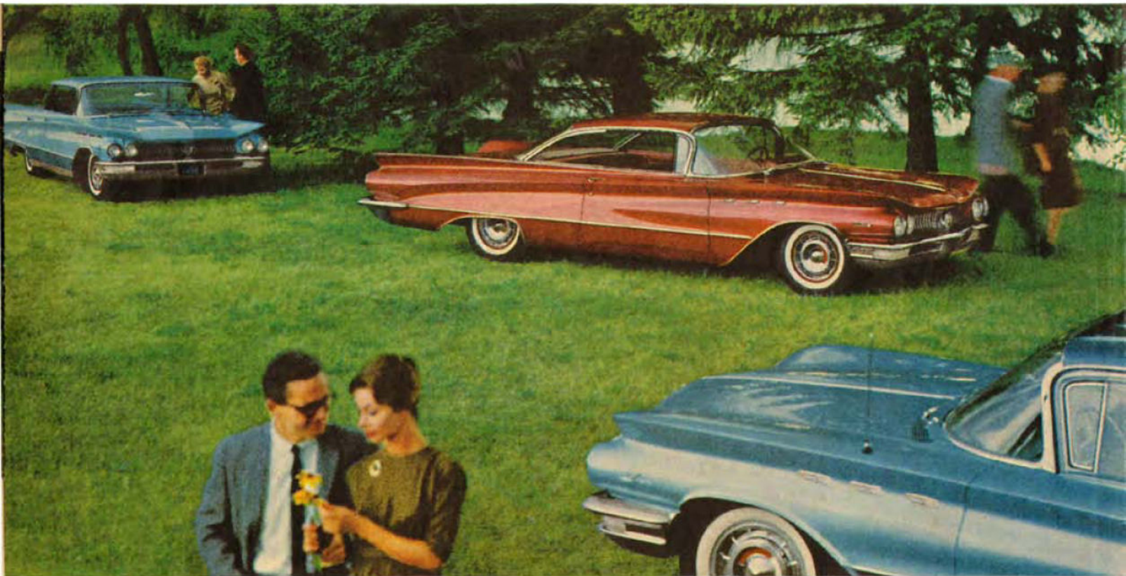
BUICK ELECTRA 225

Every one of Buick's 19 models is a car large enough, strong enough and able enough to serve today's American family well and long on today's American streets and highways. Your Quality Buick Dealer earnestly invites you to inspect and drive these wonderful cars—at your own convenience and with absolutely no obligation.