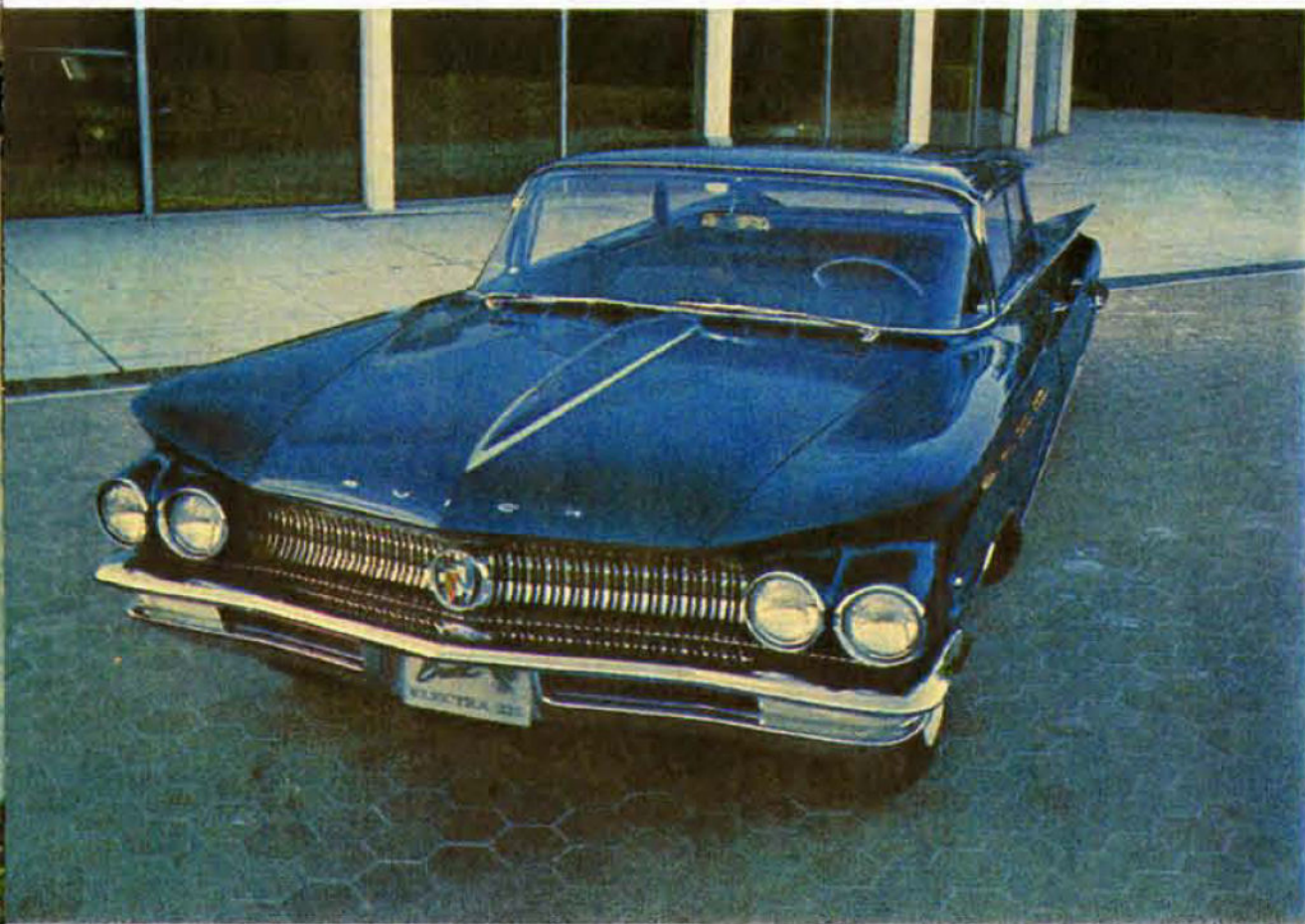
BUICK ELECTRA 225 4-DOOR HARDTOP

Careful comparisons indicate that today's Buick is perhaps the quietest-running car built in America. Nobody goes so far as Buick in use of noise-insulating materials, including rubber engine mounts, rubber pads between body and frame and between the coil springs and frame.