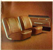
F-85 Cutlass Coupe (117); Convertible (167)

All-Moroccan, Fawn (above), Red; or nylon-rayon, Moroccan in Gray, Green, Blue. Carpet in 5 complementary shades.