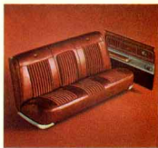
SUPER 88 Holiday Sedan (539); Coupe (547)

Smart nylon with leather, Moroccan accents. Rose (above), Black, Blue, Red, White, Saddle. Bucket seats, standard.