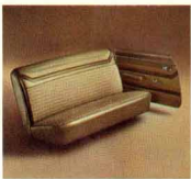
F-85 Club Coupe (027); 4-Door Sedan (019)

Seville-grain Moroccan. Saddle (above), Black, Blue, Red, White. Chrome-trimmed, deep bucket seats as standard equipment.