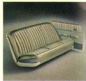
NINETY-EIGHT Town Sedan (819)

Tailored nylon-faced cloth and Moroccan. Aqua (above), Gray, Green, Blue, Fawn. Front, rear seat center armrests.