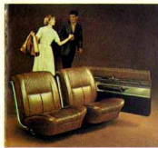
STARFIRE Coupe (657); Convertible (667)

Seville-grain piped Moroccan. Blue (shown), Gray, Green, Red, Saddle. New carpet colors, keyed to interior trims.