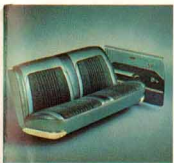
SUPER 88 Celebrity Sedan (569)

Nylon cloth and Barcelona-grain Moroccan. Red, (above), Gray, Green, Blue, Fawn. Fold-down rear armrest in sedan.