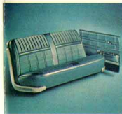
NINETY-EIGHT Holiday Sports Sedan (839); Coupe (847)

Nylon-faced fabric and Moroccan. Gray (above), Green, Blue, Fawn, Aqua. Carpet, headlining in complementary hues.