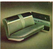
DYNAMIC 88 Celebrity Sedan (269)

Piped rayon-nylon, banded pattern, Moroccan. Red (above), Gray, Blue, Fawn; or All-Moroccan, Green, Blue, Fawn, Red.