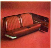
DYNAMIC 88 Holiday Coupe (247); Sedan (239)

All-Moroccan. White (above), Red, Saddle; or rayon-nylon cloth with metallic yarns, Moroccan in Green, Blue, Red.