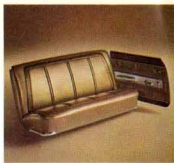
F-85 DE LUXE Station Wagon (135)

Smart nylon-rayon with metallic yarn, trimmed with Moroccan. Green (above), Blue, Fawn. Piped cloth on door panels.