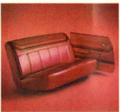
F-85 Station Wagon (035)

Nylon-rayon, Moroccan, Fawn (above), Gray; or All-Moroccan in Blue, Green, Red, in sedan; Blue, Red in Club Coupe.