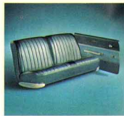
DYNAMIC 88 Convertible Coupe (267)

Seville-grain piped Moroccan. Saddle (above), Gray, Green, Red, Blue. Electric rear window standard on 3-seat model.