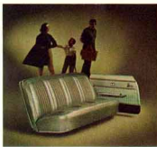
F-85 DE LUXE 4-Door Sedan (119) (Custom Trim)

Durable nylon-rayon with metallic yarns, and Moroccan. Blue (above), Gray, Green, Fawn; or All-Moroccan, Red.