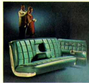
NINETY-EIGHT Luxury Sedan (829)

Each of the elegant new Oldsmobiles has its own kind of eye-appeal! Each extends an irresistible, personal invitation to you to customize your Oldsmobile . . . ride in regal style!