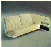
NINETY-EIGHT Convertible Coupe (867)

Patterned nylon-rayon, trimmed with Moroccan. Blue (above), Gray, Green, Fawn, Red. New ease of entry and exit.