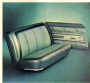
F-85 DE LUXE Sedan (119)

Barcelona-grain leather and Moroccan. Saddle (above), Black, Blue, Red, White, Rose. Deep, foam-padded bucket seats.