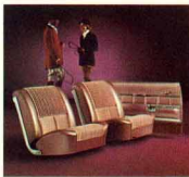
NINETY-EIGHT Custom Sports Coupe (947)

Barcelona-grain Moroccan and leather. White (above), Blue, Red, Saddle. Electric seat and window controls in armrest.