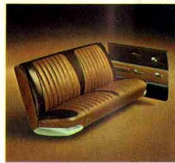
DYNAMIC 88 Fiesta 2-Seat (235); 3-Seat (245)

Piped rayon-nylon cloth with banded pattern, Moroccan. Green (above), Gray, Blue, Fawn, Red; or All-Moroccan, Gray.