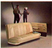
SUPER 88 Fiesta (Station Wagon) (535)

Rayon-nylon with bright metallic yarns, Moroccan. Blue (above), Gray, Green, Fawn, Red. Carpet color-keyed to interior.