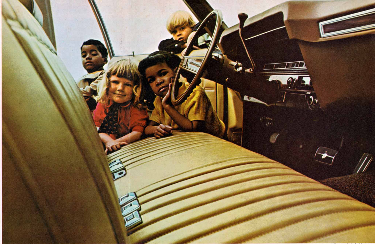
Kingswood Estate and Kingswood all-vinyl interior