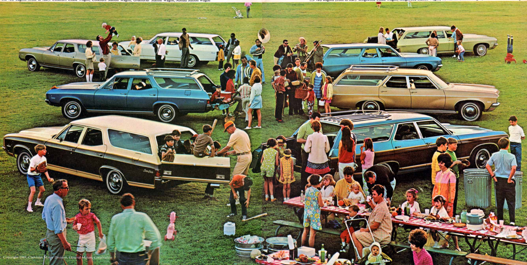
119"-wb wagons (front to rear): Kingswood Estate Wagon, Kingswood Station Wagon, Townsman Station Wagon, Brookwood Station Wagon