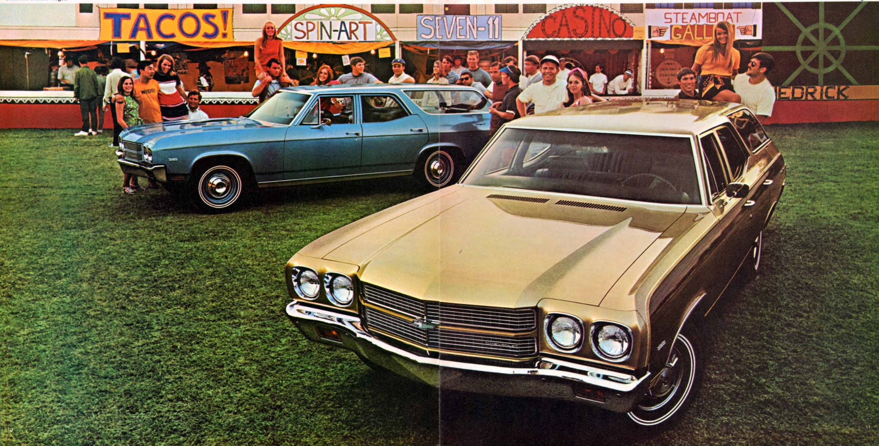
Concours Estate Wagon