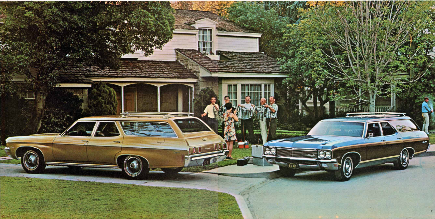
Kingswood Estate Wagon