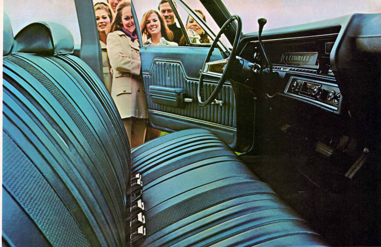
Concourse Estate and Concourse all-vinyl interior