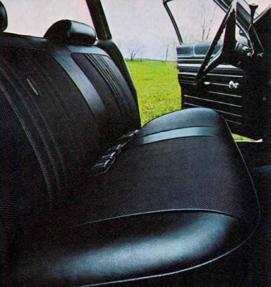
Townsman all-vinyl interior