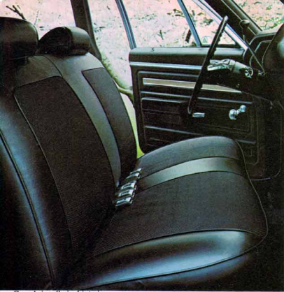
Greenbrier all-vinyl interior