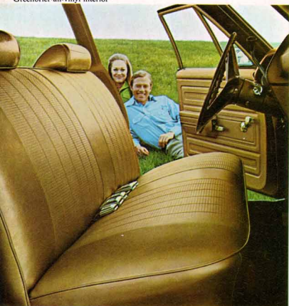
Nomad all-vinyl interior