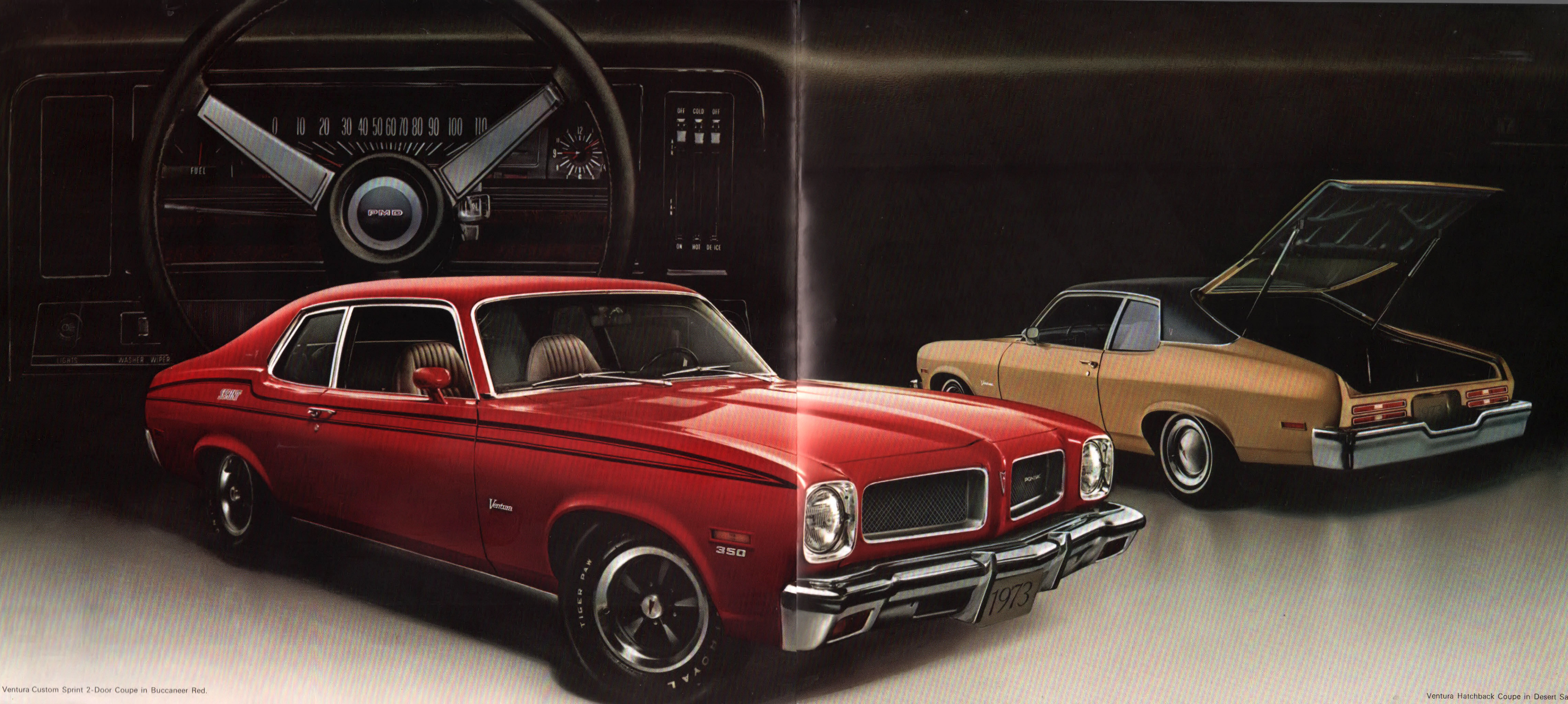
Ventura Custom Sprint 2-Door Coupe in Buccaneer Red.