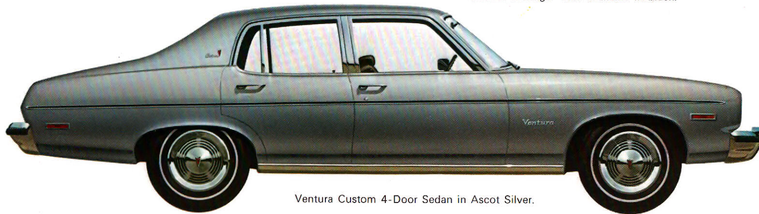
Ventura Custom 4-Door Sedan in Ascot Silver.