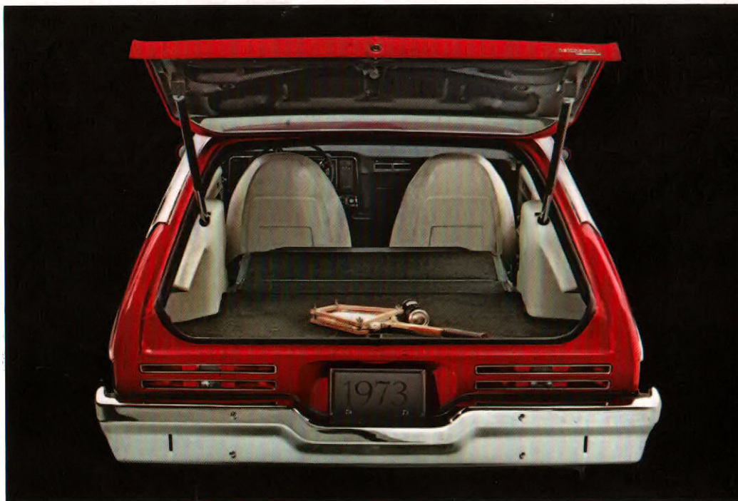
The Ventura Hatchback hatch.

New improved front and rear bumper systems. New ventless side windows. New grille design with chrome outline moldings. Windshield and backlight reveal moldings. New split tail lamps.