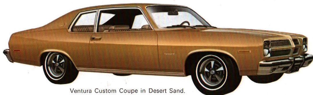
Ventura Custom Coupe in Desert Sand.

Bucket seats on 2-door models. Space-saver spare tire. AM or AM/FM radios. Variable-