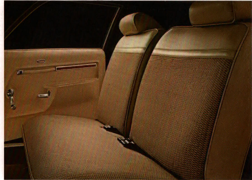
Standard bench seat upholstered in cloth and Morrokide. Shown in beige—also available in black.

Now that's flexibility at a low price for you. Aren't you glad the Pontiac people have a way with compacts!