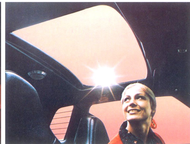
Power Sky Roof. The crowning customizing touch for an action car. Make sure prospects know that it's power operated (no fumbling with latches) and forms an all-metal, tightly sealed roof when closed (no flapping cloth to deteriorate).