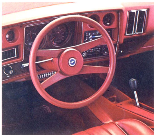
Sport steering wheel. A smart four-spoke design with a good, hefty feel. Special instrumentation adds a tach, voltmeter, temperature gauge and clock to Laguna's already impressive panel.