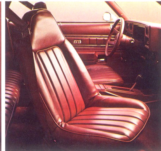
Swivel buckets. Probably the highest priority option for the Laguna buyer, these deeply contoured action buckets add to the sporty look of the Laguna interior.