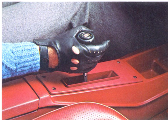
Center console. Mention its sportiness, including the transmission shift lever. Includes storage compartment.