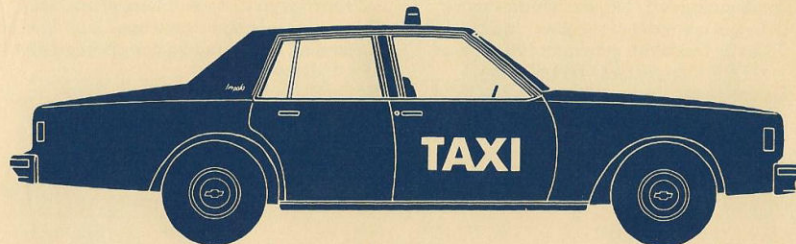
4-DOOR SEDAN 1BL69