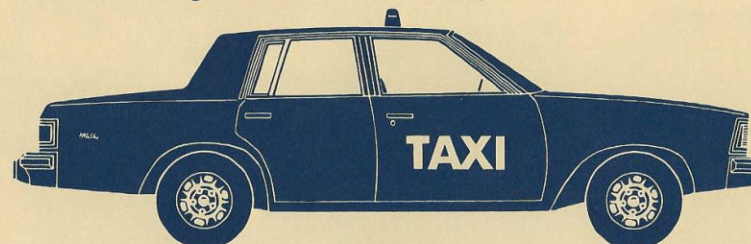
4-DOOR SEDAN 1AT69