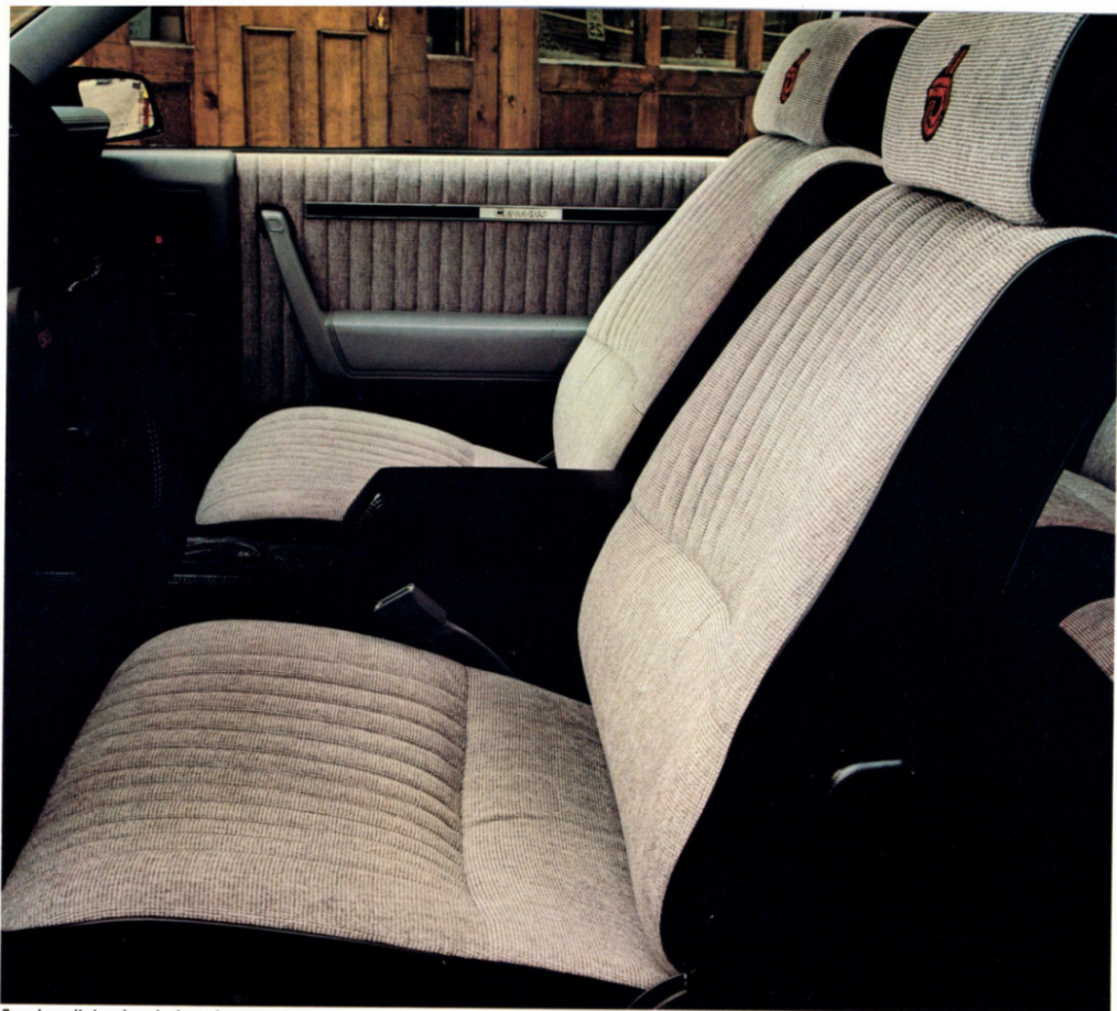
Front reclining bucket seats

Inside and out, the new Century Gran Sport comes with an impressive number of standard features, and special touches that make this a sensational sport coupe.