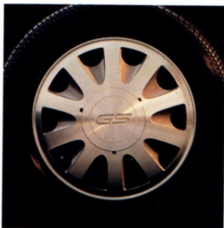
Gran Sport aluminum wheels