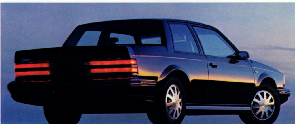
Rakish deck lid spoiler