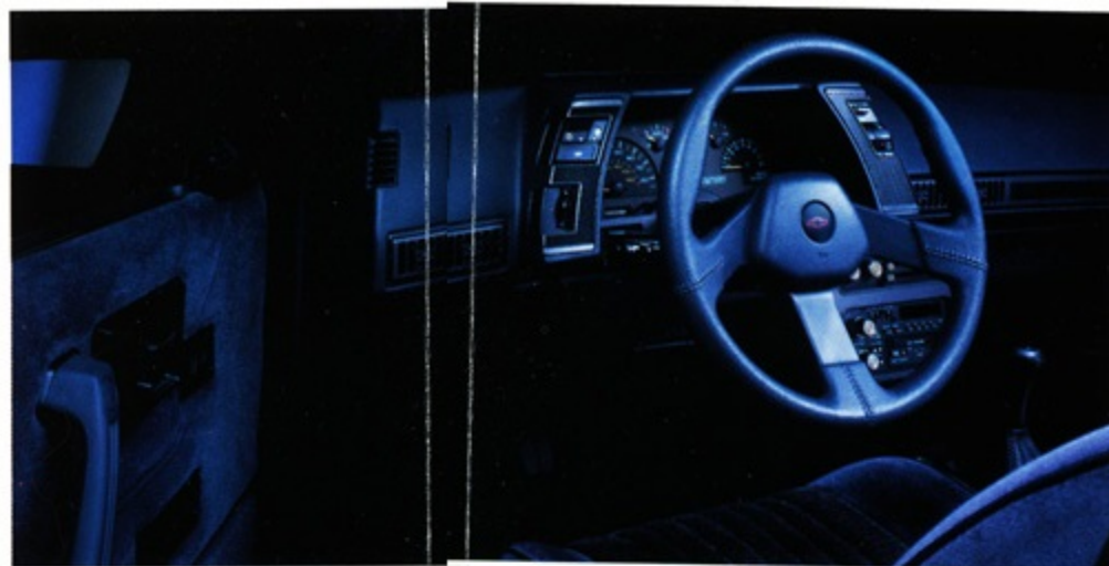
Cavalier RS interior.

Cavalier's sportiest models are the Z24 Coupe and Z24 Convertible. In addition to exclusive styling, the Z24 features a high-output 2.8 Liter V6 with Multi-Port Fuel Injection, Special Sport Suspension, 14" Eagle GT+4 tires on aluminum wheels and a new Sport Cloth interior. New for '89 on Z24 Coupe, a standard split-folding rear seat offering convenient access to the trunk.