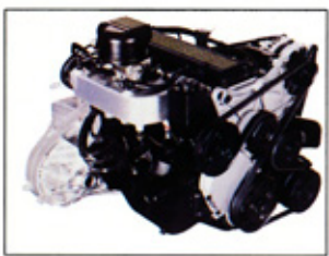
2.0 Liter L4 with Electronic Fuel Injection.