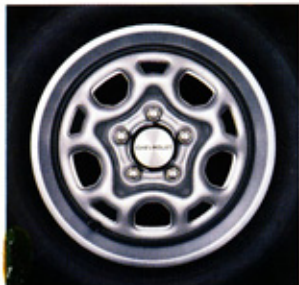
Standard 13" styled steel wheel.