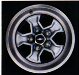
Cavalier RS 14" Rally Wheel.