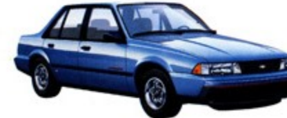
Cavalier RS Sedan.