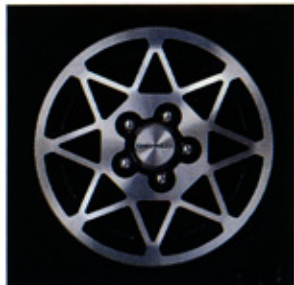
Optional 13" aluminum wheel.