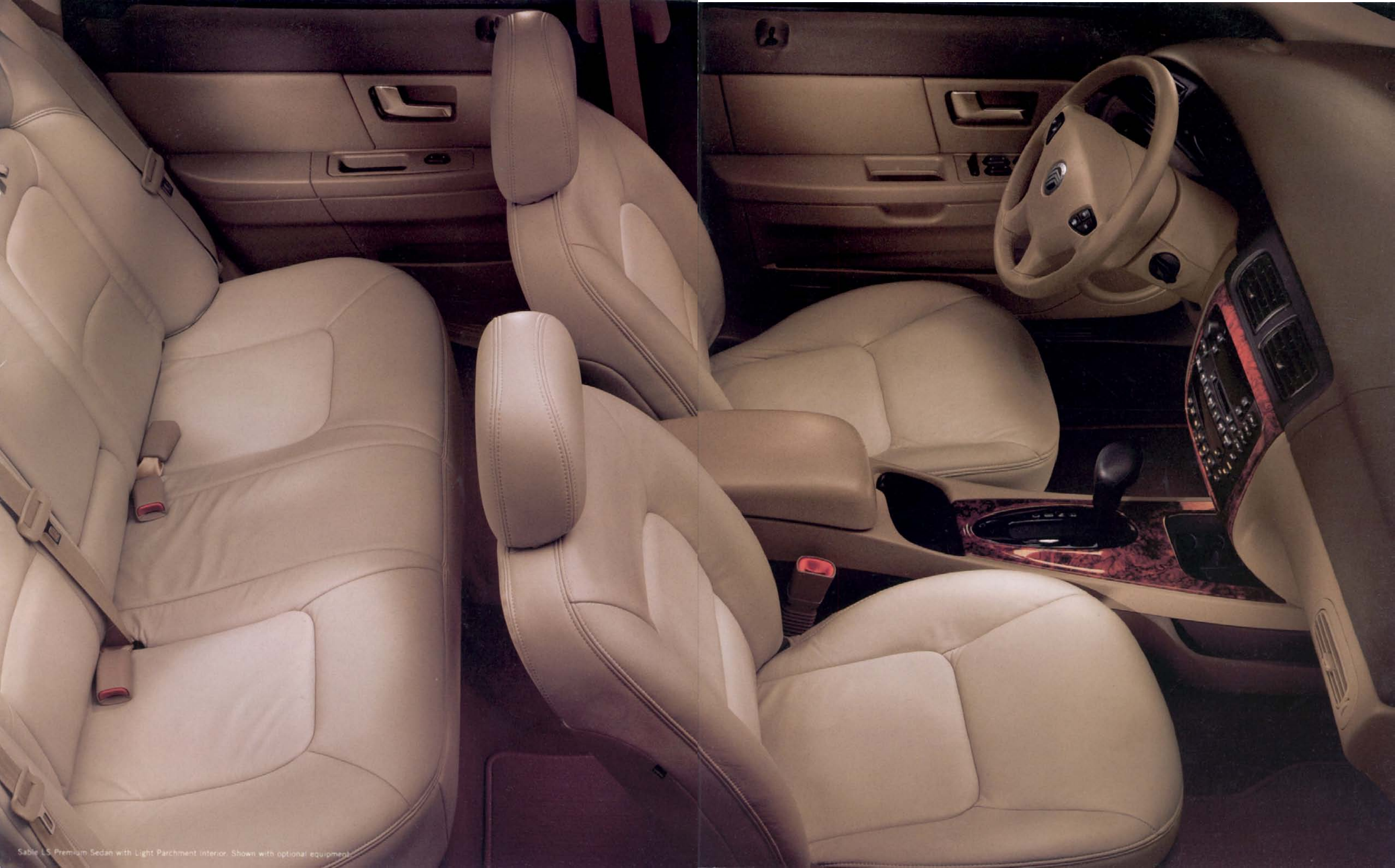
Sable L5 Premium Sedan with Light Parchment interior. Shown with optional equipment.