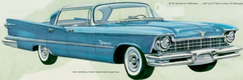
THE IMPERIAL FOUR-DOOR SOUTHAMPTON

Slide behind the wheel of an Imperial. [Notice that it's recessed and padded for your safety.] See the rich interior appointments . . . fine fabrics and leathers . . . deep-pile carpeting . . . colors carefully coordinated . . . impeccable taste throughout with the unique Imperial touch. This interior has the elegant, spacious atmosphere of an exclusive clubhouse . . . and you'll feel a sense of belonging.