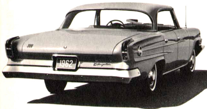
300 FOUR-DOOR HARDTOP combines full-size family room and comfort with hot-blooded 300 performance! All-vinyl interior is optional.

Drive and price a new Chrysler 300. Compare it with the competitive sports-type cars the 300 has inspired. You'll settle for nothing less than the genuine article—one of the great 300's by Chrysler!