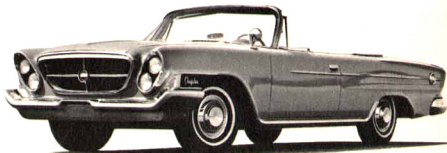
300 CONVERTIBLE features as standard equipment individual bucket seats and center arm rests in front with bucket-style bench seat in rear, all in genuine leather and seating six passengers comfortably.