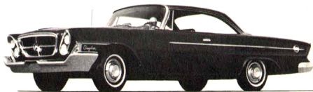
The 300 TWO-DOOR HARDTOP offers the same bucket seat arrangement as the convertible, optional at extra cost.

THESE stout new Chryslers let you customize the exact combination of performance and luxury you want. Pick from three potent FirePower engines—the FirePower 305, the FirePower 340 or the FirePower 380 (the same that pushes the H!). Choose either bench-type seats in cloth-and-vinyl or all-vinyl—or bucket front seats in genuine hand-rubbed leather. There's a wide variety of other options to choose from, too—including stick shift or pushbutton Torque-Flite transmissions.*