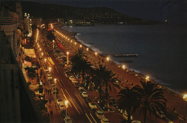
Nice, looking east on the Promenade des Anglais

Visit Leonard Ely Company, 300 El Camino Real, Menlo Park, Calif.