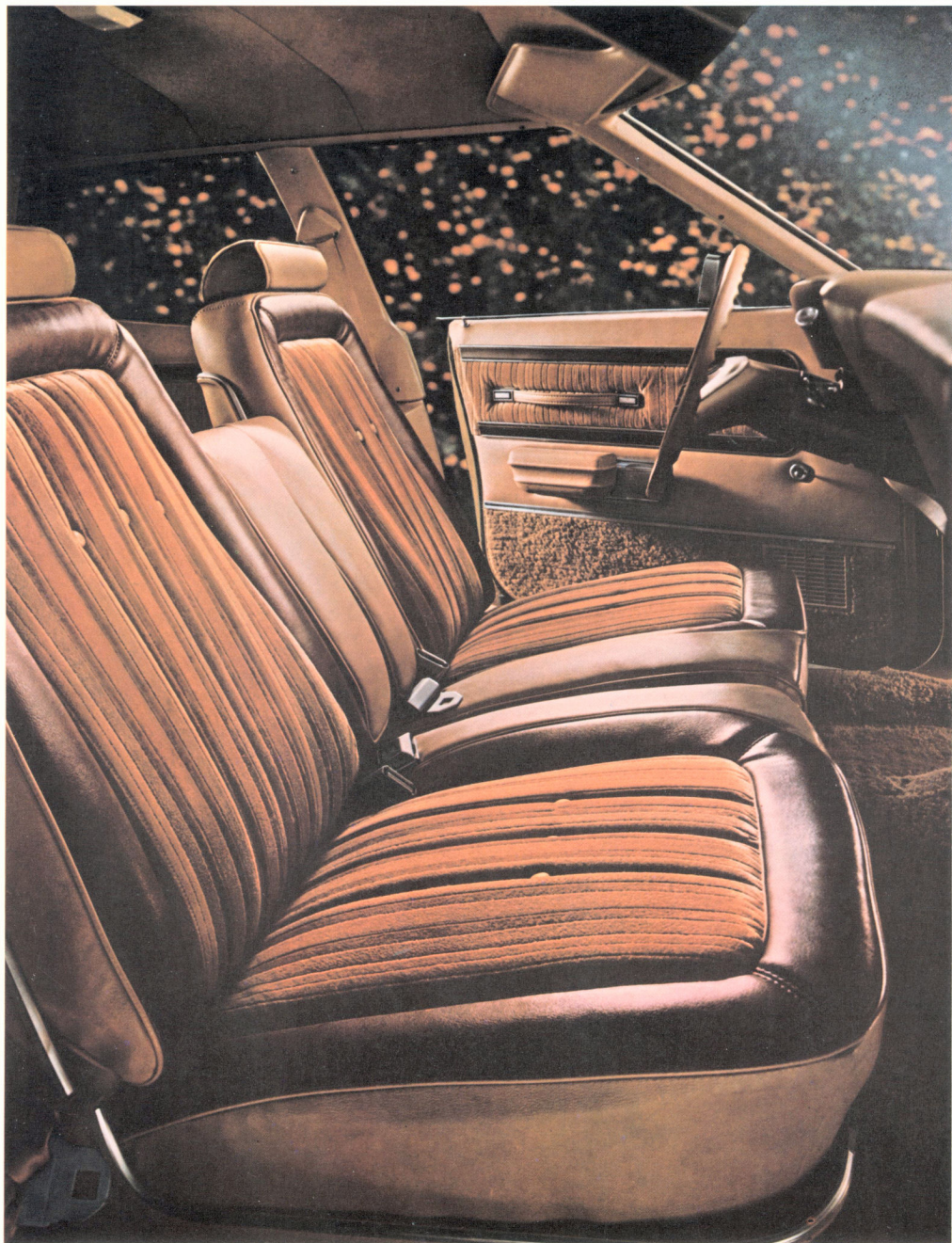
Mercury Montego MX Brougham interior with Custom trim option.