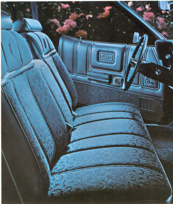
Mercury Montego MX Brougham standard interior.

Below and left: the Montego MX Brougham standard interior reflects a high level of interior luxury. Shown in cloth-and-vinyl available in black, blue, green, tan and saddle, or you may prefer super-soft all-vinyl at no extra cost. Vinyl also in white with colour-keyed components on 2-door models.