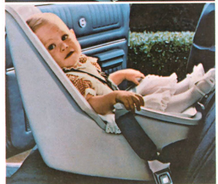
Ford Infant Safety Carrier for babies faces rearward on the seat.