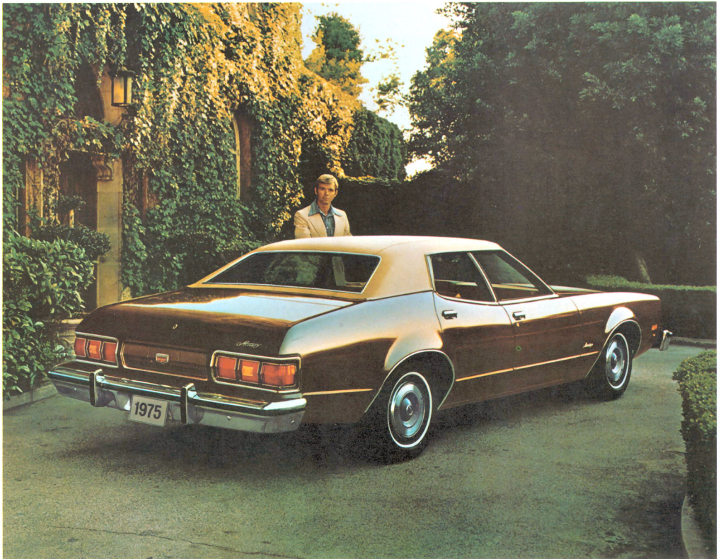
Mercury Montego 4-Door Pillared Hardtop

Standard features on Mercury Montego: 351-2V V-8 engine • Select-Shift automatic transmission • Power brakes; (front disc, rear drum) • Power steering • Solid-state ignition • HR78x14 BSW steel-belted radial ply tires • Energy absorbing bumper system • Front bumper guards • Dual headlamps • Locking steering column • Concealed windshield wipers with new wiper-mounted washer jets • Colour-keyed cut-pile carpeting • Ford Motor Company Safety Design Features. Did you know you can order an optional Security Lock Group with locks for fuel tank cap, inside hood release and spare tire?