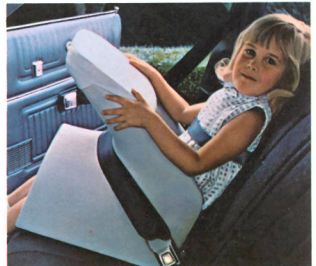
Tot-Guard Safety Seat shields children 19" to 25" tall and 20 to 50 lbs.