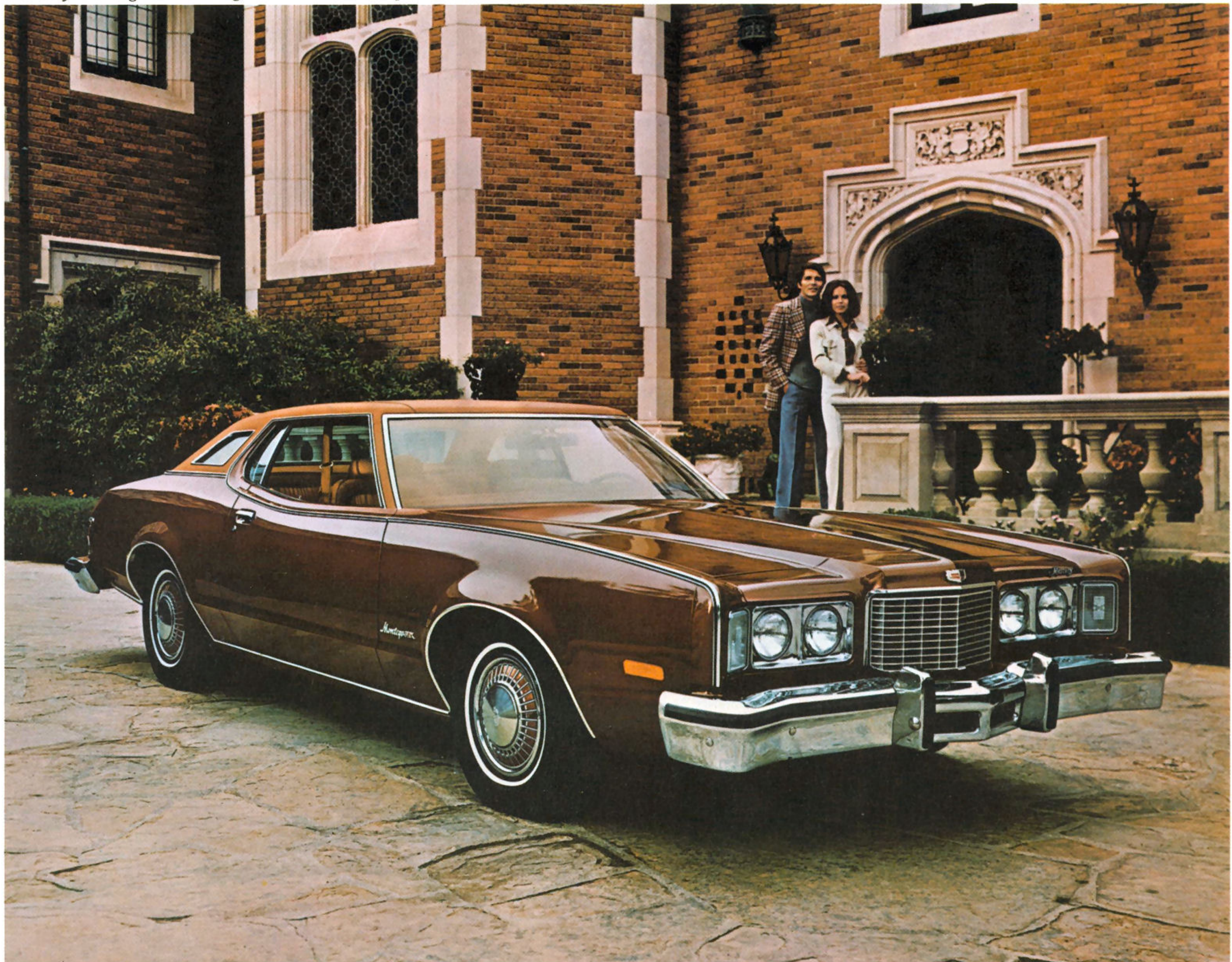
Mercury Montego MX Brougham 2-Door Hardtop with Custom Trim Option

Door pull assist straps • 22 oz. cut pile carpet • Visor vanity mirror • Levant grain full vinyl roof, or Odense grain Embassy vinyl roof • Luxury steering wheel • Unique door trim panels • Comfort Lounge seats with velour seating surfaces • Luggage compartment trim. Did you know you can expect improved tread life, ride and fuel economy from your 1975 Montego's standard steel-belted radials?