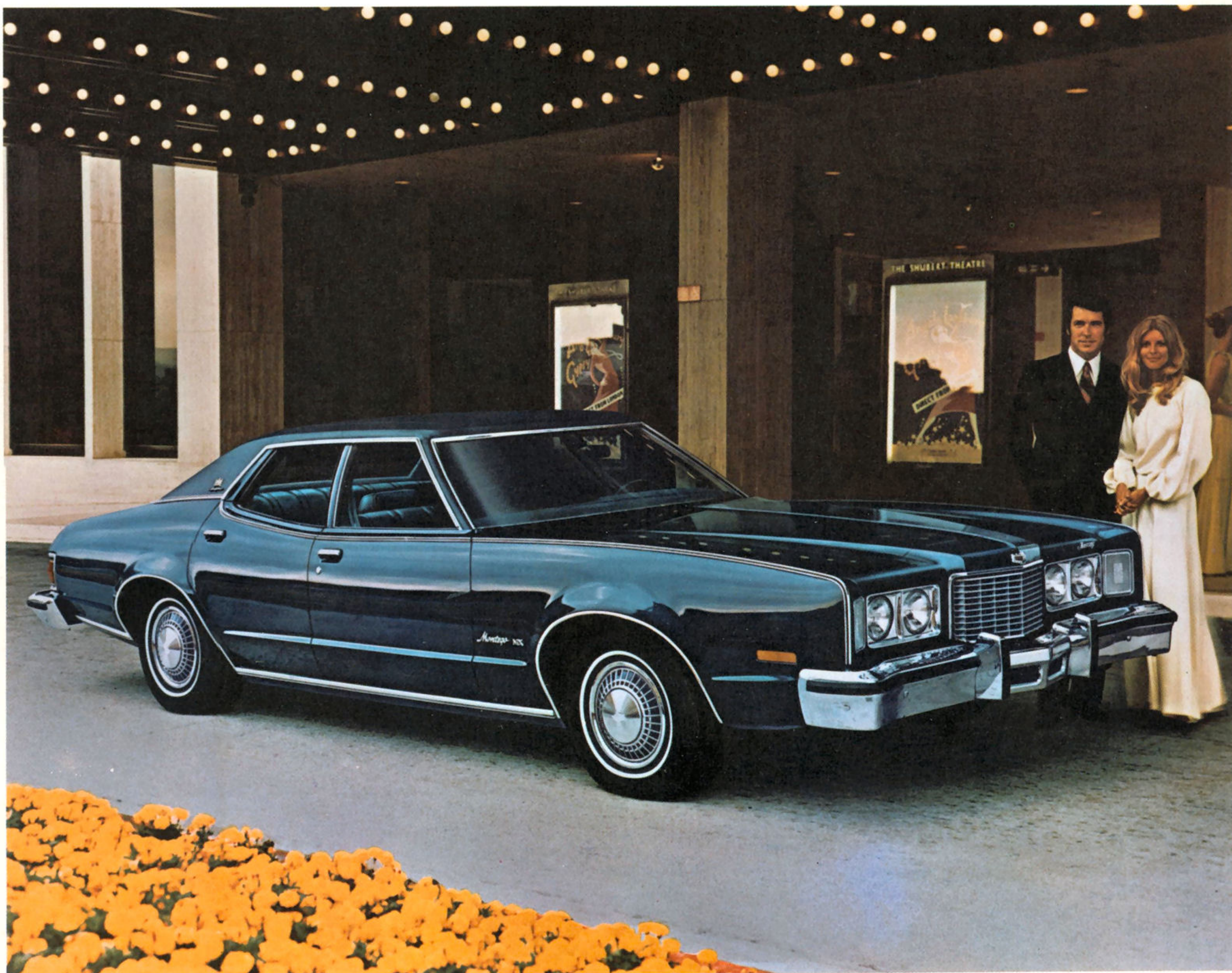
Mercury Montego MX Brougham 4-Door Pillared Hardtop

engine • Select-Shift automatic transmission • Power brakes; (front disc, rear drum) • Power steering • Solid-state ignition • HR78x14 BSW steel-belted radial ply tires • Energy absorbing bumper system • Front bumper guards • Dual headlamps • Dual note horn • Deluxe sound insulation • Deluxe wheel covers • Deluxe steering wheel • Locking steering column • Concealed windshield wipers with new wiper-mounted washer jets • Colour-keyed cut-pile carpeting • Ford Motor Company Safety Design Features. Did you know that solid-state ignition on your 1975 Montego eliminates parts that wear and replaces them with components virtually maintenance-free?