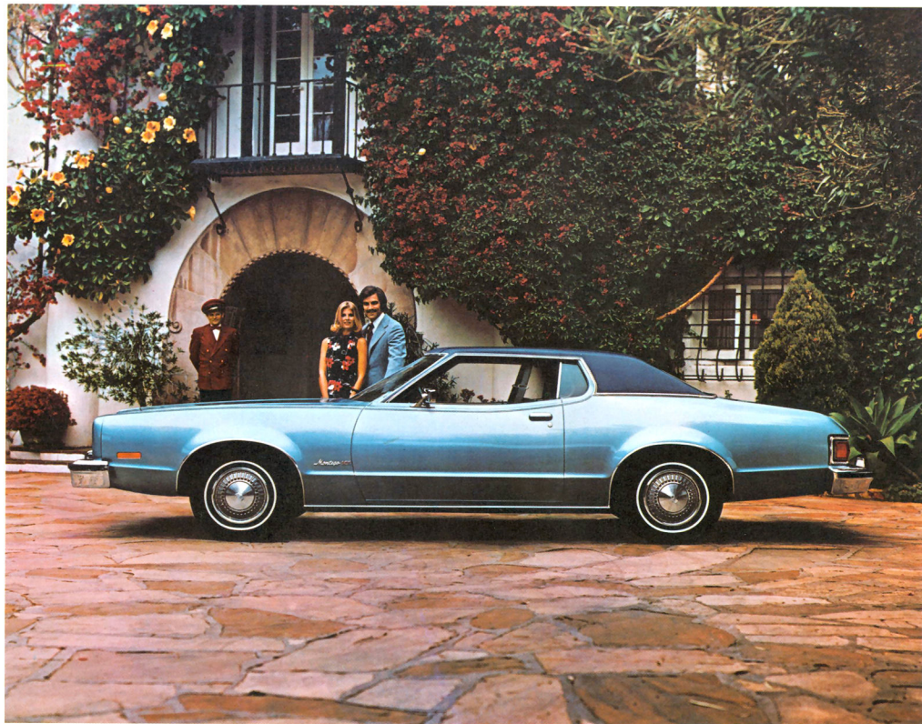
Mercury Montego MX 2-Door Hardtop

Standard features on Mercury Montego MX: 351-2V V-8 engine • Select-Shift automatic transmission • Power brakes; (front disc, rear drum) • Power steering • Solid-state ignition • HR78x14 BSW steel-belted radial ply tires • Energy absorbing bumper system • Front bumper guards • Dual headlamps • Deluxe sound insulation • Locking steering column • Concealed windshield wipers with new wiper-mounted washer jets • Colour-keyed cut-pile carpeting • Ford Motor Company Safety Design Features. Did you know every Montego is finished with seven coats of super-acrylic enamel for lasting beauty?