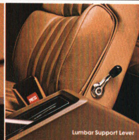
Lumbar Support Lever