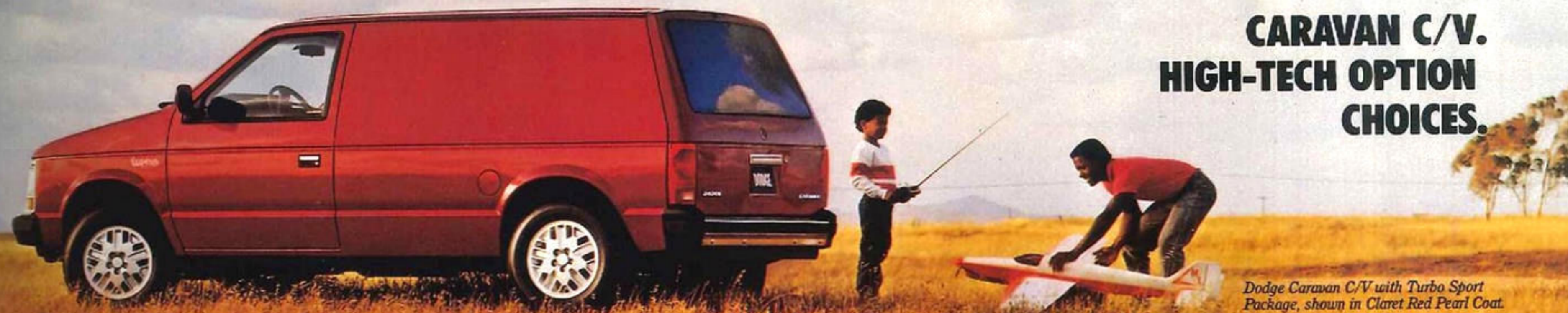
Dodge Caravan C/V with Turbo Sport Package, shown in Claret Red Pearl Coat.