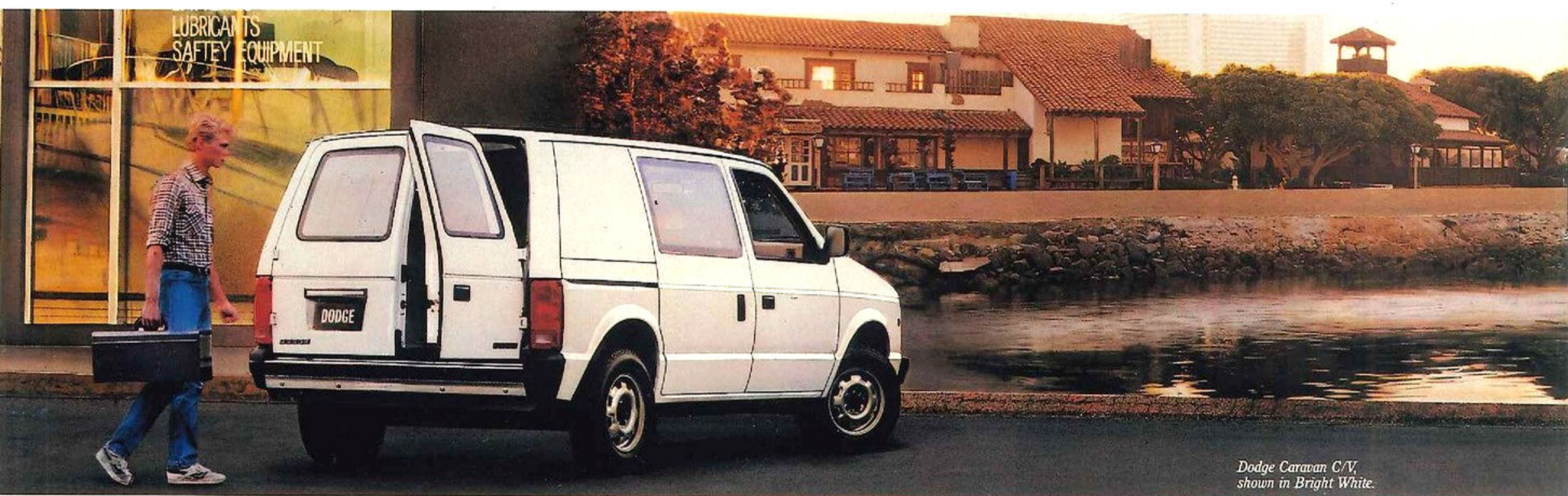
Dodge Caravan C/V, shown in Bright White.

Specifications, descriptions, and illustrative materials contained herein are as accurate as known at the time this publication was approved for printing. Chrysler Motors reserves the right to discontinue models or options at any time or change specifications and materials, equipment, and design without notice and without incurring obligation. All options and accessories illustrated or referred to as optional or available in this publication are at extra cost. Some options are required in combination with other options. For the price of the model with the equipment you desire, or verification of specifications contained here, see your Dodge Truck dealer.