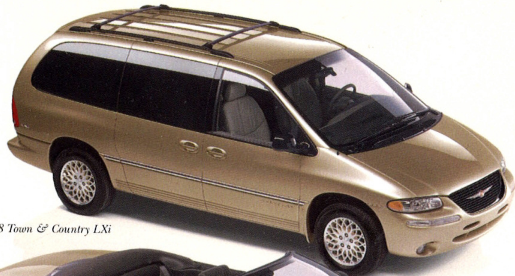
1998 Town & Country LXi