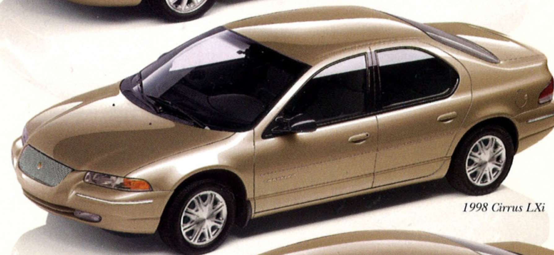
1998 Cirrus LXi