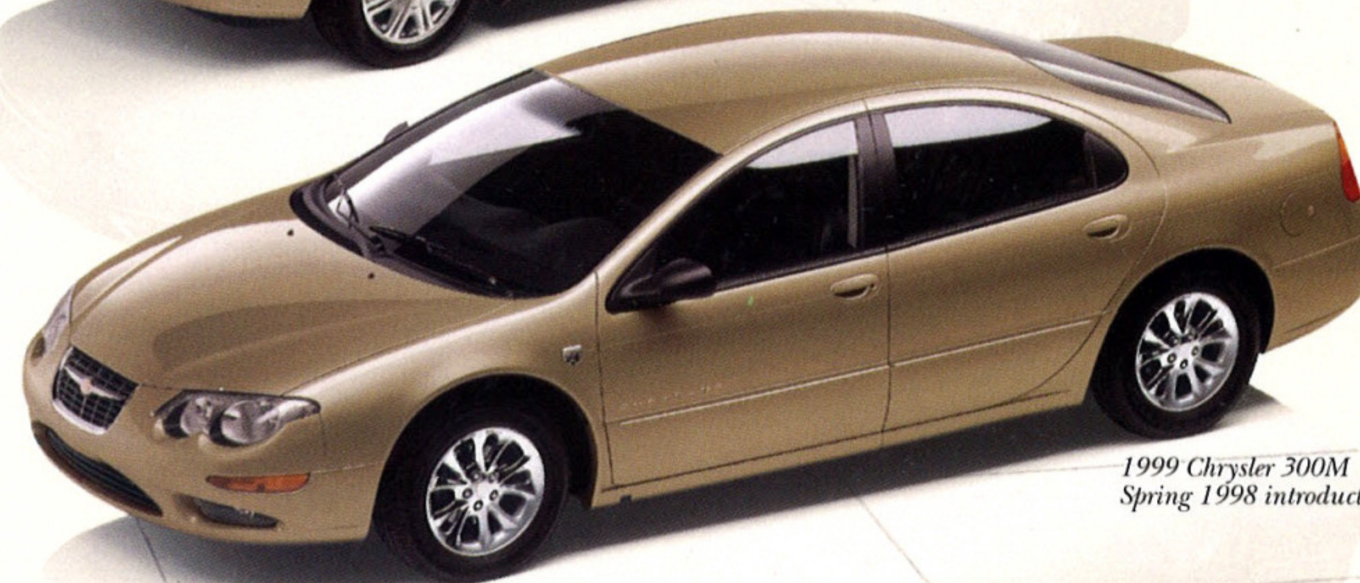
1999 Chrysler 300M Spring 1998 introduction