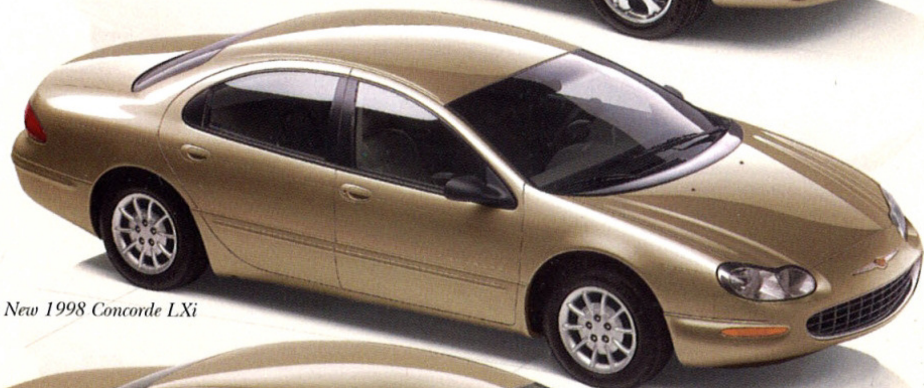
The New 1998 Concorde LXi