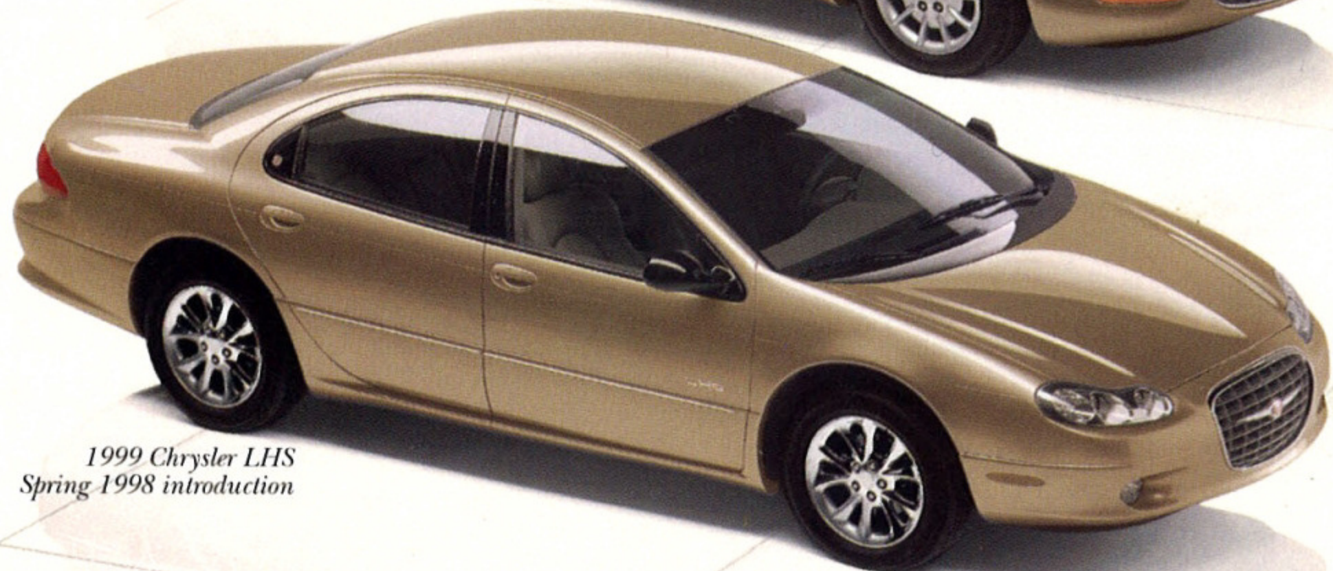
1999 Chrysler LHS Spring 1998 introduction