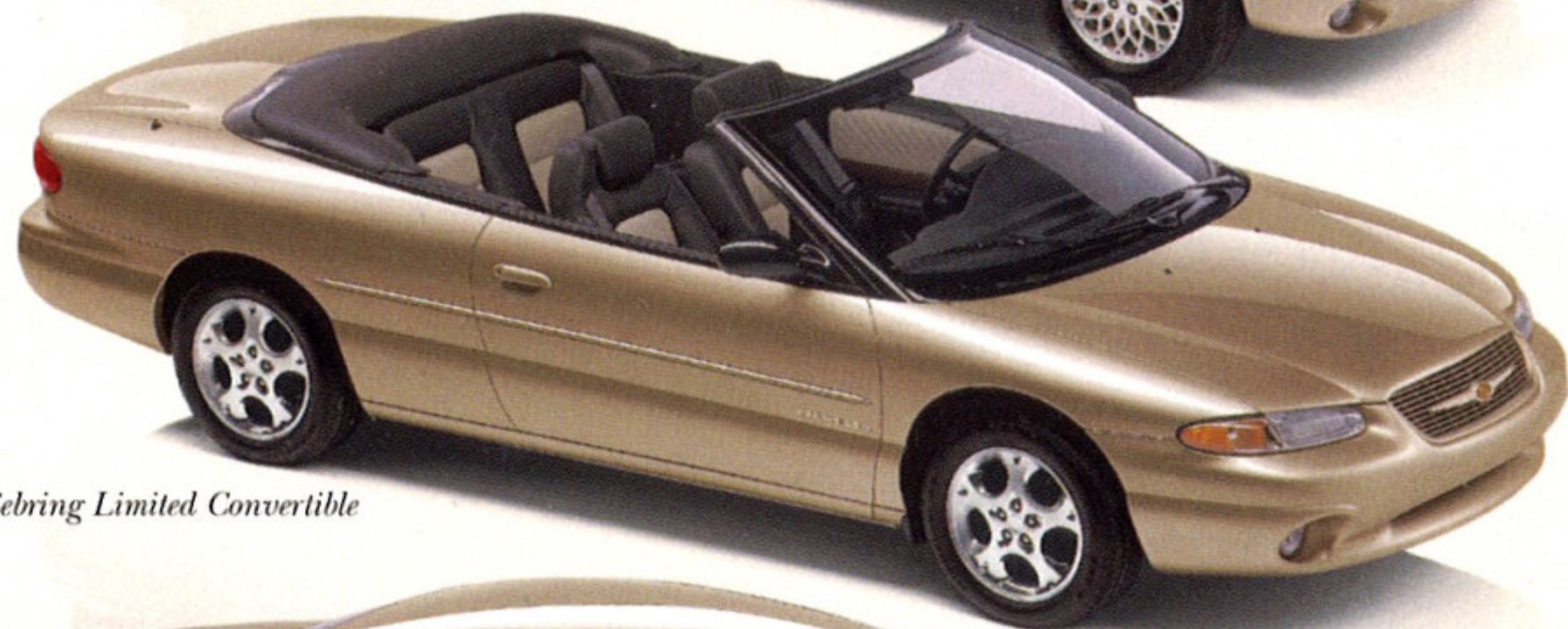
1998 Sebring Limited Convertible