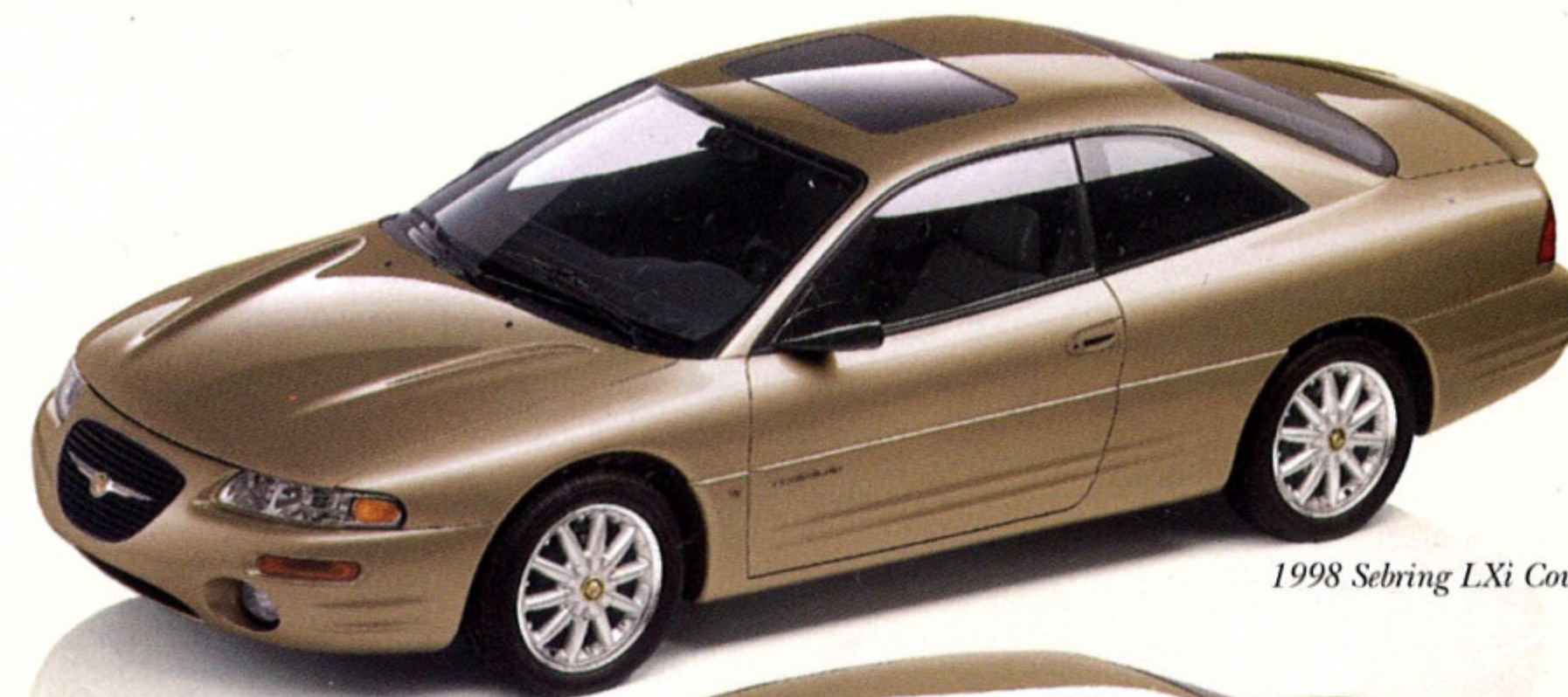
1998 Sebring LXi Coupe