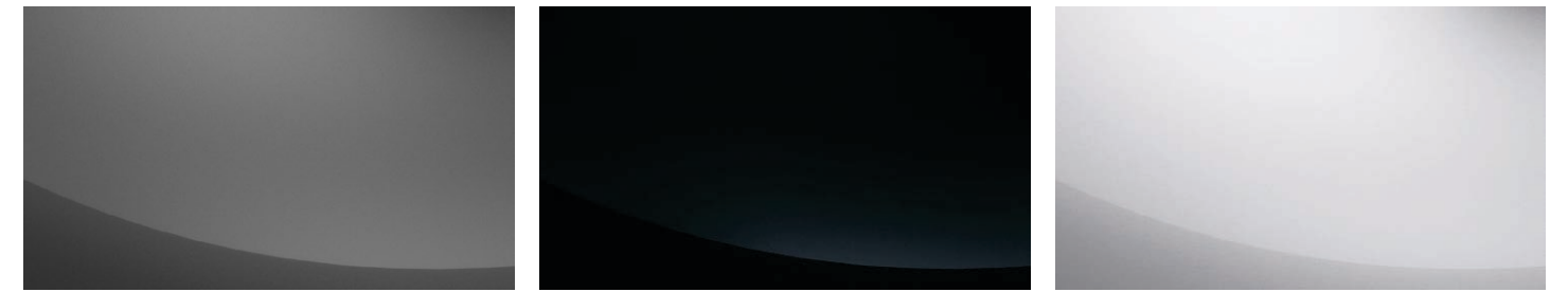
NEBULA GRAY PEARL OBSIDIAN SILVER LINING METALLIC