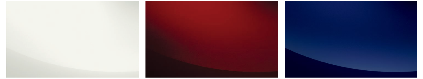
STARFIRE PEARL MATADOR RED MICA DEEP SEA MICA