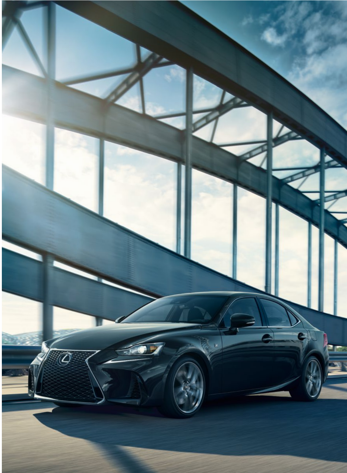
IS F SPORT shown in Obsidian