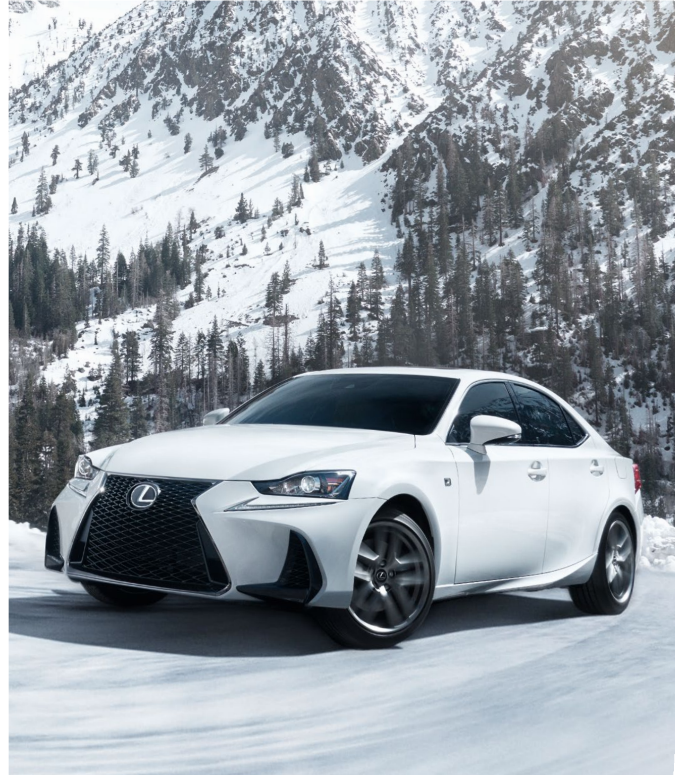
IS F SPORT shown in Ultra White