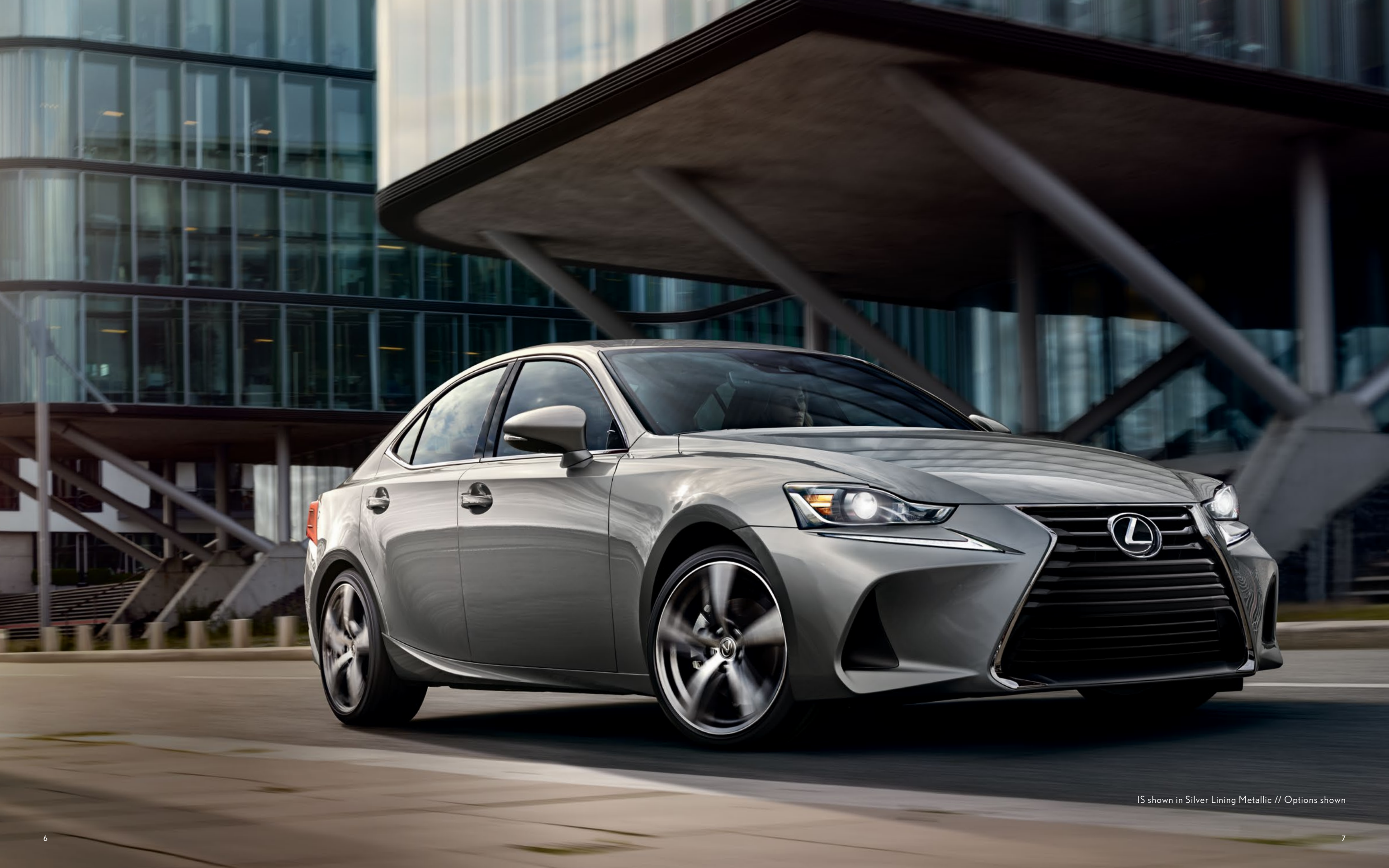
IS shown in Silver Lining Metallic // Options shown