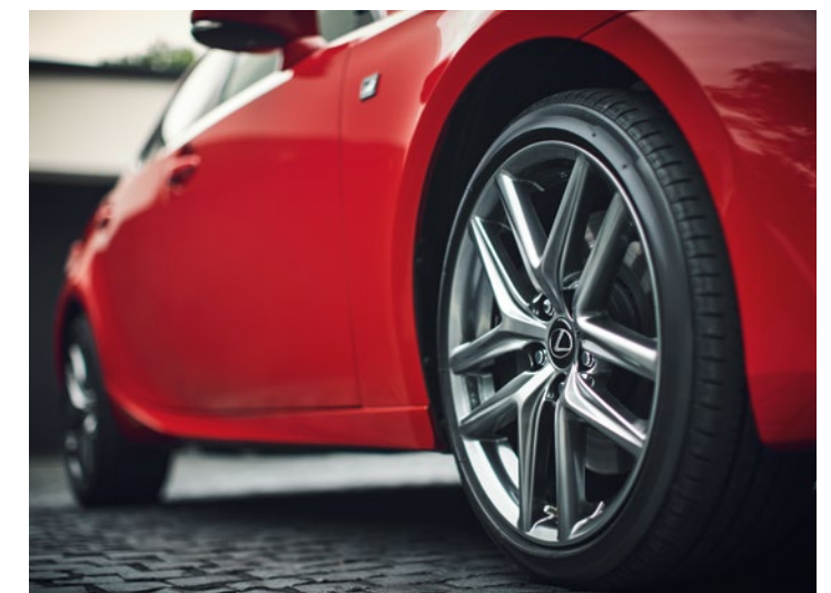
IS F SPORT shown with Rioja Red NuLuxe and Silver Performance interior trim // Options shown

Exclusive 18-inch alloy wheels 26 feature a dynamic split-spoke design inherited from the LFA, and pair with high-friction brake pads 27 designed to offer greater responsiveness and reduced fade.