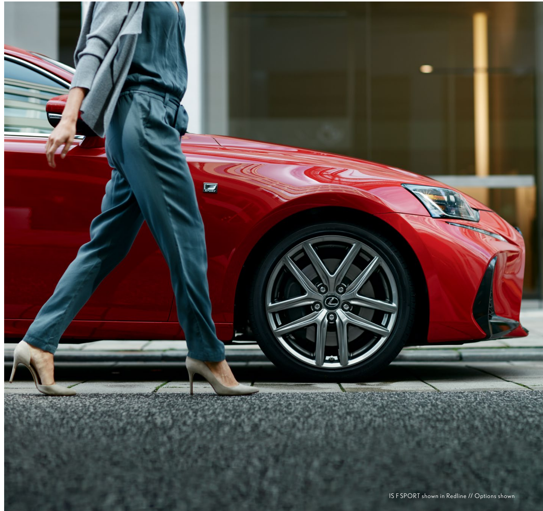
IS F SPORT shown in Redline // Options shown