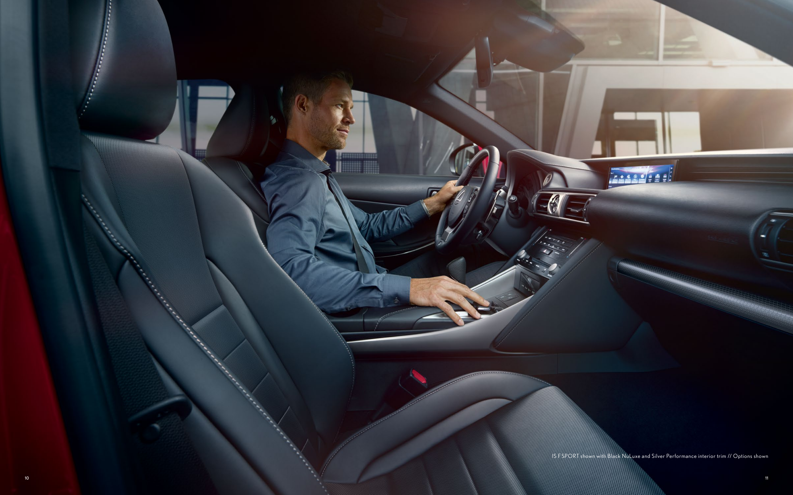
IS FSPORT shown with Black NuLuxe and Silver Performance interior trim // Options shown