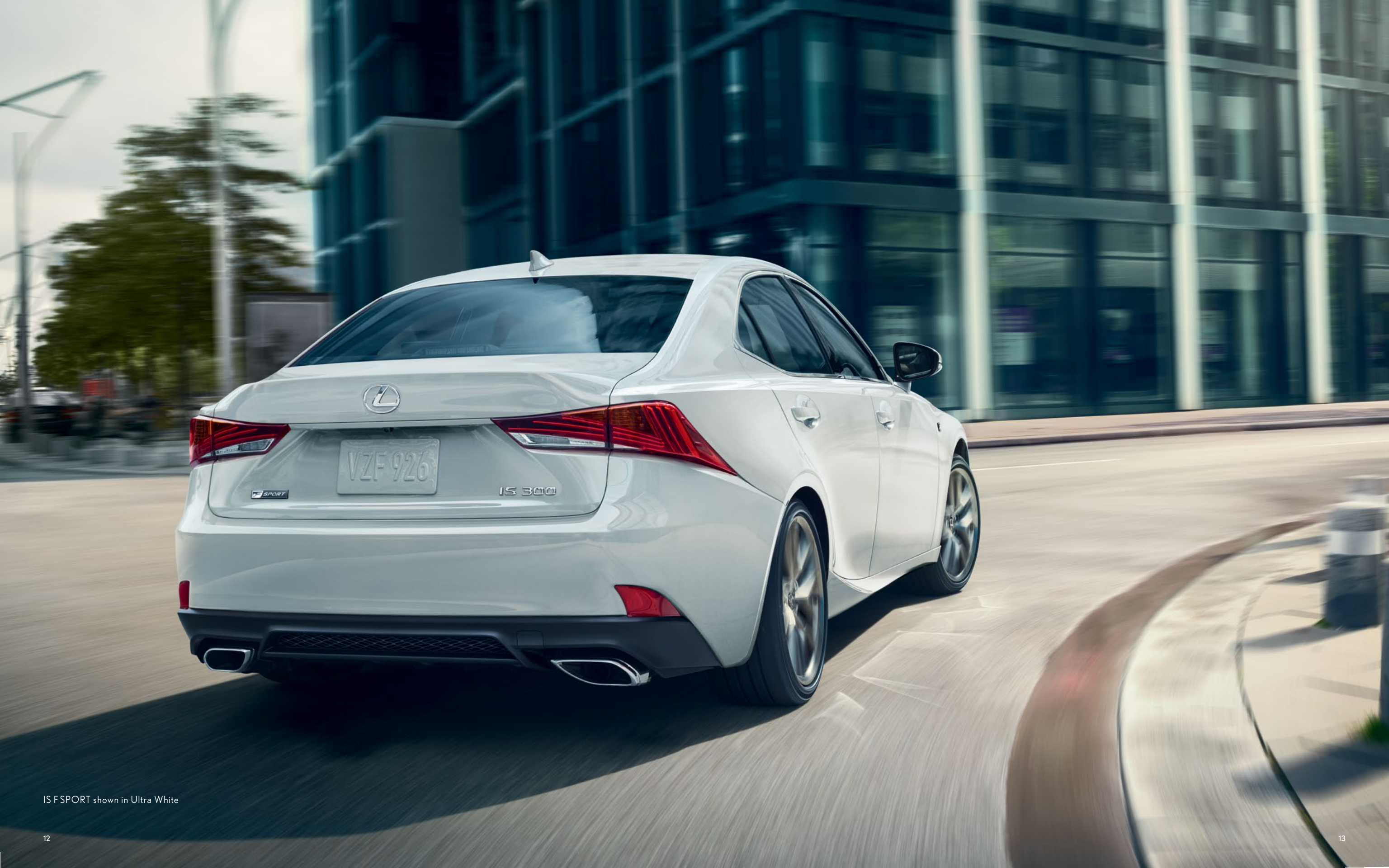
IS F SPORT shown in Ultra White