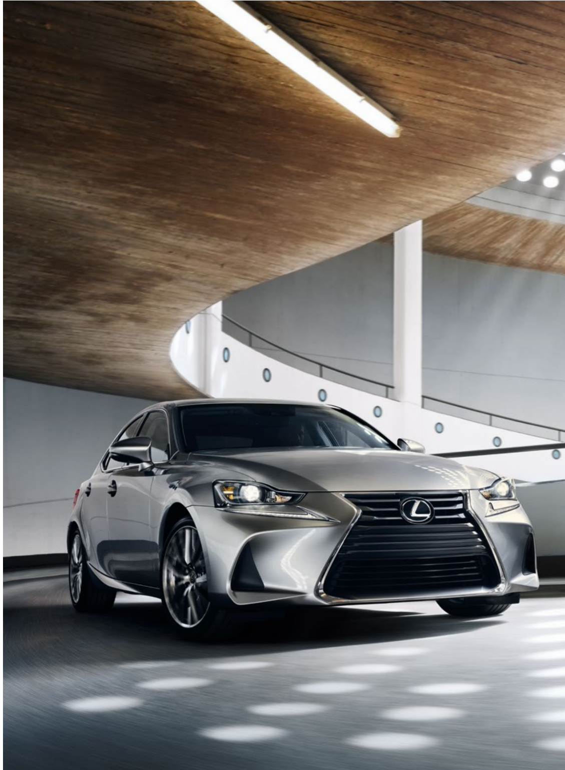
IS shown in Atomic Silver // Options shown