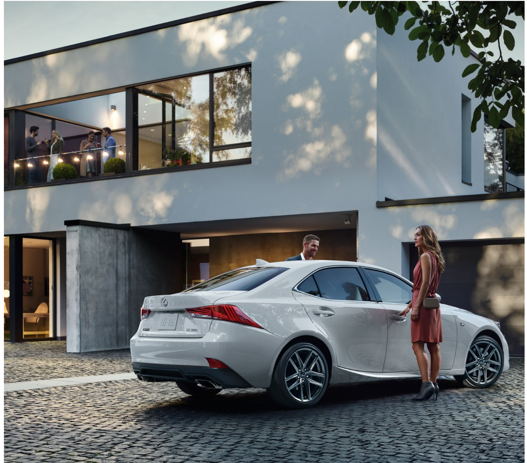
IS F SPORT shown in Ultra White

Split-five-spoke alloy wheels 26 STANDARD IS F SPORT