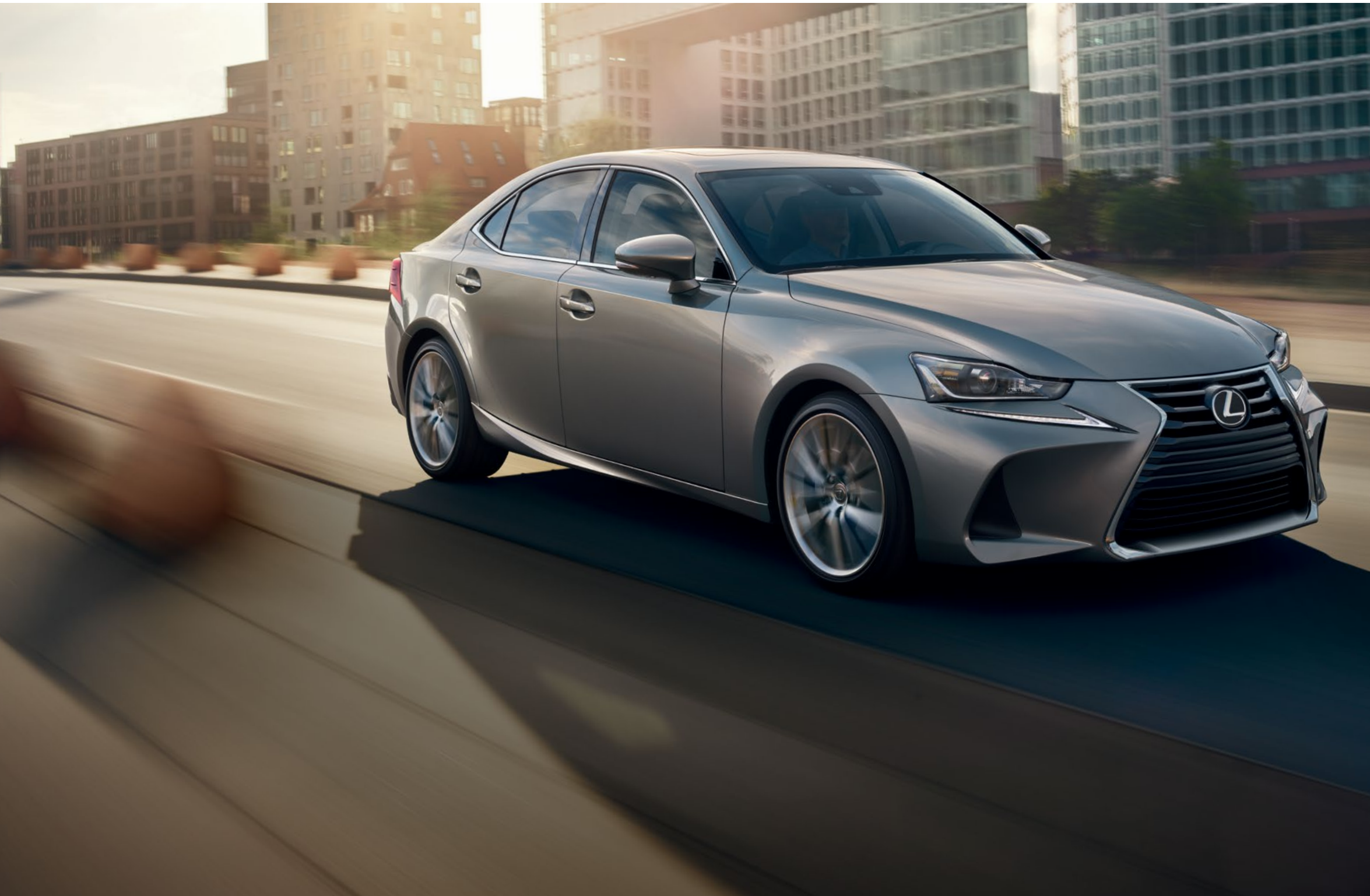
IS shown in Atomic Silver // Options shown

The 2018 IS makes its track-honed heritage known with a ground-hugging, aerodynamic exterior and assertive styling. An aggressive stance and a striking front fascia are punctuated by sculpted lines that finesse their way from the rocker panels through the rear wheel arches and culminate in the dramatic, sweeping taillamps.