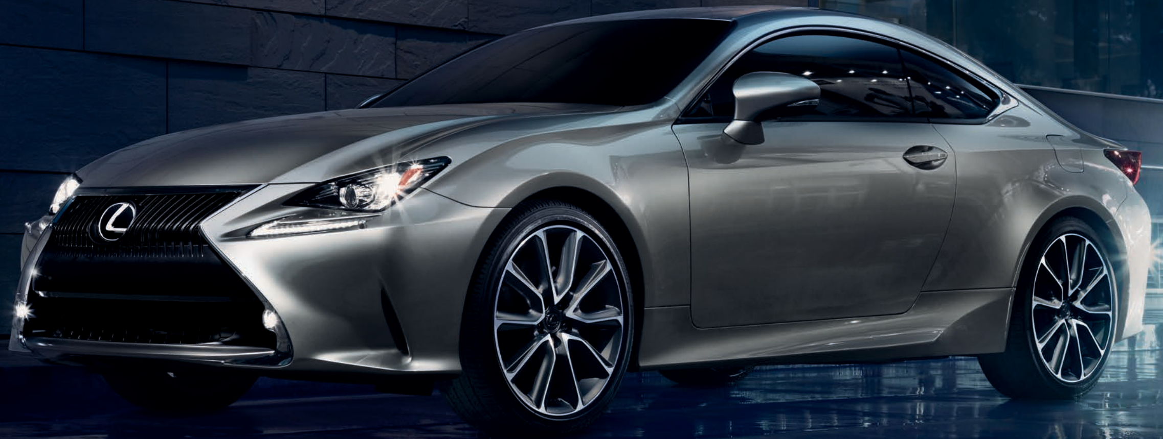
RC shown in Atomic Silver // Options shown