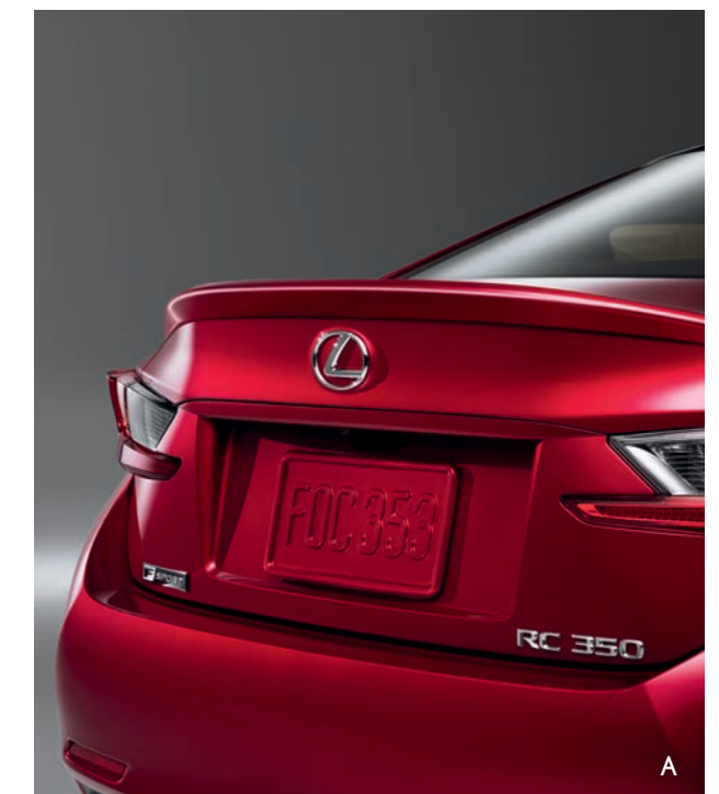
For a complete list of Genuine Lexus Accessories, visit lexus.com/RC/accessories . Options shown.