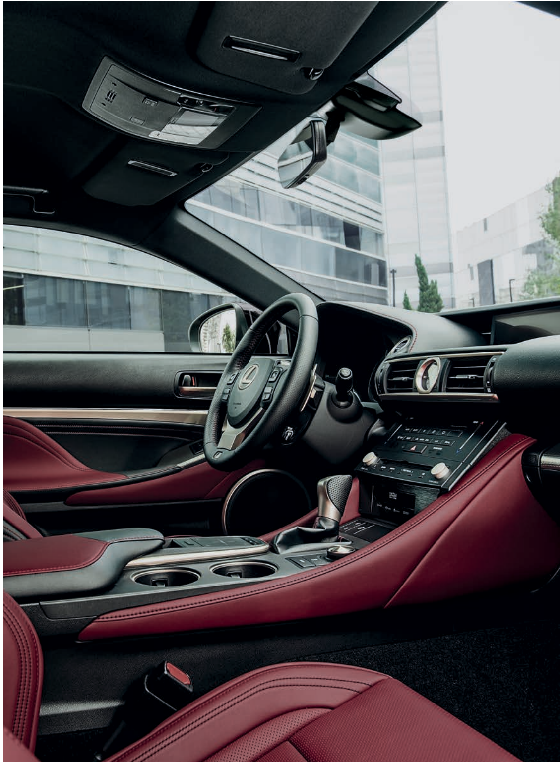
RC FSPORT shown with Rioja Red NuLuxe and Silver Performance interior trim // Options shown