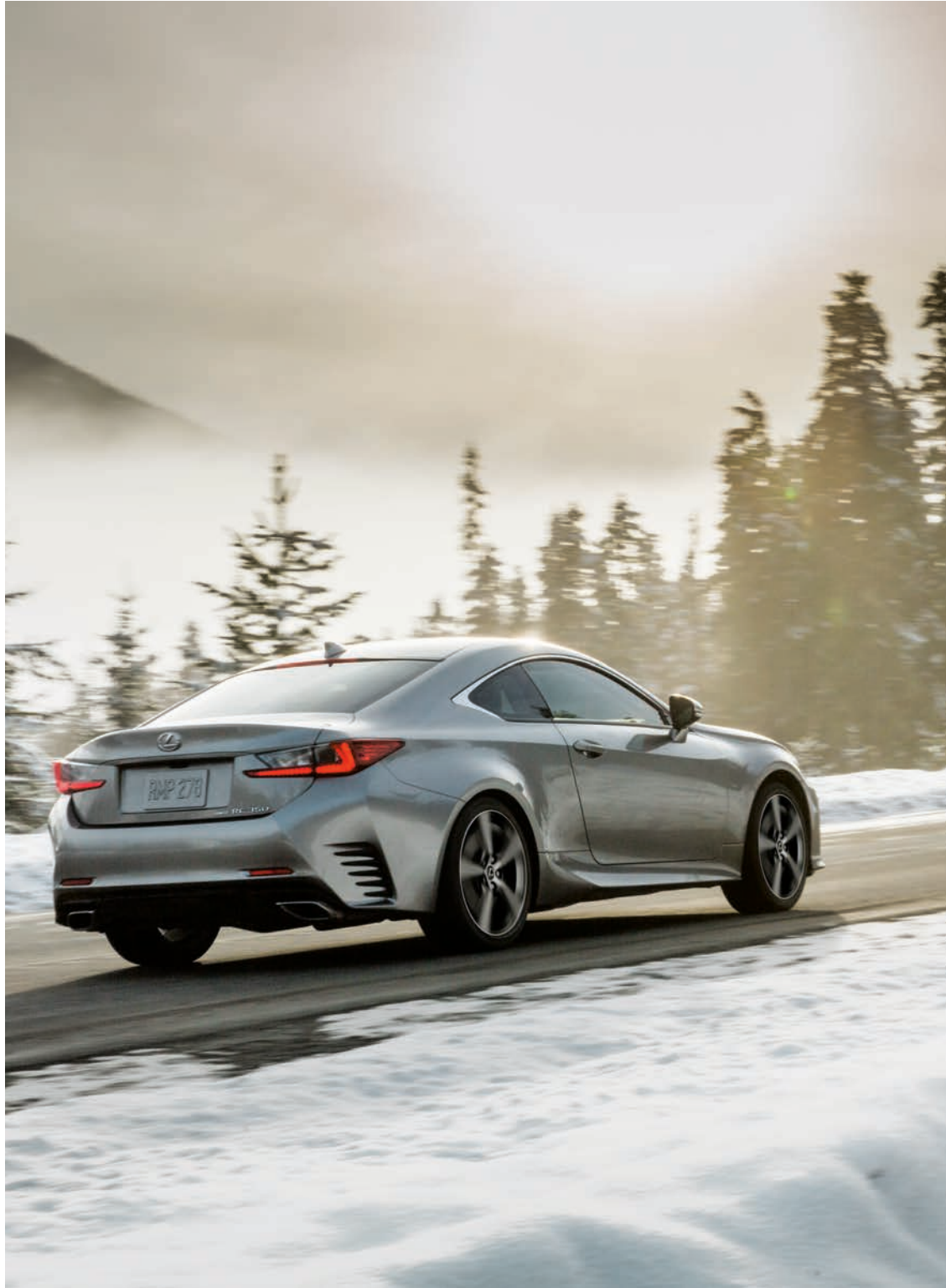
RC AWD shown in Silver Lining Metallic // Options shown