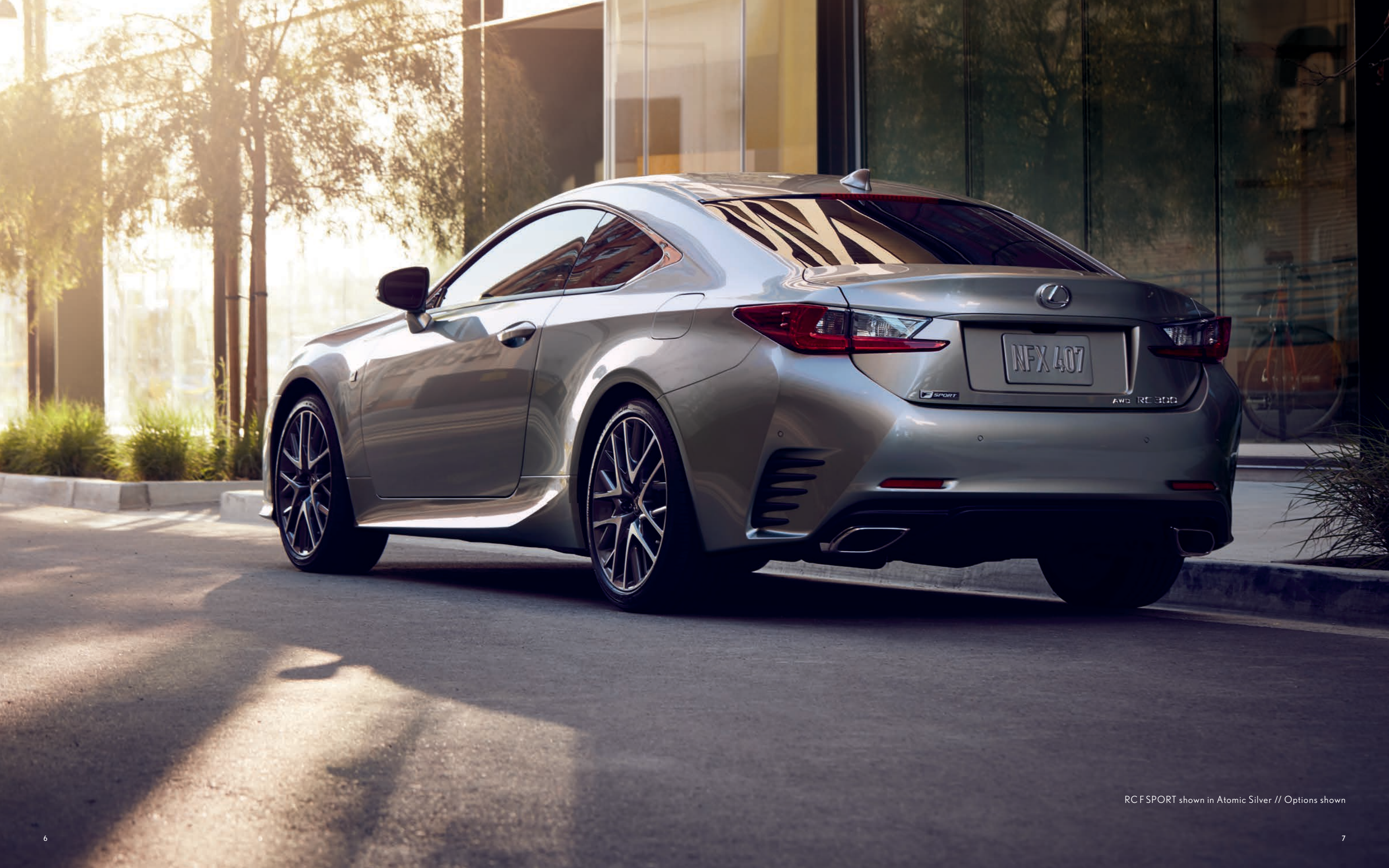
RC F SPORT shown in Atomic Silver // Options shown