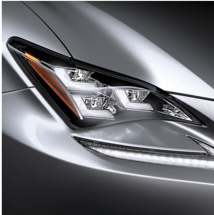
RC FSPORT shown in Ultra White // Options shown

— A low profile and sleek, sculpted lines create double-take-worthy style.