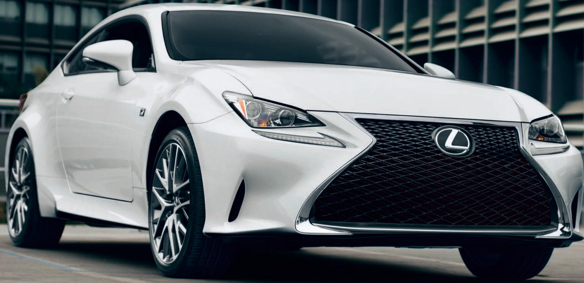
RC F SPORT shown in Ultra White