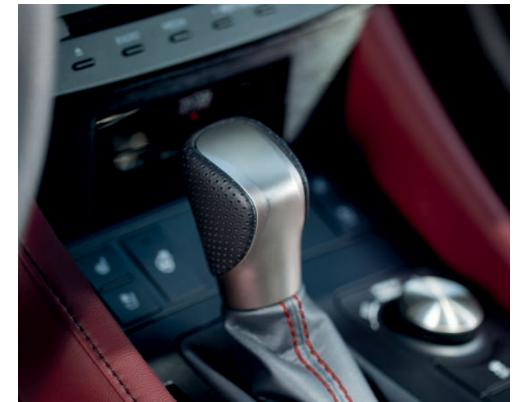
RC F SPORT shown with Rioja Red NuLuxe and Silver Performance interior trim // Options shown

Exclusive trim highlights race-inspired features, including an F SPORT-badged steering wheel, a perforated leather-trimmed shift knob, aluminum sport pedals, Silver Performance accents and the exclusive option of bold Rioja Red NuLuxe trim with unique stitching.