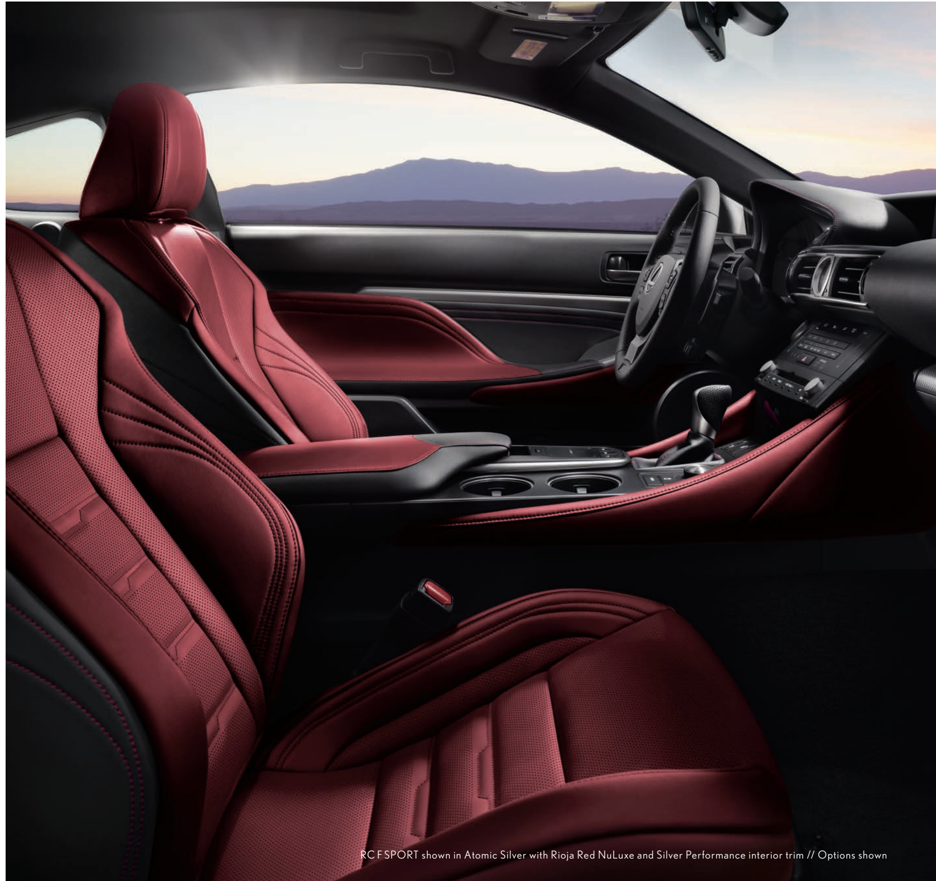
RC F SPORT shown in Atomic Silver with Rioja Red NuLuxe and Silver Performance interior trim // Options shown