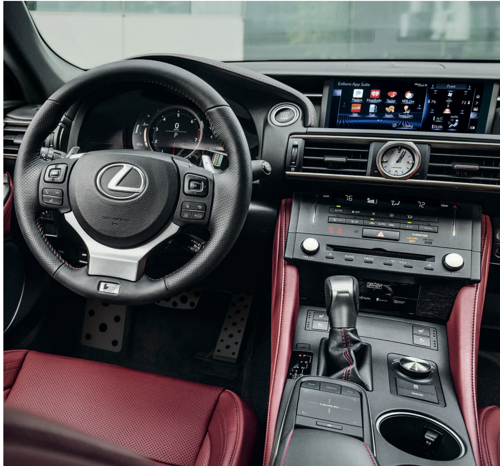
RC F SPORT shown with Rioja Red NuLuxe and Silver Performance interior trim // Options shown

Lexus Enform Service Connect 17 offers remote access to information about your vehicle's status and maintenance needs. Easily accessed through LexusDrivers.com or the Lexus Drivers mobile app, you can get information on everything from your vehicle's fuel level and mileage to maintenance alerts and Vehicle Health Reports. Service Connect is complimentary for the first 10 years of ownership.