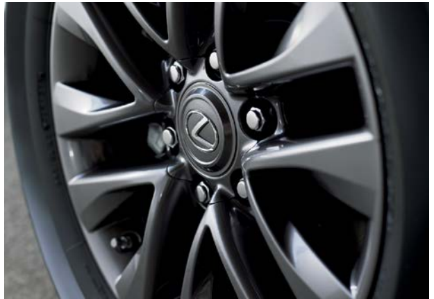
GX shown in Silver Lining Metallic // Options shown

— Designed to the highest and most exact standards. Ours.