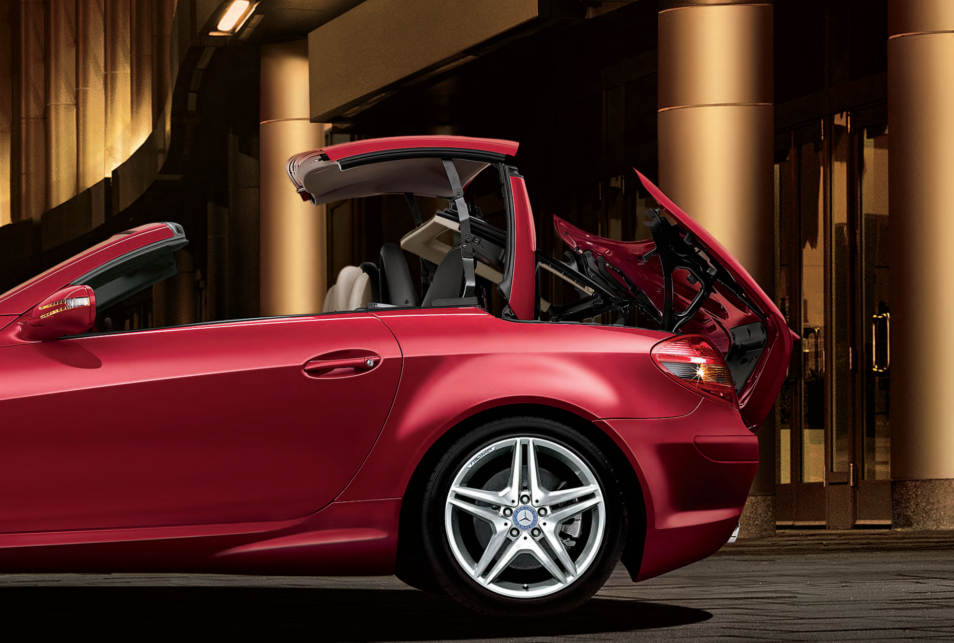
SLK350 shown with Mars Red paint, Beige leather interior, and optional Sport Package 2. Please see endnotes at back of brochure.