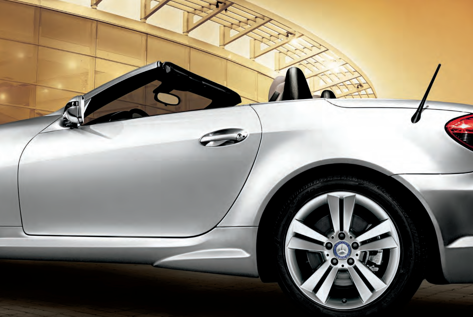
SLK 350 shown on covers with optional Palladium Silver metallic paint, Red leather interior, and optional Heating Package. SLK 300 shown above with Arctic White paint and Beige leather interior.