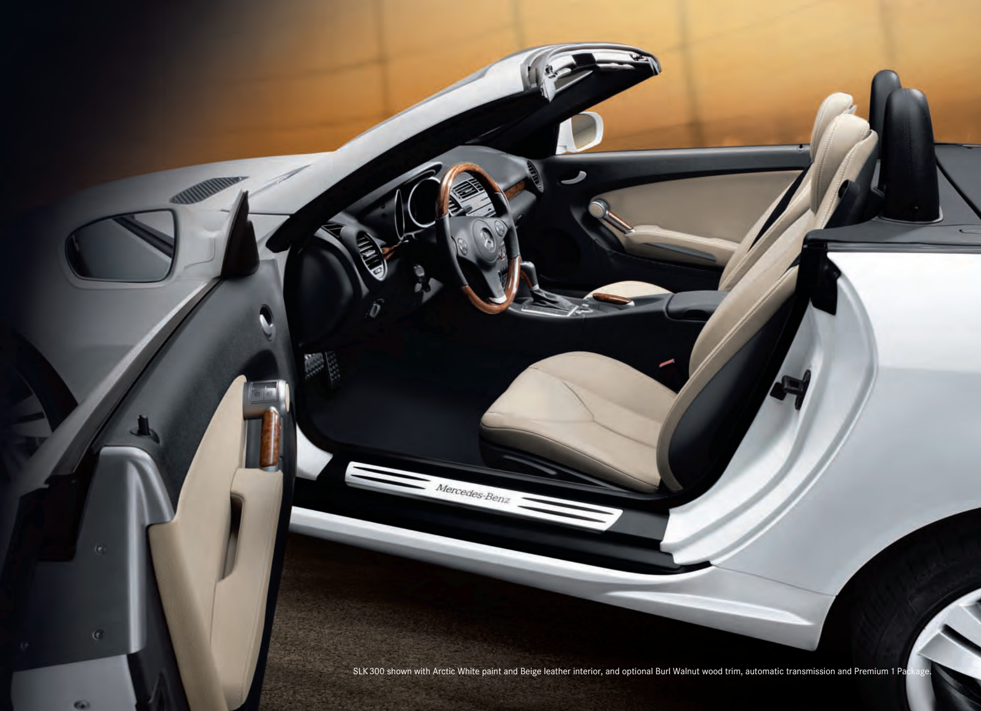
SLK300 shown with Arctic White paint and Beige leather interior, and optional Burl Walnut wood trim, automatic transmission and Premium 1 Package.