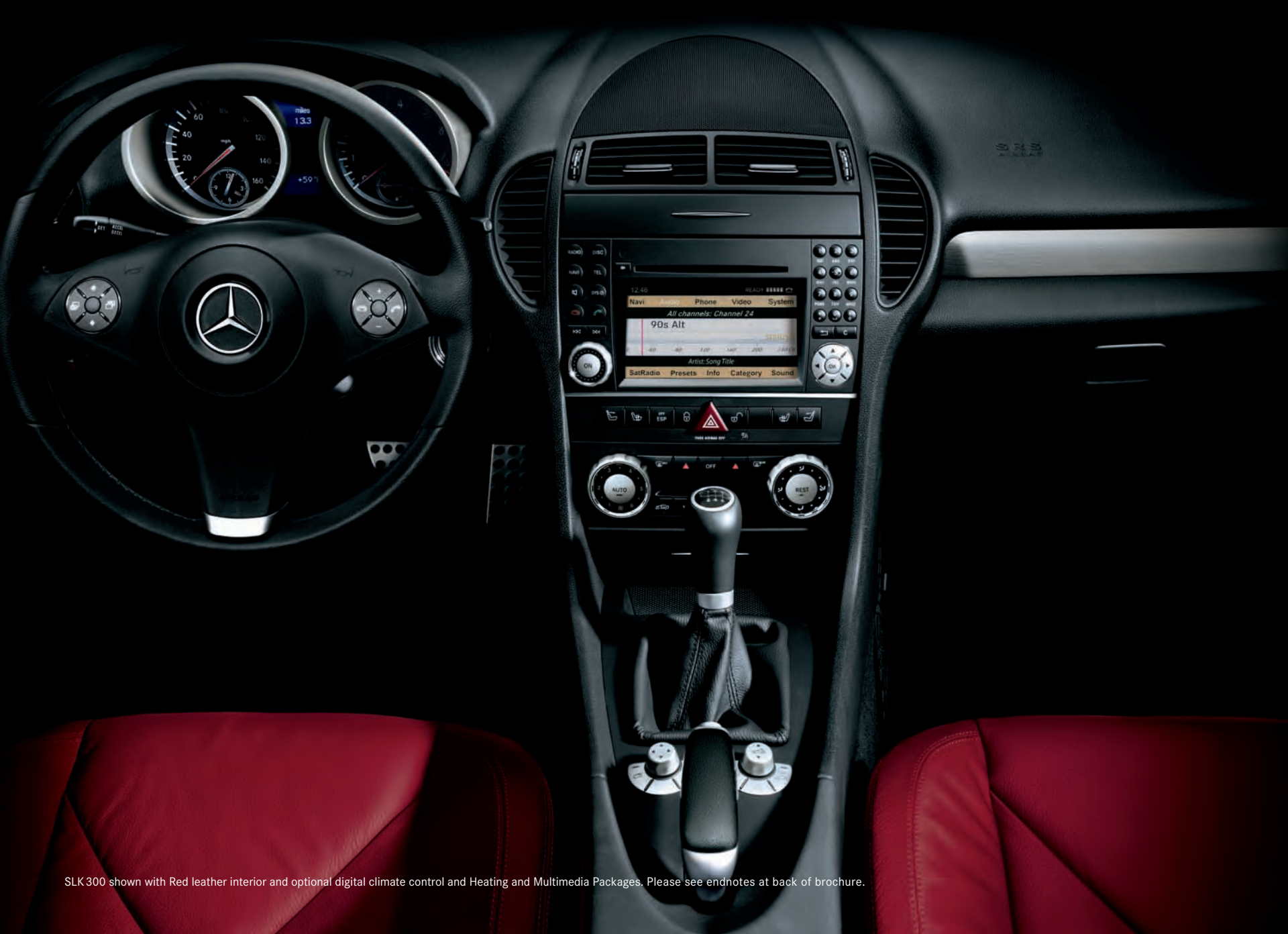
SLK300 shown with Red leather interior and optional digital climate control and Heating and Multimedia Packages. Please see endnotes at back of brochure.