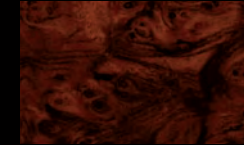
Burl Walnut wood 15

Agreement is required for service to be active. Some services are only available on select vehicles. Your PIN is required in order to use certain services. See your dealer or www.mbusa.com/mbrace for details, including a list of compatible smartphones.