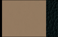
Natural Beige 15