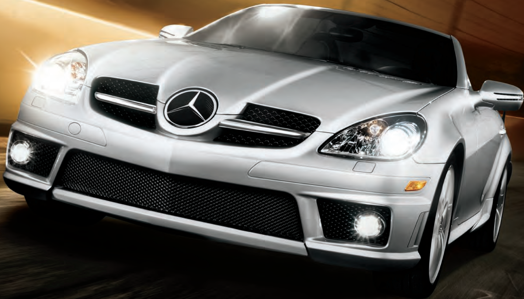
SLK350 shown with optional Iridium Silver metallic paint and Lighting and Premium 1 Packages.