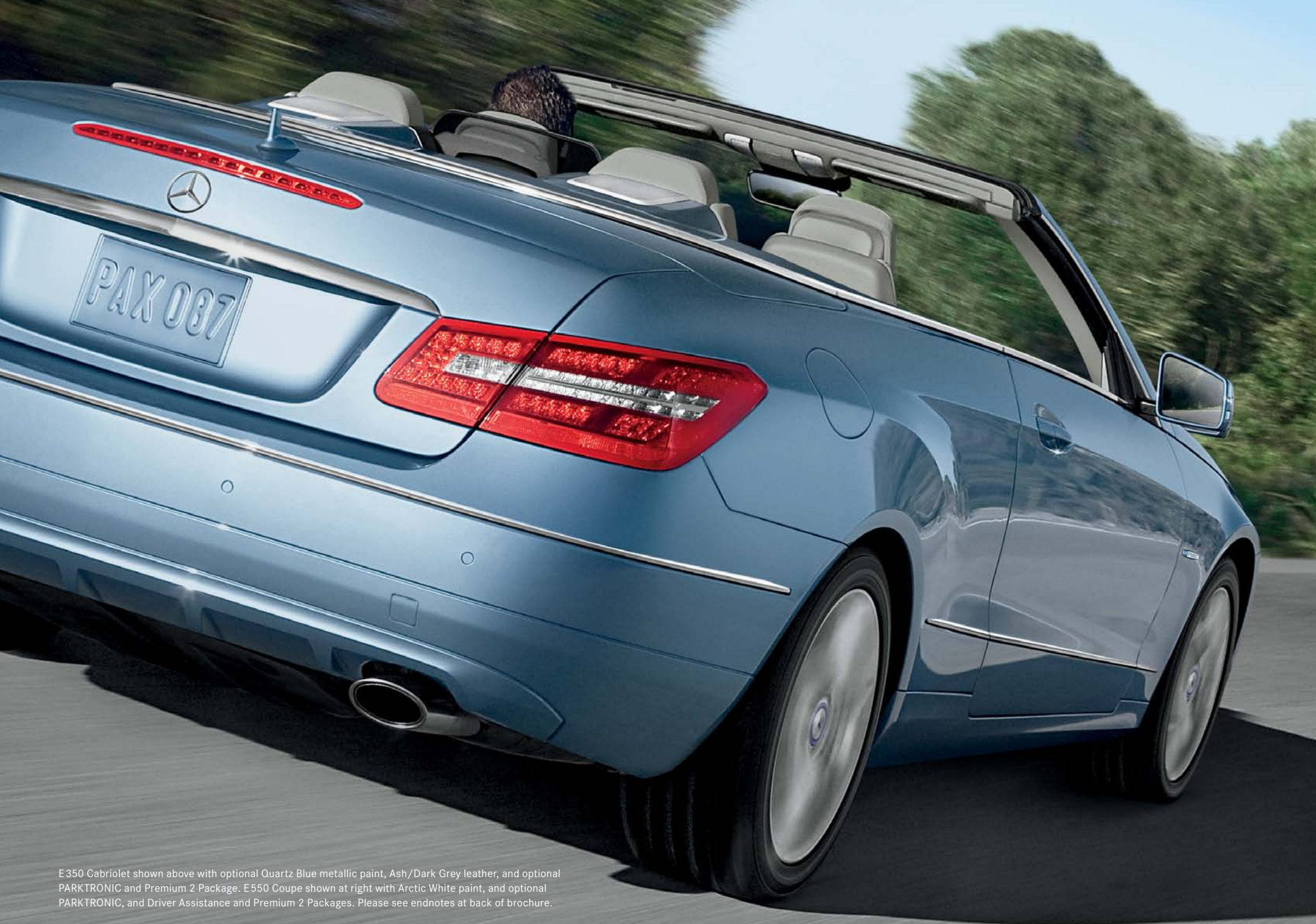
E 350 Cabriolet shown above with optional Quartz Blue metallic paint, Ash/Dark Grey leather, and optional PARKTRONIC and Premium 2 Package. E 550 Coupe shown at right with Arctic White paint, and optional PARKTRONIC, and Driver Assistance and Premium 2 Packages. Please see endnotes at back of brochure.