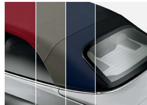
Red Beige Blue Black

individually chosen. exquisitely crafted.