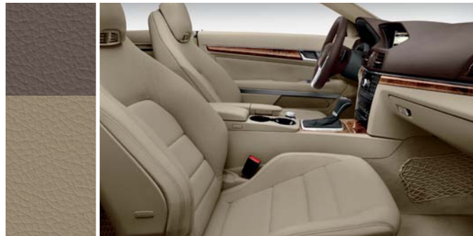
Almond Beige/Mocha Brown (with Burl Walnut wood)