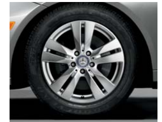
Standard 17" split 5-spoke (E 350)