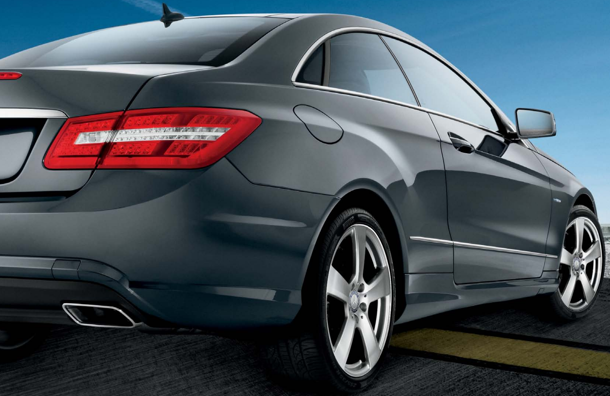
E 550 Coupe shown with optional Palladium Silver metallic paint and Premium 2 Package. Please see endnotes at back of brochure.