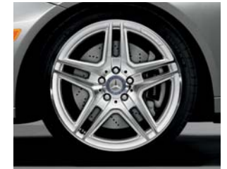
Optional 18" AMG twin 5-spoke (Appearance Package)