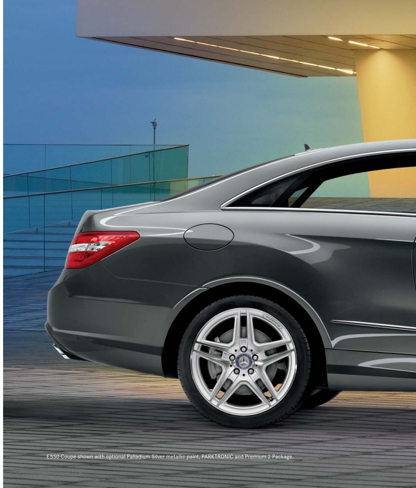
E550 Coupe shown with optional Palladium Silver metallic paint, PARKTRONIC and Premium 2 Package.