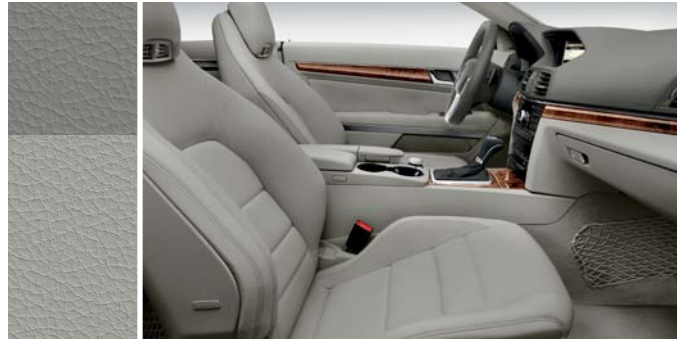
Ash/Dark Grey (with Burl Walnut wood)