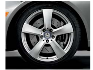
Standard 18" 5-spoke (E 550)