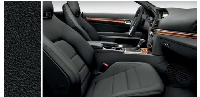
Black (with Burl Walnut wood)