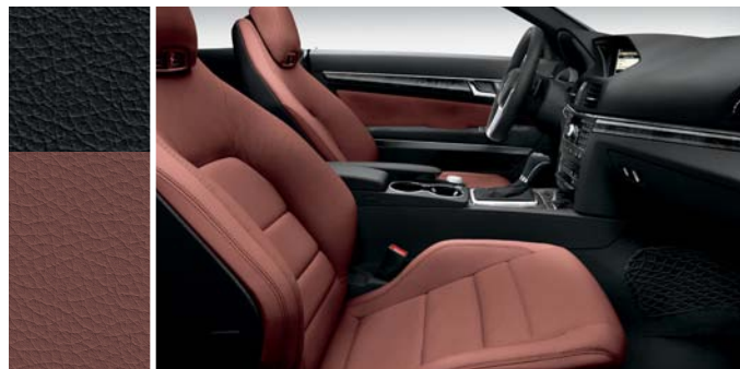
Red/Black (with Black Ash wood)