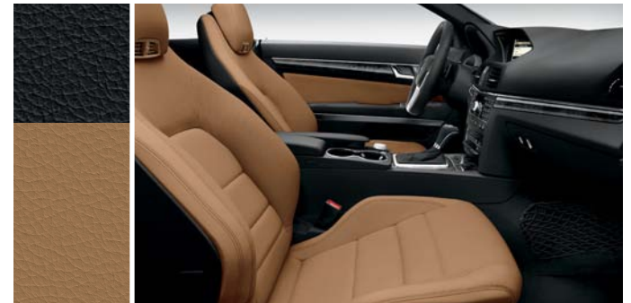
Natural Beige/Black (with Black Ash wood)