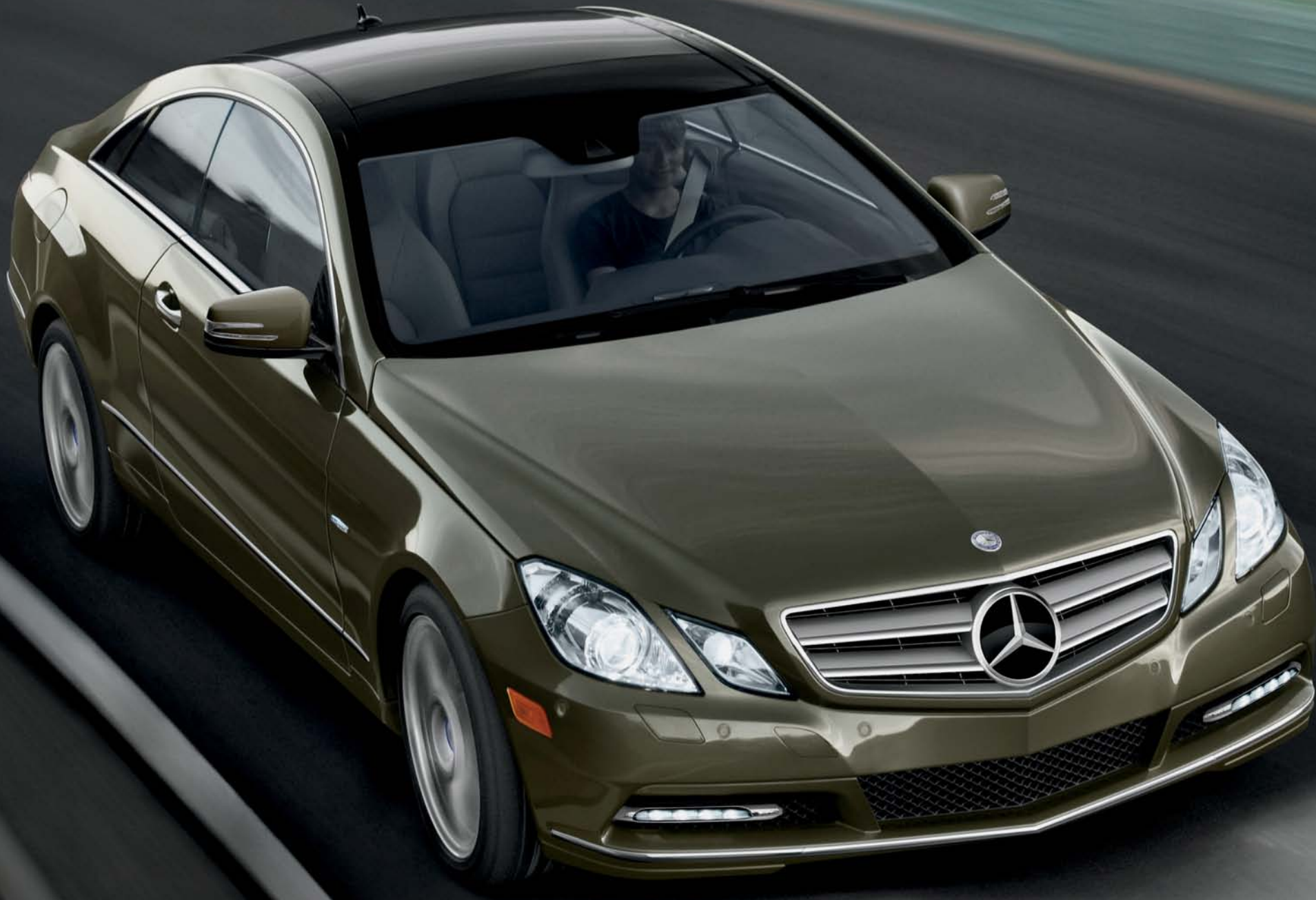
E 350 Coupe shown with optional Olivine Grey metallic paint, PARKTRONIC, and Driver Assistance and Premium 2 Packages. Please see endnotes at back of brochure.