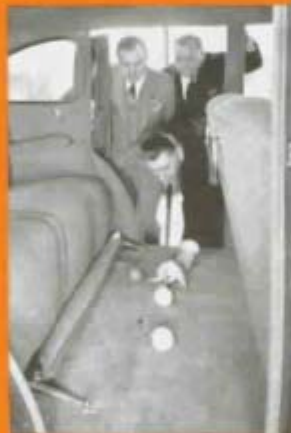
No. 1 in Clear Level Floors (see No. 12)—Extra comfort and convenience.