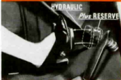
No. 1 in Safe Stopping (see No. 38)—Duo-Automatic Hydraulics stops in half the required distances.