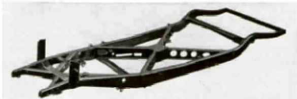
No. 1 in Frame Ruggedness (see No. 36)—"Backbone" to withstand road shocks.