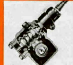
No. 1 with Roller-Tooth Steering (see No. 40).

a high chrome alloy cylinder block and crankcase . . . so hard that special valve seat inserts are unnecessary. This hard, wear-resisting metal reduces cylinder wear, makes frequent valve grinding unnecessary. Your motor lasts longer.