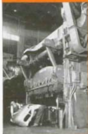
No. 1 in Steel Body Experiences (see No. 5)—More safety and ruggedness.