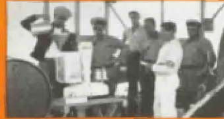
No. 1 in Proved Economy (see No. 30)—Saves fuel!