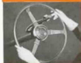
No. 1 with Selective Automatic Shift (see No. 11)—The car almost drives itself.