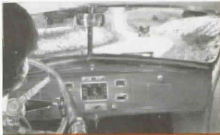
No. 1 in Driving Vision (see Nos. 19, 20 and 21)—Full view of the road . . . instruments read at a glance.