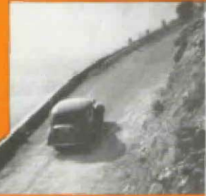
No. 1 in Horsepower (see No. 28)—Power to climb hills.

the low price field. Here is a real three-passenger front seat.