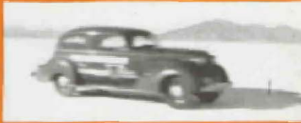
No. 1 in Performance (see No. 27)—Holds eight officially certified records.