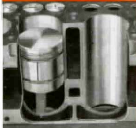
No. 1 with Chrome Alloy Cylinder Block (see No. 37).