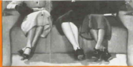
No. 1 in Clear, Level Floors (see No. 12)—Clear foot room for three, front and rear. The roomiest seats and the roomiest, level floors.