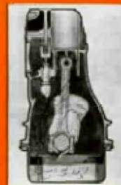
No. 1 in Efficient Lubrication (see 35).