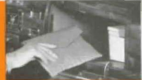
No. 1 in Package Locker Space (see No. 22)—More useful room!