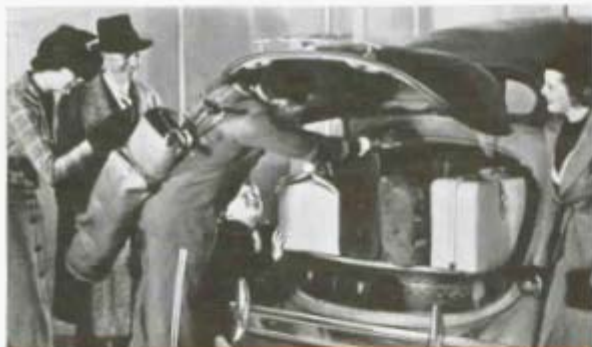
No. 1 in Trunk Space (see No. 5)—Room for all the luggage you need.