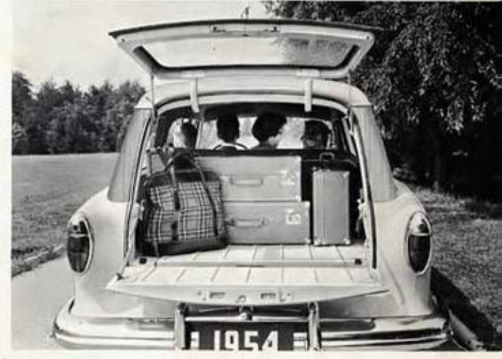
Over six feet of carrying space.

Double your money's worth with the All-Purpose Station Wagon that's both a luxury sedan and practical utility car. Best of all, with double-rigid unitized Airflyte Construction, it's rattle-proof. The rear seat folds down flush with the floor to provide over six feet of carrying space. Enhancing the beauty of the continental-style hood is the optional hood ornament created by George Petty, famous artist.