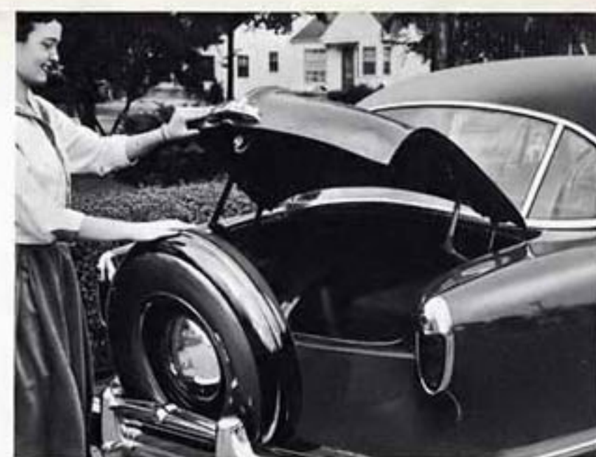
Smart, new Continental rear tire mount.

Here, in the only American convertible styled by Pinin Farina, you enjoy all the thrill of the open car with sedan comfort—with the life-saving safety of exclusive Nash Airflyte Construction and steel girder rails overhead. Electrically-operated top glides into place at the mere touch of a button. And think of it—a rattle-proof convertible