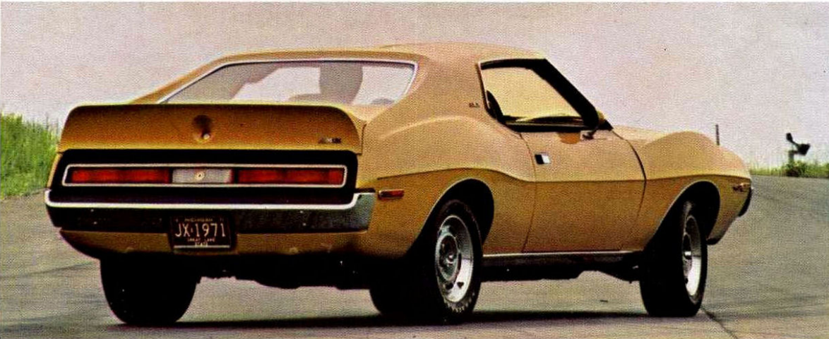
Top: Javelin SST with Twin Canopy roof and vinyl inserts.