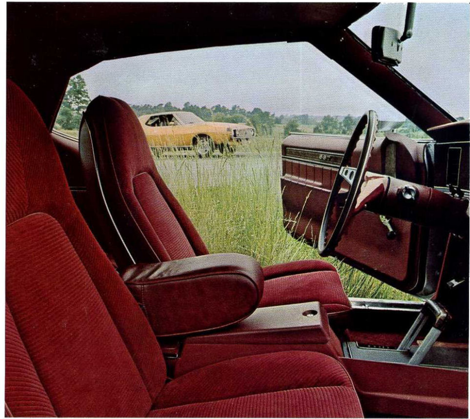
Left: Javelin's bucket seats in optional vinyl and corduroy fabric, with center armrest.