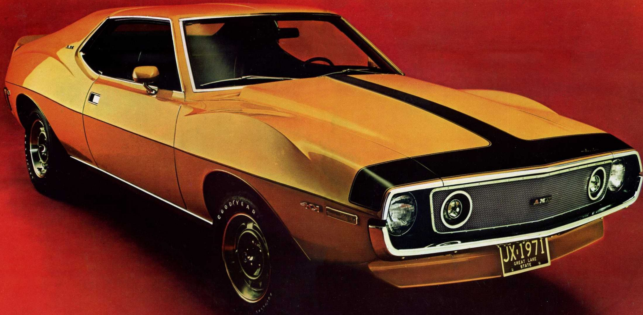
1971 Javelin/AMX with Twin Canopy roof, special T-striping and front and rear air spoilers.