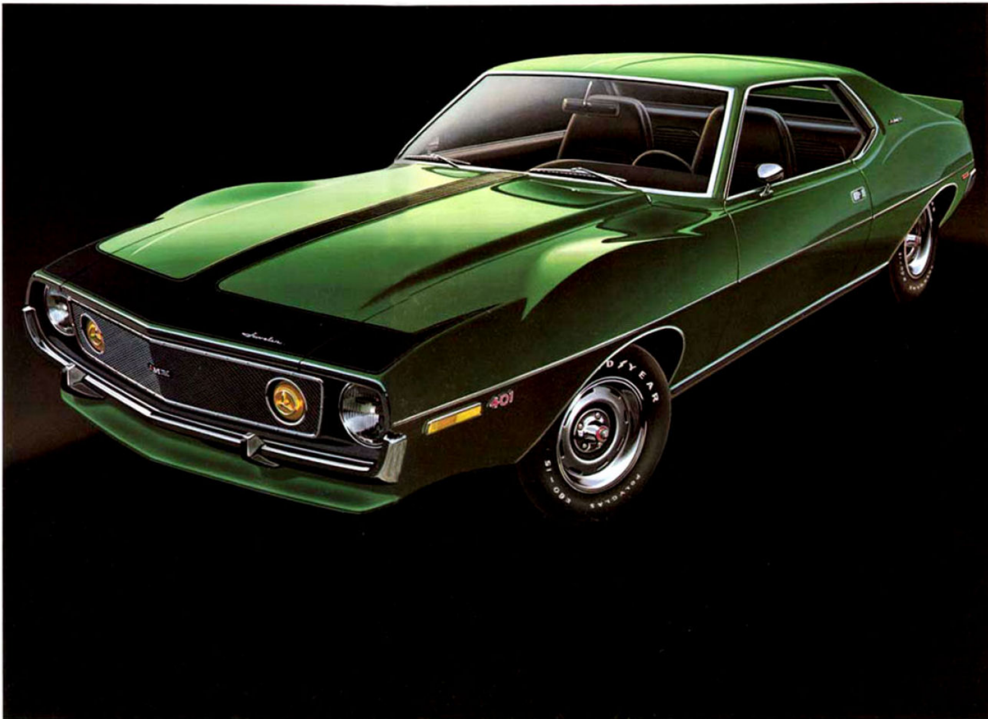
Javelin AMX with optional 401 "GO" package and front spoiler.

Javelin has the sleek, low slung look of action and it more than lives up to its looks. There are two Javelin models, Javelin SST and Javelin AMX. The SST is distinguished by a smart new rectangular, cross-hatched grille. Interiors abound with custom touches that mark the fine touring machine. Floors are richly carpeted. Fine, supple vinyl is the standard trim and a luxurious nylon corduroy fabric optional. Even for a sporty car, Javelin is out of the ordinary. A choice of six engines from the economical and peppy 232 CID six to the potent 401 CID V-8 give an exceptional range of power. Four transmissions are offered including a smoother "Torque-Command" automatic, either column or floor mounted and a fully synchronized four speed floor mounted manual. In all—13 power teams. In appearance and performance, Javelin is one of the finest expressions of sporty personalized transportation ever to leave an American factory.