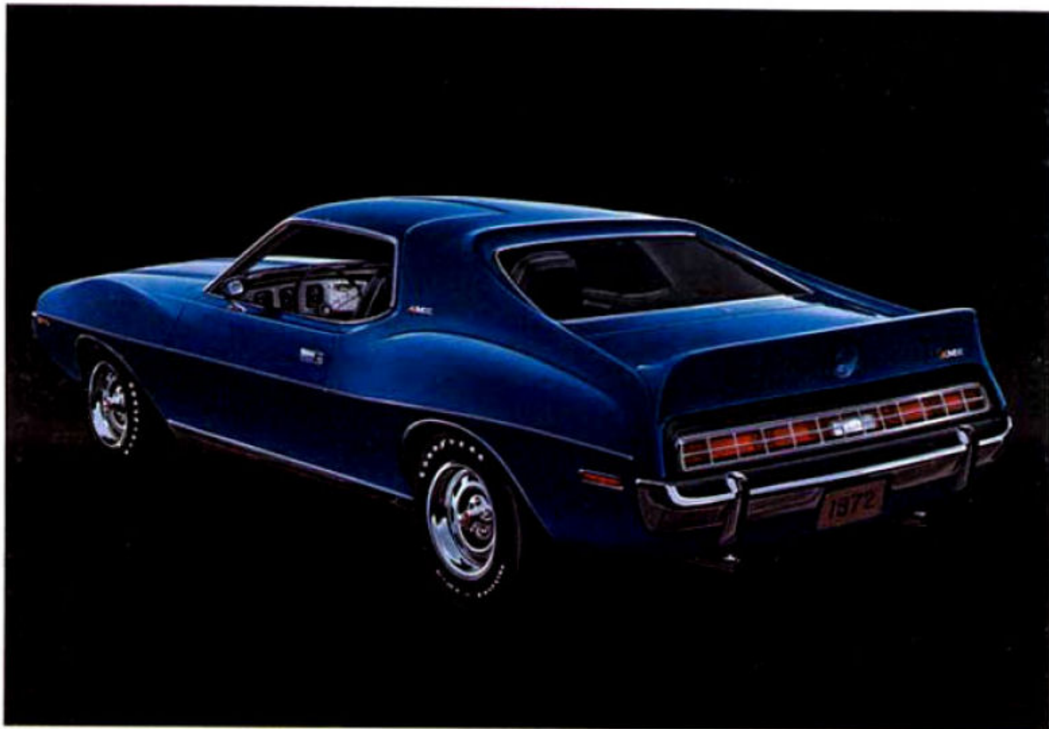
Javelin AMX with standard rear deck spoiler.