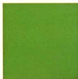
E3 Fairway Green, Met. All models (2)