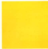
F4 Daisy Yellow Javelin, Matador & Ambassador