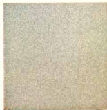
E5 Pewter Silver, Met. All models (1) (2) (3)