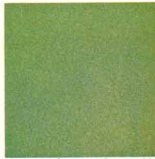
C8 Grasshopper Green, Met. All models (2)