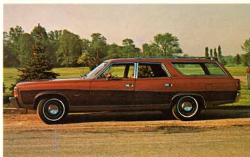
Ambassador Brougham Station Wagon