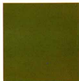
E4 Tallyho Green, Met. All models (2)