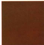
F5 Vineyard Burgundy, Met. Javelin, Matador & Ambassador