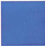
F2 Maxi Blue Gremlin, Hornet & Javelin (1)