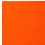
D7 Trans-Am Red All models (1) (3)