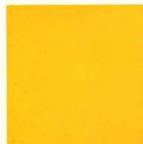
E9 Mellow Yellow Gremlin & Hornet (1)