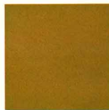
E7 Copper Tan, Met. All models