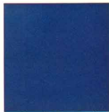
E2 Olympic Blue, Metallic All models (1)