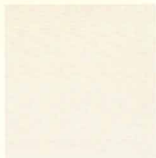
A1 Snow White All models (1) (2) (3)