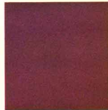
F3 Fresh Plum, Met. Gremlin, Hornet & Javelin (1) (3)