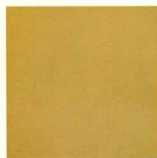
E6 Fawn Beige All models (2)