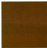
D4 Cordoba Brown, Metallic Javelin, Matador & Ambassador