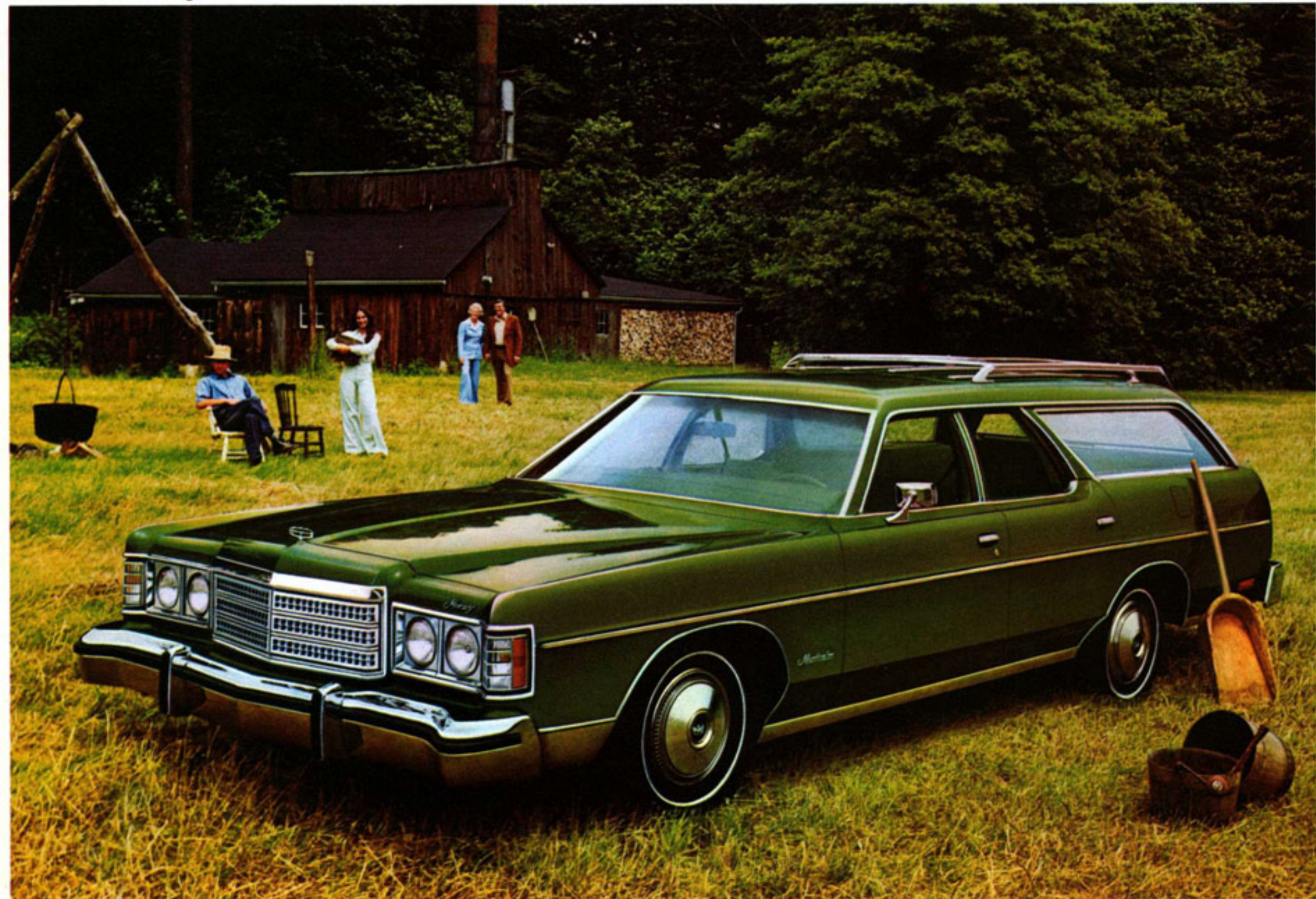
Montcalm station wagon.

Certain items illustrated are optional at additional cost.