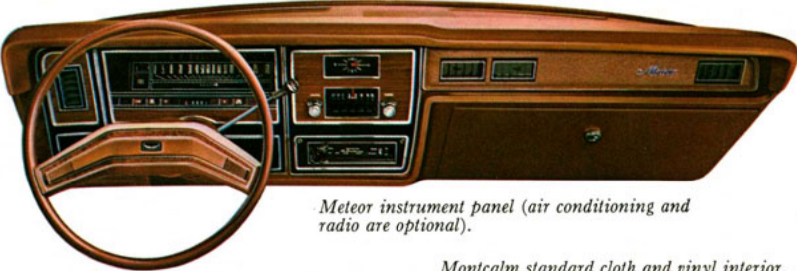
Meteor instrument panel (air conditioning and radio are optional).

Finally another solid reason for choosing a Mercury Meteor is the wide range of options offered. These appearance, convenience and functional options can both personalize your Meteor and add to its value at resale time. Your Mercury dealer will be happy to help