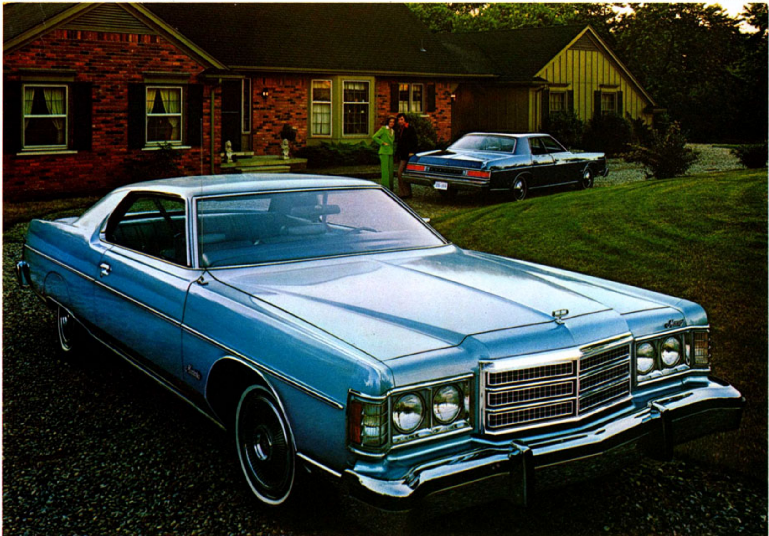
Background—Montcalm 4-door pillared hardtop.