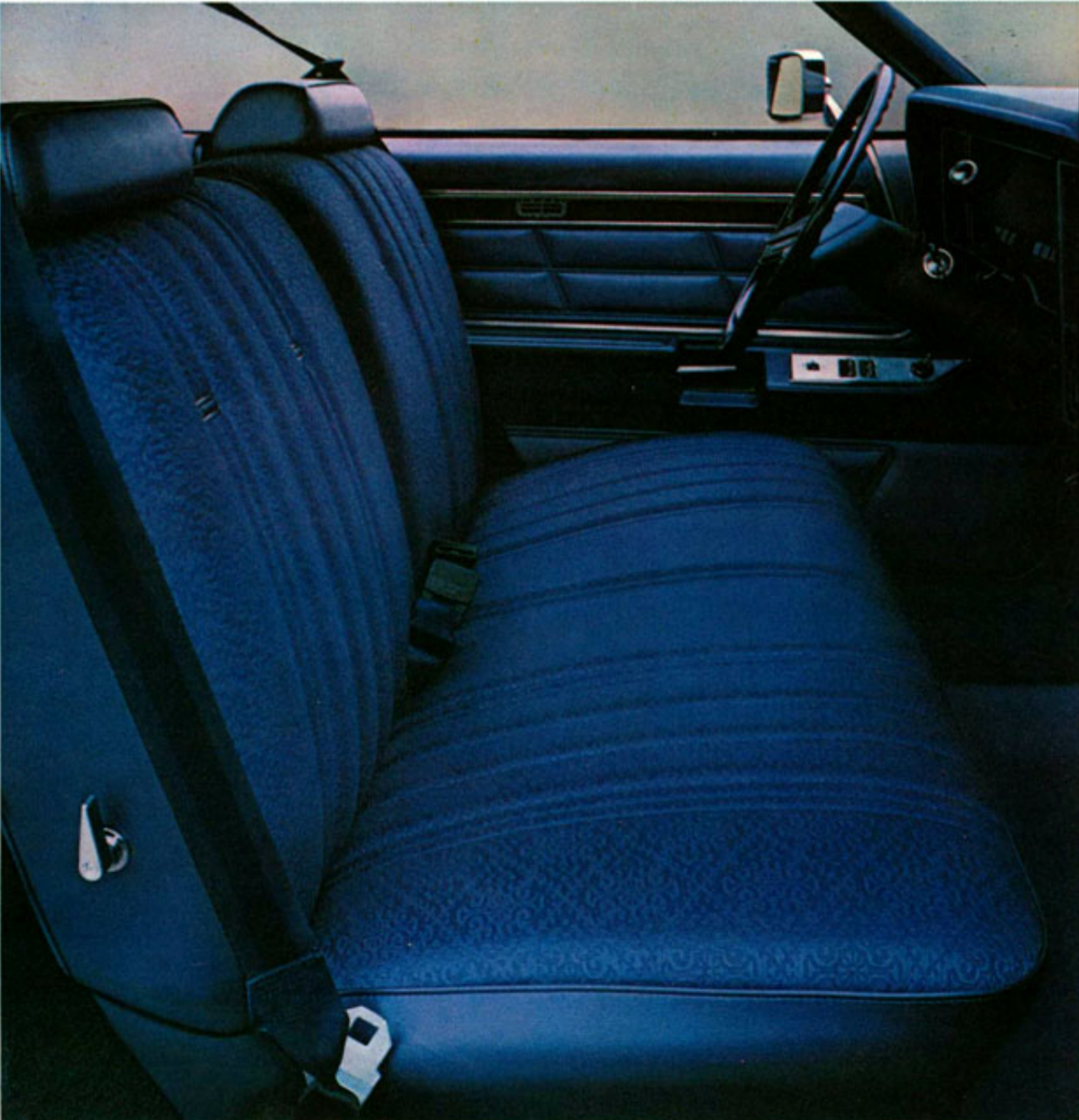
Montcalm standard cloth and vinyl interior.