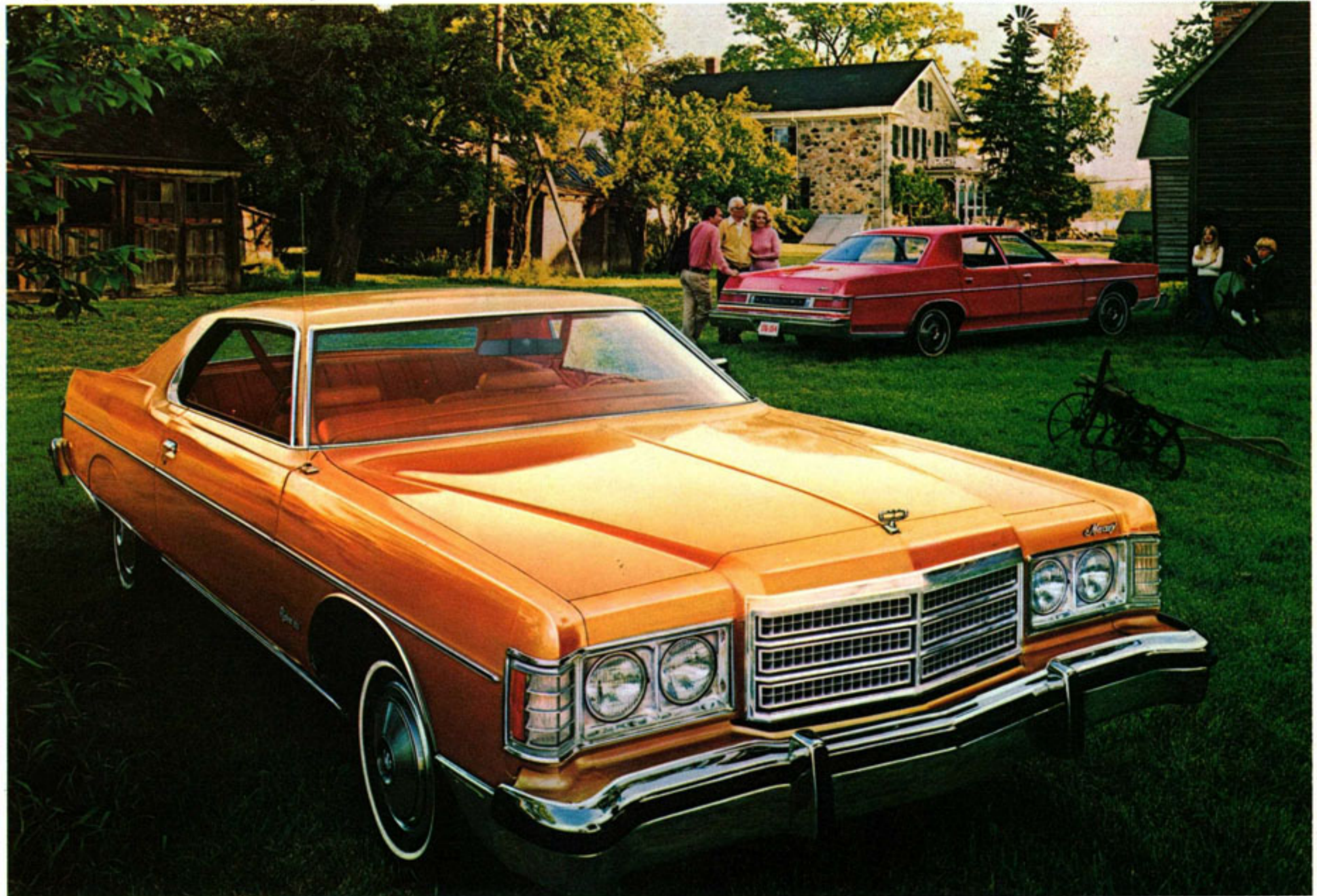
Background: Rideau 500 4-door pillared hardtop.