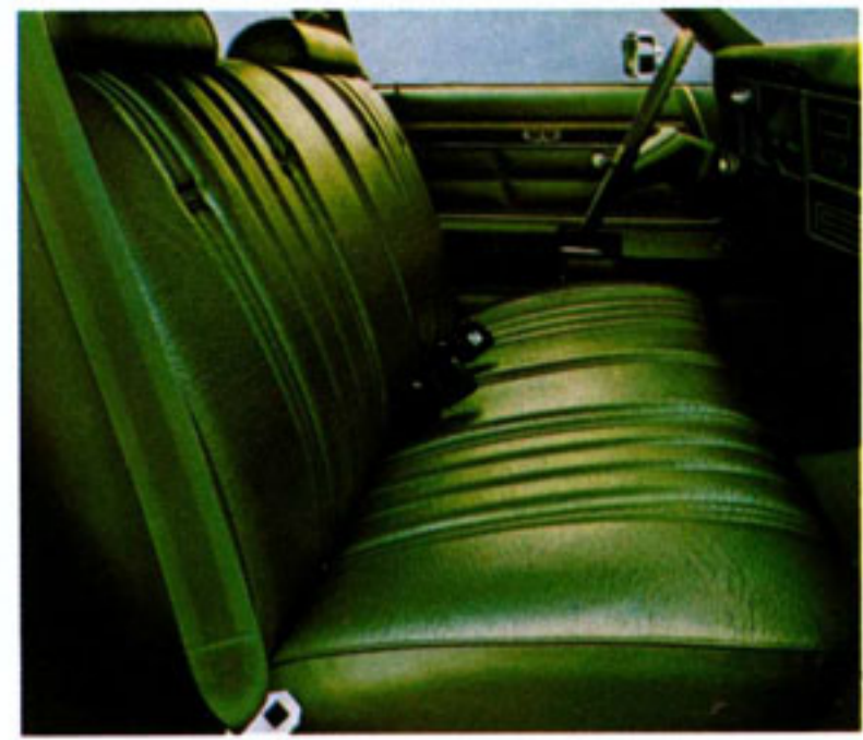
Above: Montcalm optional all-vinyl interior (standard on Montcalm station wagon)