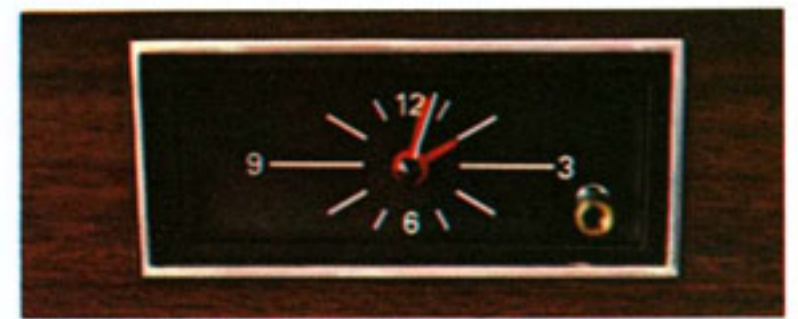
Optional electric clock.

noise and vibration. Rideau 500 is as smooth as it is quiet. That's the kind of thing we mean by value.