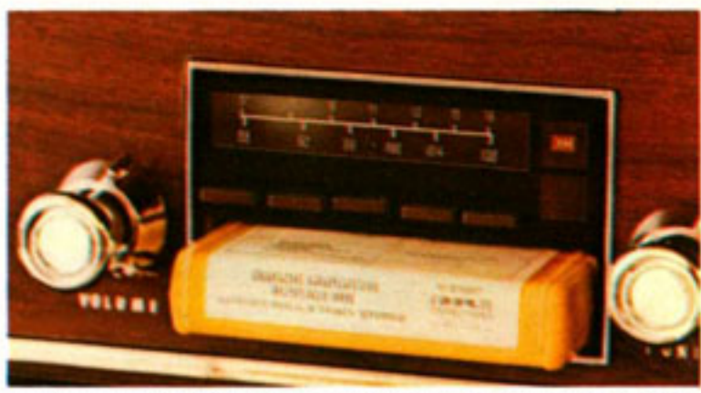
Optional AM/FM multiplex stereo radio with stereo tape.

As well as experiencing comfort in a Meteor interior, you and your passengers will experience the peace of quiet. Many pounds of sound deadening materials are placed strategically throughout Meteor's body for a truly enjoyable ride. Quiet and comfort are two more reasons that make 1975 Mercury Meteor a solid sensible buy.