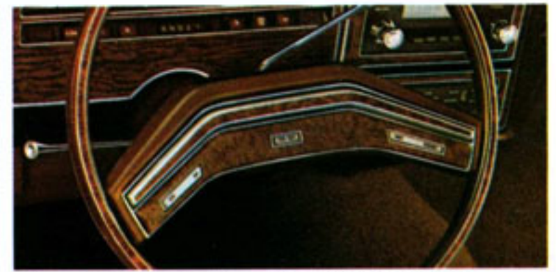
Optional fingertip speed control with new 2-spoke rim blow steering wheel.

To give your 1975 Montcalm a more distinctive and "personally yours" look, there is a wide array of options to choose from like: fender skirts; glamour metallic paint; vinyl roof; luxury wheel covers;