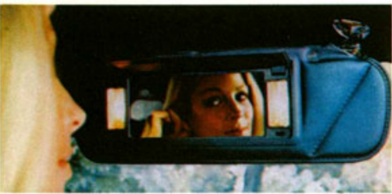
Optional illuminated visor-mounted vanity mirror.

Look below at the interior of a Mercury Meteor. It may come as a surprise to you that this is a standard interior. The picture tells you that it is beautiful, but you really have to experience this comfort to fully appreciate it.