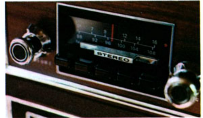
Optional AM/FM multiplex stereo radio.

bodyside mouldings with vinyl insert; and more.