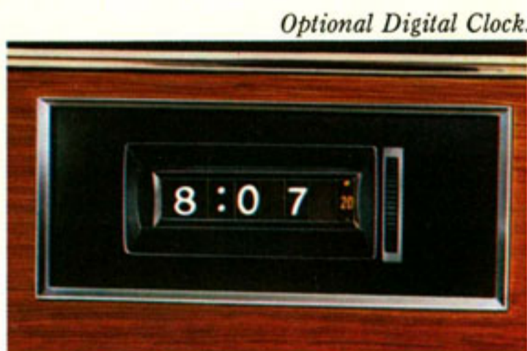
Optional Digital Clock.

you select the choice of options that best suit your needs. A number of the more popular options are illustrated and described throughout this brochure.